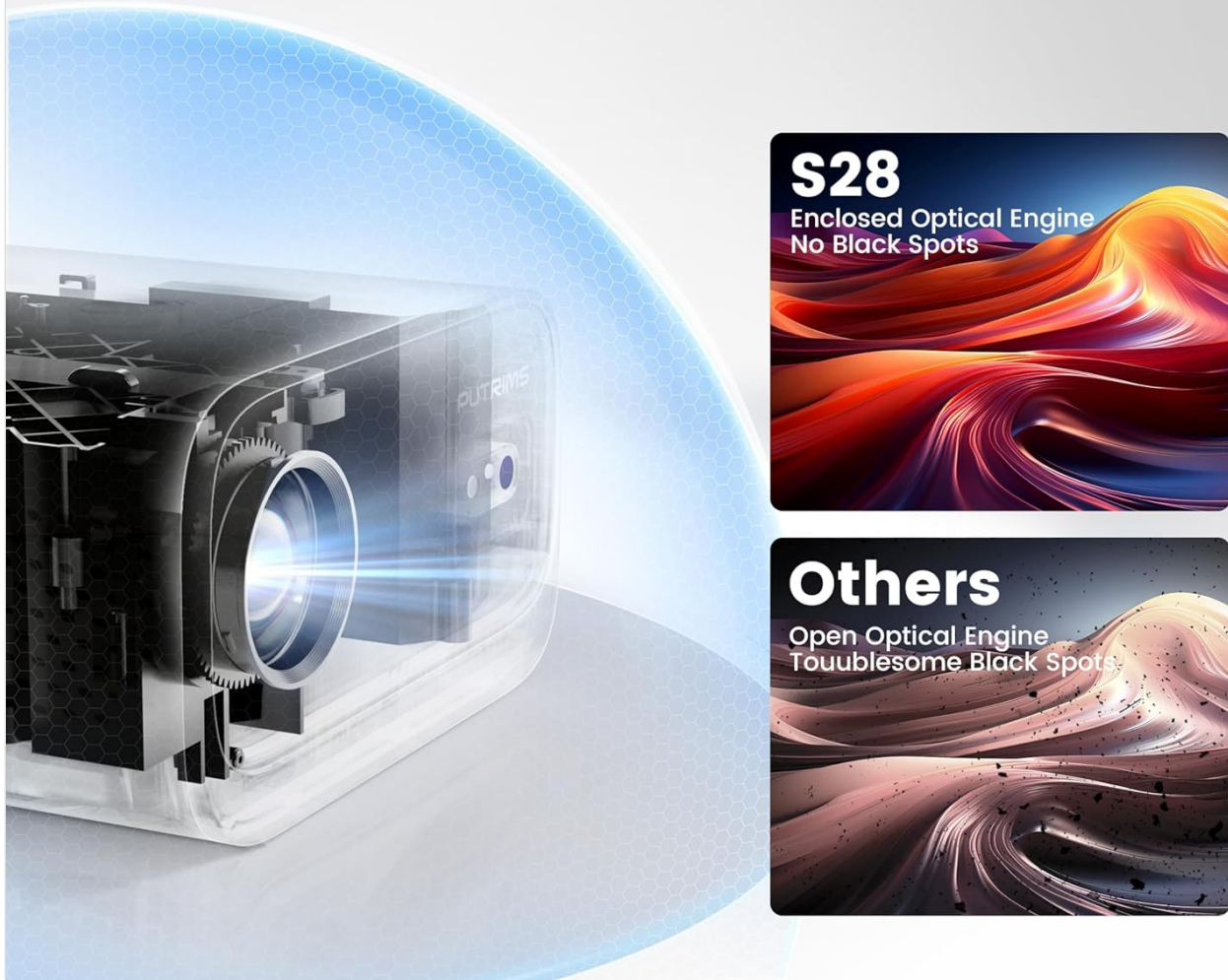
Figure 2.3.3: Diagram illustrating the True Closed Optical Engine, highlighting its design to effectively block black and blue spots, ensuring a clear and consistent image over time.

Effectively blocks black spots & blue spots