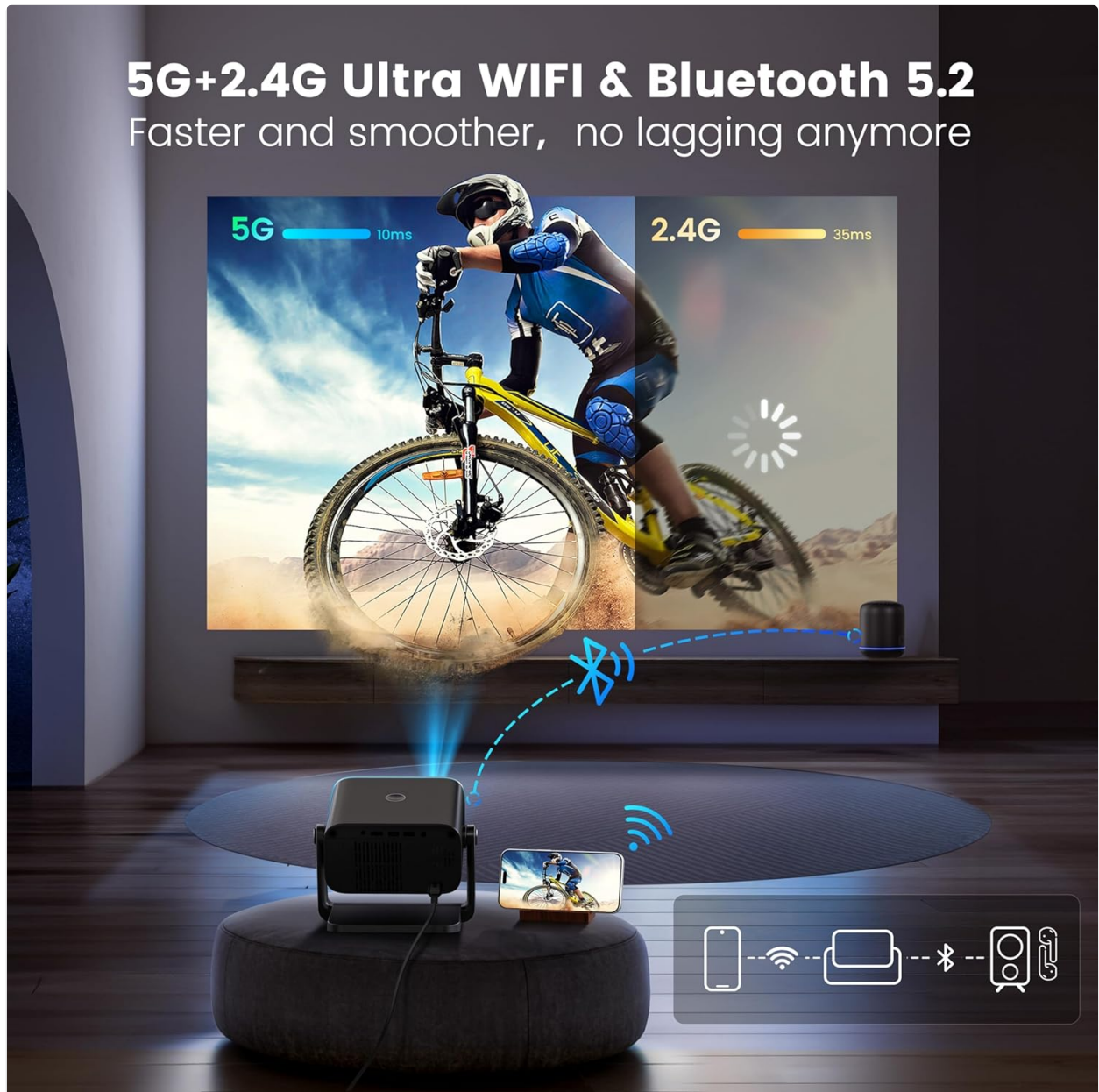
Figure 4.2.1: Demonstrating the dual-band 5G and 2.4G WiFi connectivity for fast and smooth streaming.

Note: Due to HDCP copyright restrictions, streaming services like Netflix and Disney+ require a TV stick (sold separately) for playback. Wired screen mirroring is also supported for seamless YouTube streaming.