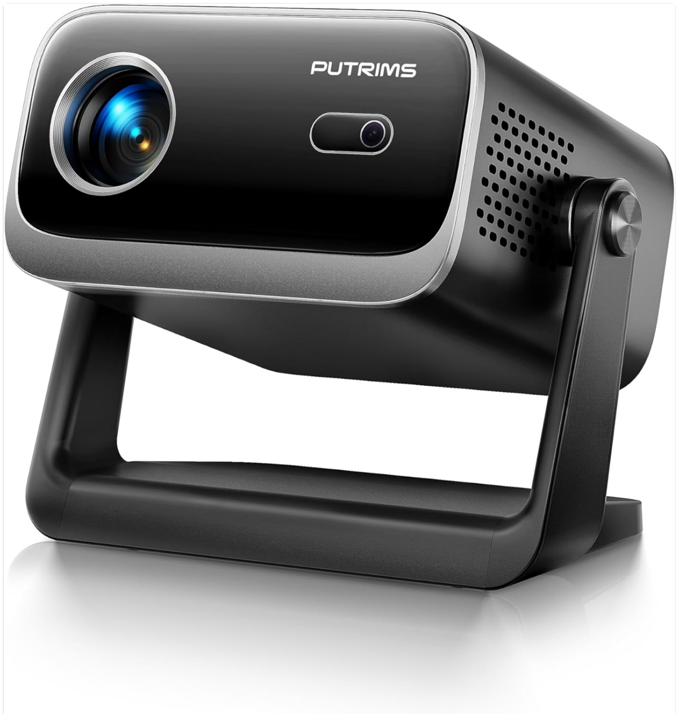
Figure 2.3.1: Front view of the PUTRIMS S28 Mini Projector, showcasing the lens and focus adjustment.