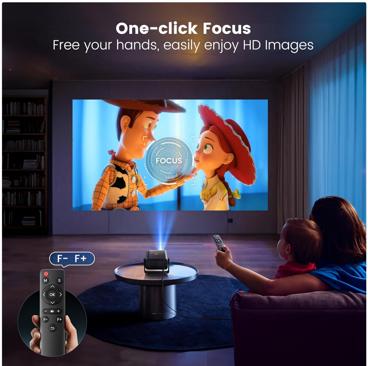
Figure 3.6.1: Adjusting focus using the remote control for a sharp image.