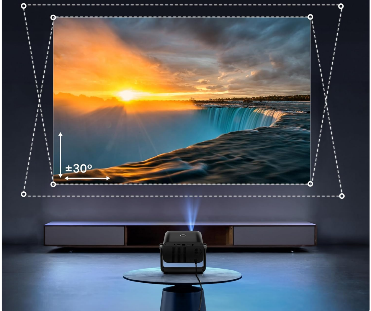
Figure 3.7.1: Visual representation of automatic vertical keystone correction, ensuring a rectangular image even when the projector is tilted.