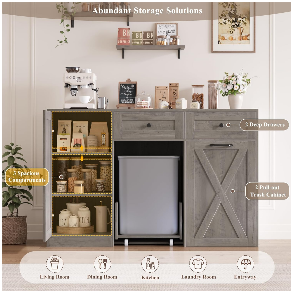
Figure 2.2: Illustration of the cabinet's abundant storage solutions, including the side cabinet with adjustable shelves, two deep drawers, and two pull-out trash compartments.