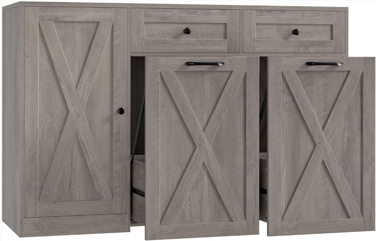
Figure 2.1: The HOSTACK 12.5 Gallon Double Pull-Out Kitchen Trash Cabinet in Ash Grey, showcasing its overall design and functionality.