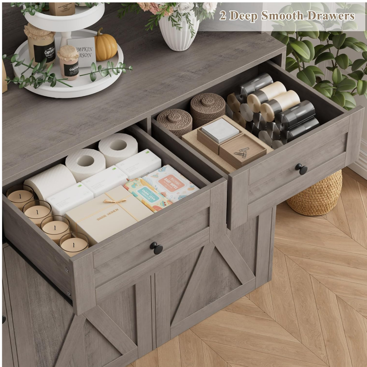
Figure 4.2: A close-up view of the two deep, smooth-gliding drawers, demonstrating their capacity for various items.