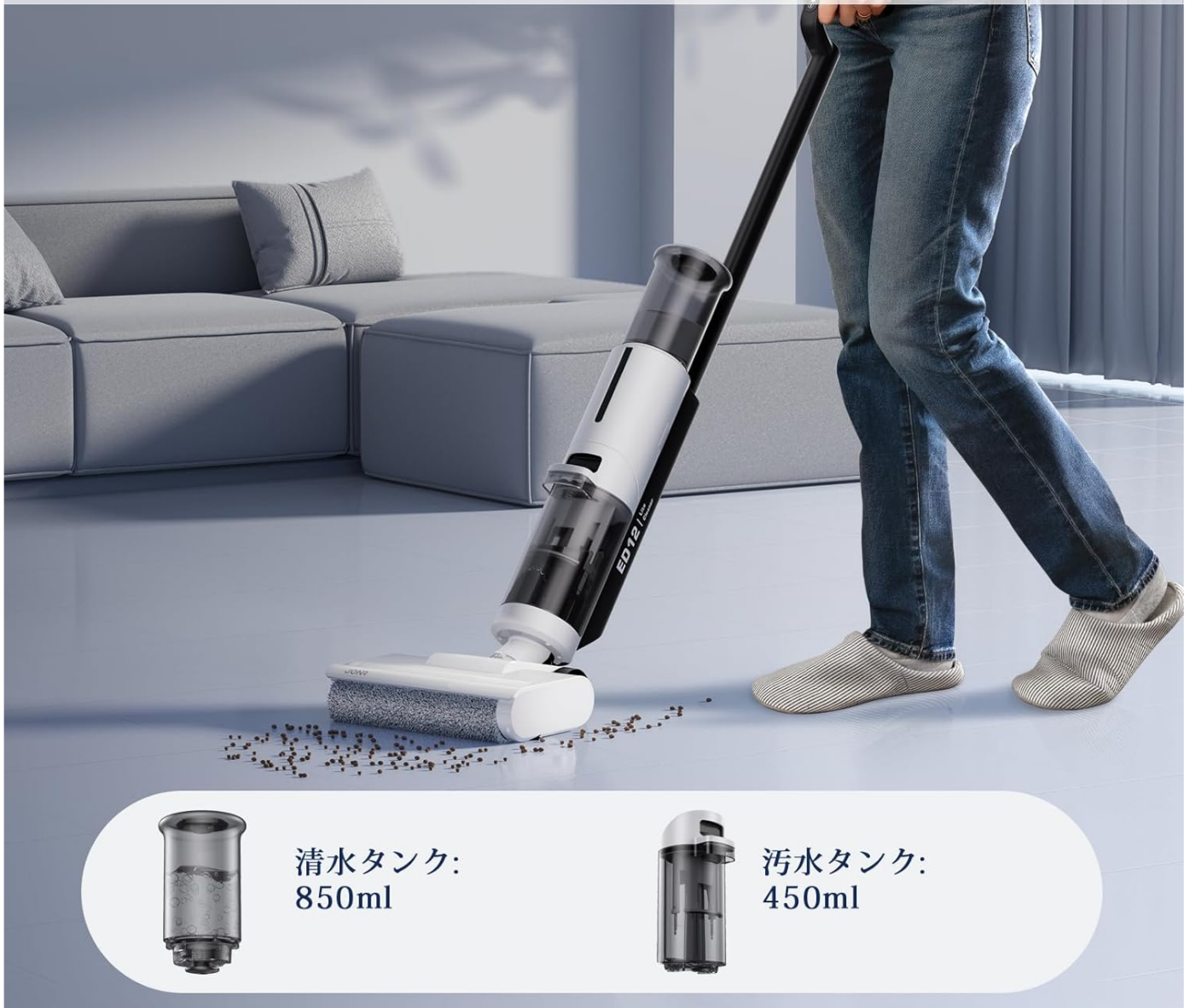
Figure 3.1: The clean water tank (850ml) and dirty water tank (450ml) are easily accessible for filling and emptying.