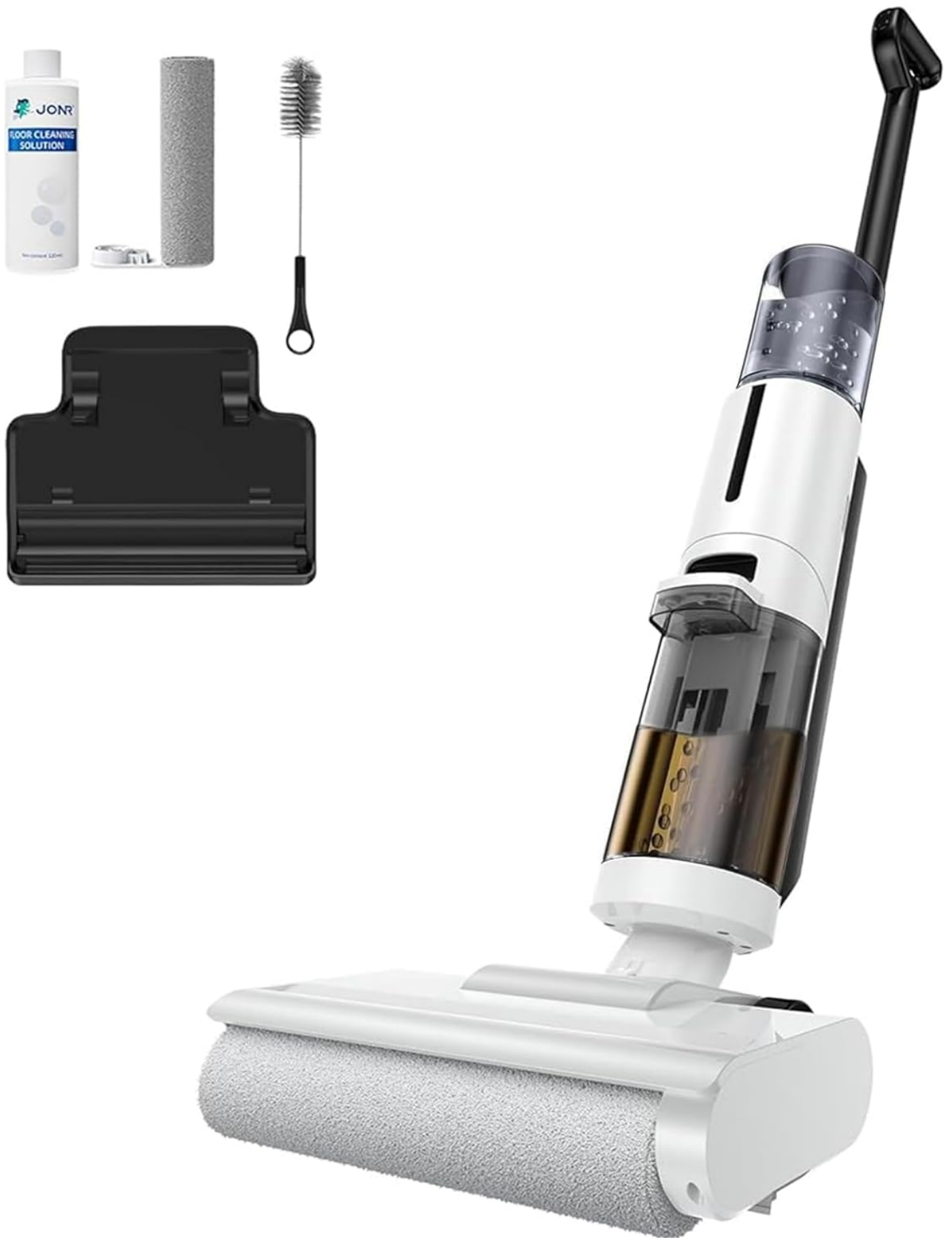
Figure 2.1: JONR ED12 Lite 3-in-1 Cordless Wet & Dry Stick Vacuum Cleaner.