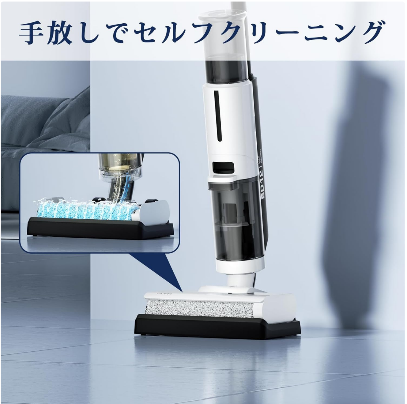
Figure 5.1: The cleaner performs an automatic self-cleaning cycle when placed on the charging dock.

Your browser does not support the video tag.