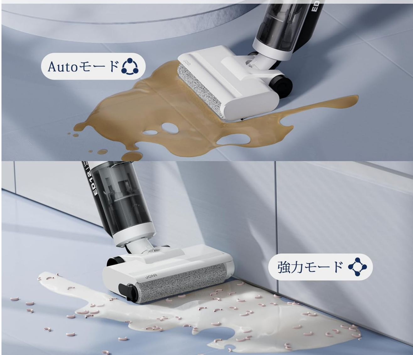
Figure 4.1: The cleaner can operate in Auto mode for general cleaning or Powerful mode for tougher messes.