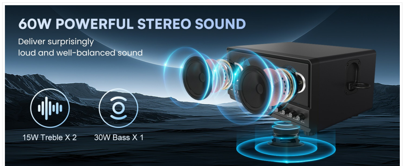
Image: Diagram illustrating the 60W powerful sound components of the RHM L268, including tweeters and subwoofer.