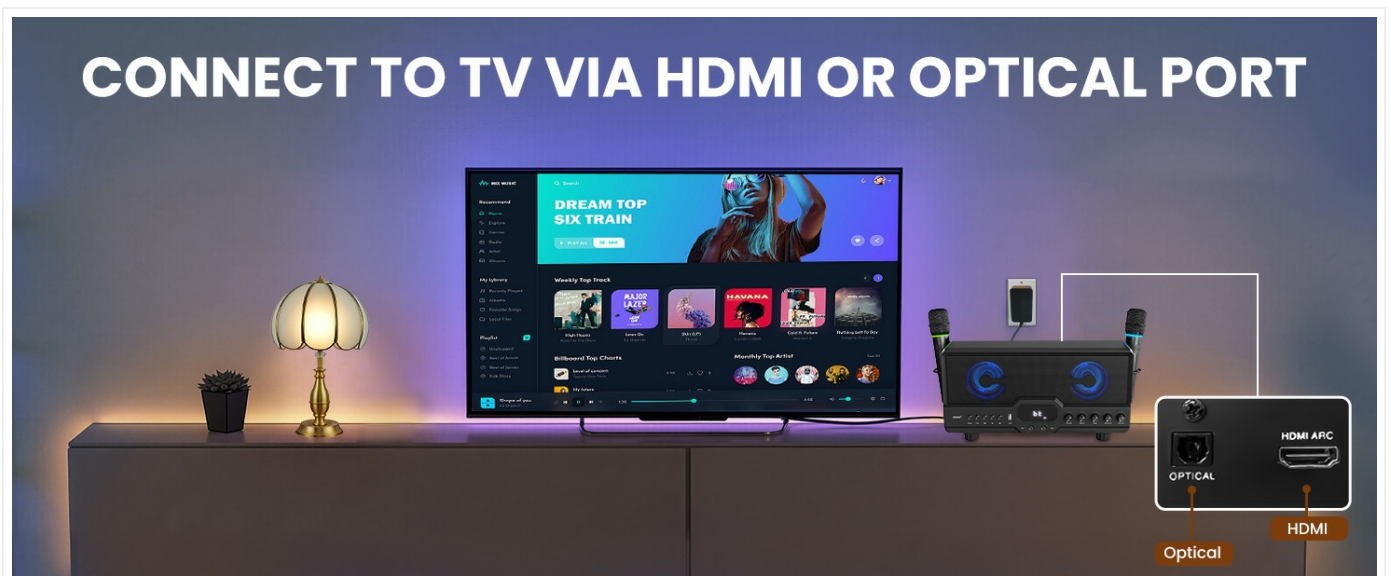
Image: RHM L268 Karaoke Machine connected to a television, highlighting the HDMI ARC and Optical input ports on the TV.

The RHM L268 offers HDMI and Optical connections for TV audio output. Ensure your TV has an HDMI ARC port for optimal sound transmission. Only one HDMI port on your TV will typically be designated as HDMI ARC.