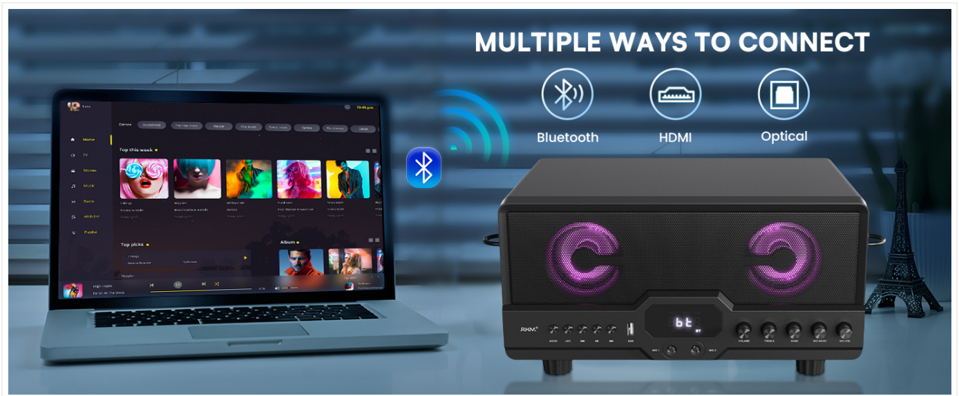
Image: RHM L268 Karaoke Machine demonstrating multiple connection methods including Bluetooth, HDMI, and Optical.

for "RHM L268". Select it to pair. You can then play music from your device's singing apps through the karaoke machine.