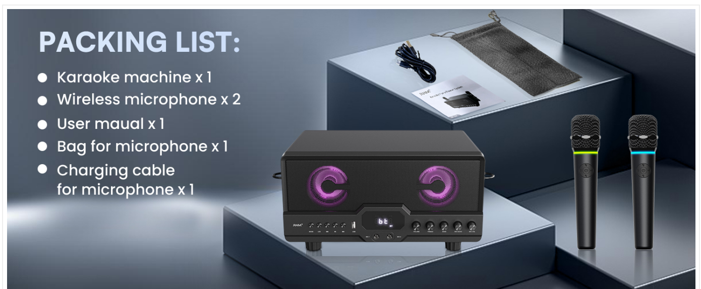
Image: RHM L268 Karaoke Machine showing the bass and treble adjustment knobs on the control panel.

You can adjust the bass and treble levels directly using the dedicated knobs on the karaoke machine. This allows you to customize the audio output to your preference for a rich and immersive sound experience.