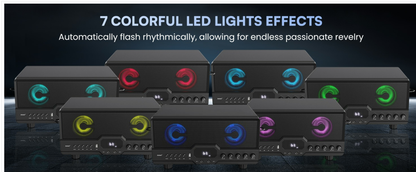
Image: RHM L268 Karaoke Machine showcasing its seven colorful LED lighting effects.

The RHM L268 features built-in LED lights with two lighting modes and seven color-changing options. Press the LED button on the speaker to turn the lights on/off or cycle through the modes. These lights synchronize with the music, enhancing the karaoke atmosphere. They can be turned off at any time if not desired.