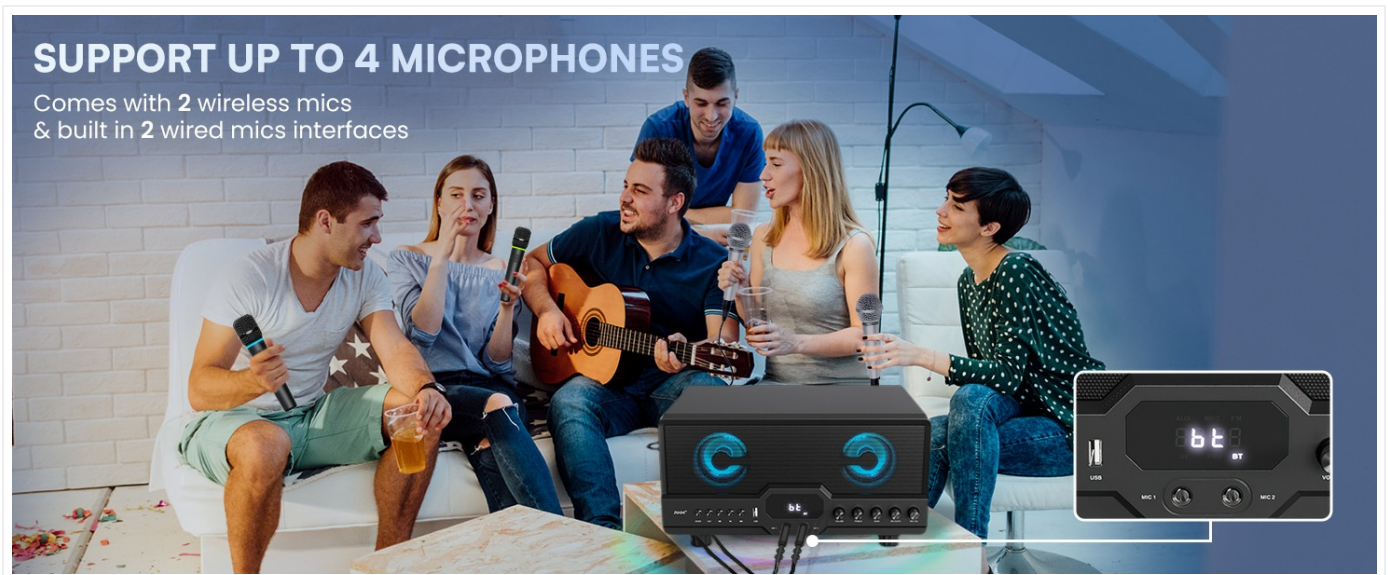
Image: RHM L268 Karaoke Machine supporting up to four microphones, showing two wireless mics and inputs for two wired mics.

Additionally, the machine features two built-in 6.5mm jacks, allowing you to connect two extra wired microphones (not included) for a total of four singers.