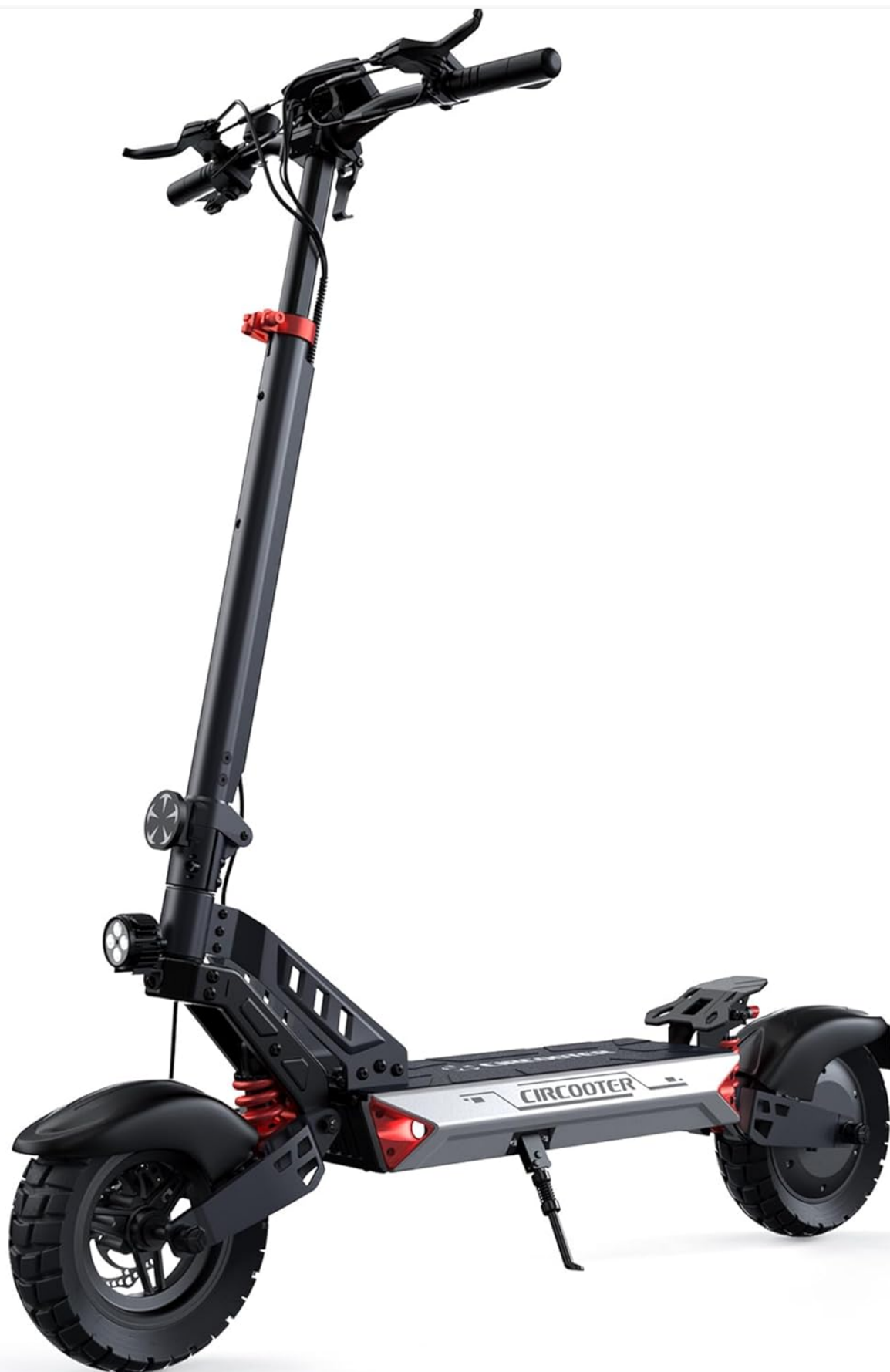
Image 1.1: The Circooter Landturbo Electric Scooter. This image displays the scooter in its upright, ready-to-ride position, highlighting its overall design and components.