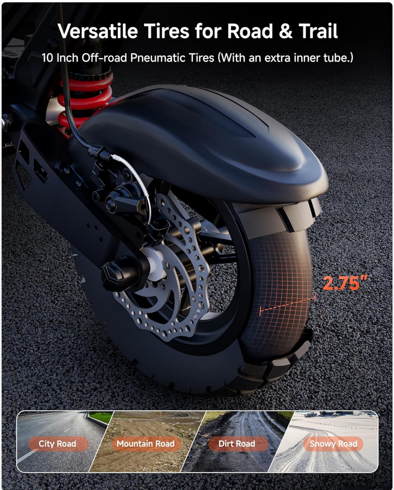
Image 6.1: Close-up view of the Circooter Landturbo's 10-inch off-road pneumatic tires. The image highlights the tire tread and disc brake system, indicating suitability for various terrains including city, mountain, dirt, and snowy roads.

10 Inch Off-road Pneumatic Tires (With an extra inner tube.)