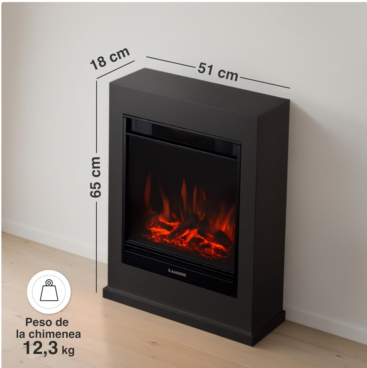
Image: This image provides the precise dimensions of the KAMINIO Kalle Electric Fireplace: 18 cm deep, 51 cm wide, and 65 cm high. The total weight of the fireplace is 12.3 kg.