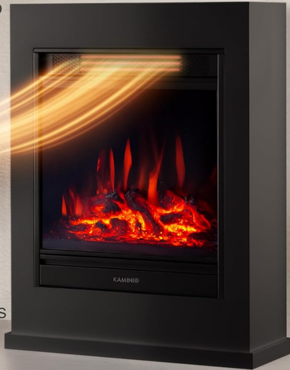
Image: This image illustrates the efficient heating performance of the KAMINIO Kalle Electric Fireplace. It emphasizes rapid heating, low noise operation due to a silent fan, suitability for rooms up to 30 m 2 , and energy savings from modern components.

Ahorro de energía gracias a componentes modernos