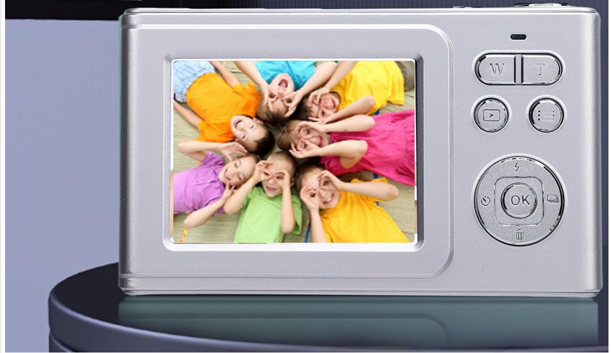
Rear view of the camera, displaying the 2.4-inch screen and control buttons for navigation and operation.