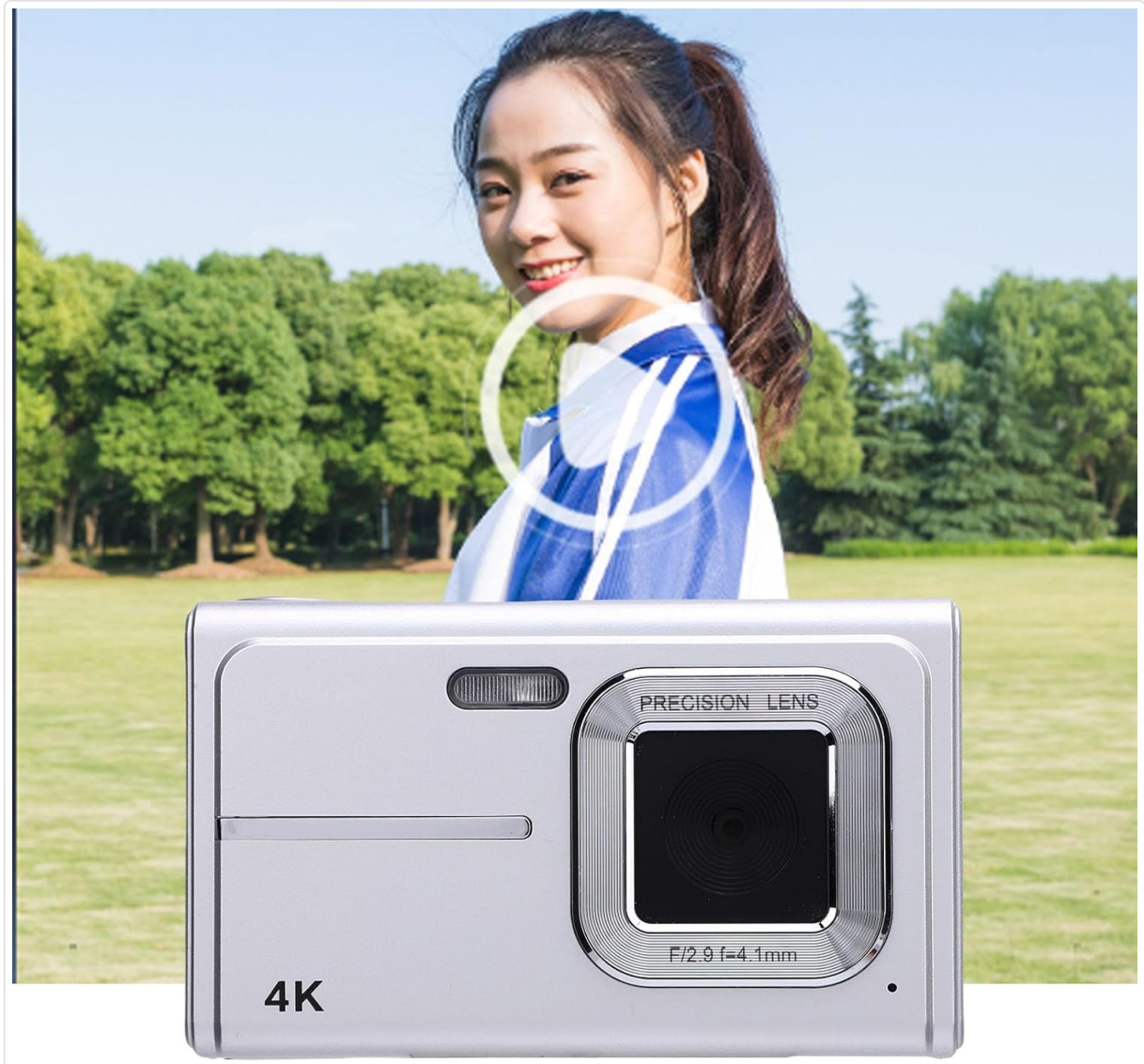
Front view of the camera, showing the lens, flash, and '4K' branding.

The ASHATA digital camera is a compact and user-friendly device designed for capturing high-resolution photos and 1080P videos. Familiarize yourself with its key components: