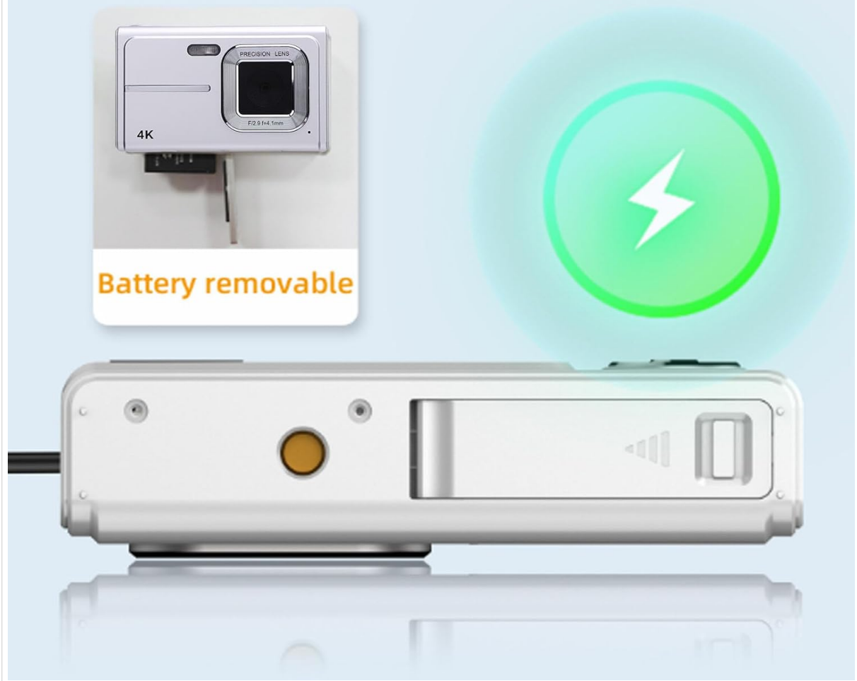
Illustration showing the camera being charged via a USB-C cable. The battery is removable for convenience.

With a USB charging cable, you can take photos while charging