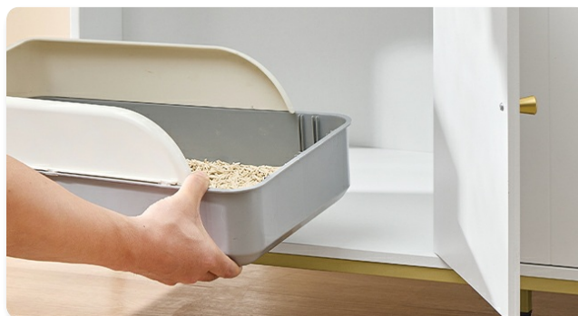
Image: Demonstrates the ease of inserting a litter box into the enclosure's compartment.