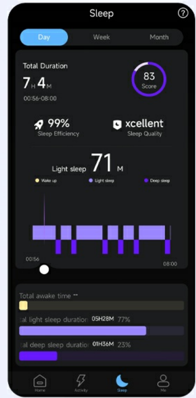
Figure 6.3: The app provides a comprehensive analysis of your sleep stages and quality.