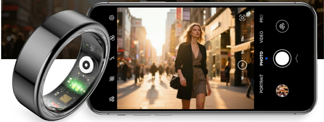
Figure 6.5: The smart ring allows for convenient remote control of your smartphone's camera.

Paired smartphones can be controlled with simple gestures. Just shake the finger up and down with the smart ring to control the photo.