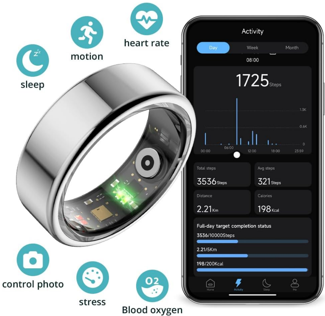
Figure 6.4: The app displays your daily activity metrics, including steps, distance, and calories.