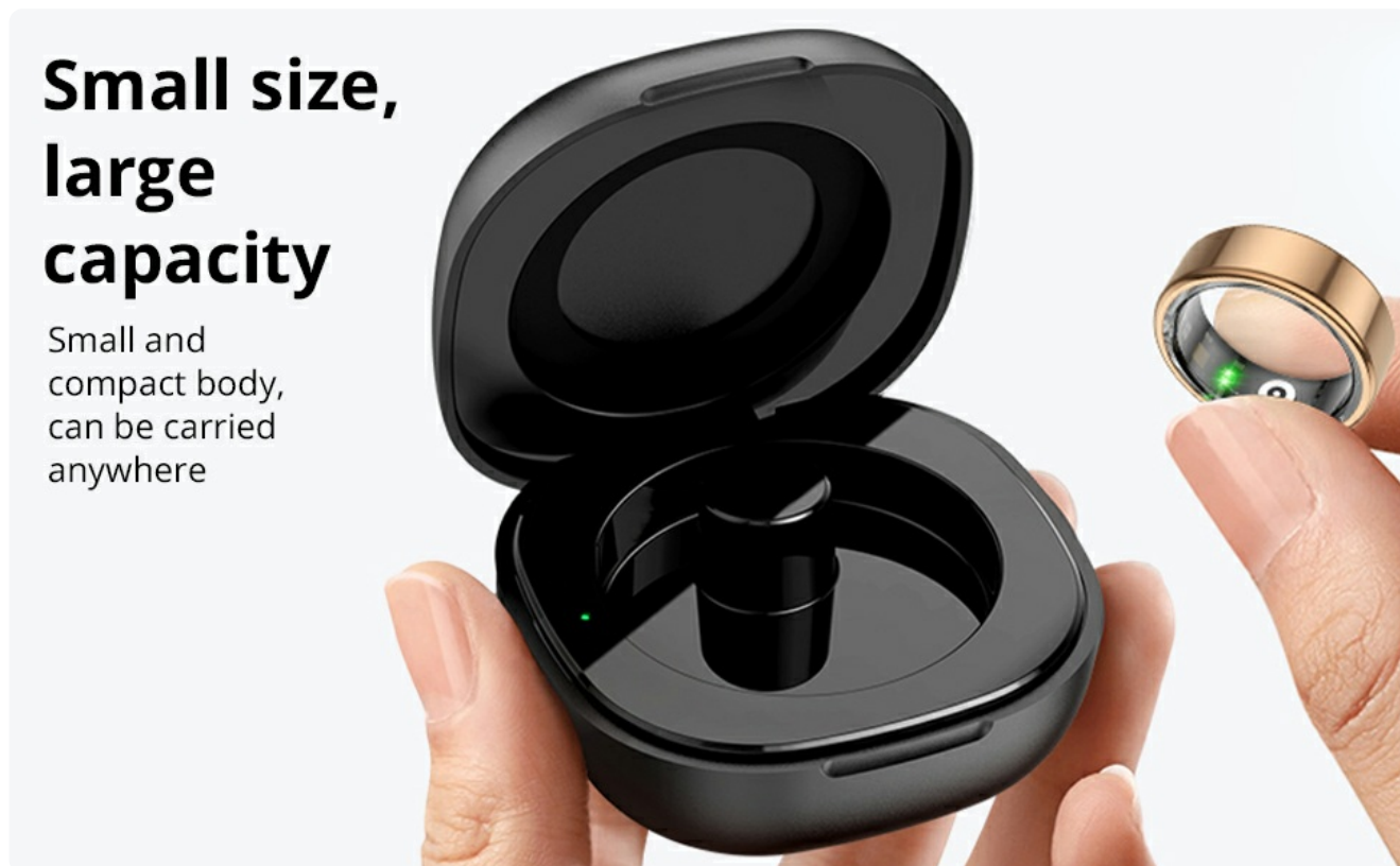
Figure 5.1: The COLMI R02 Smart Ring charging in its portable case. The case provides convenient charging on the go.