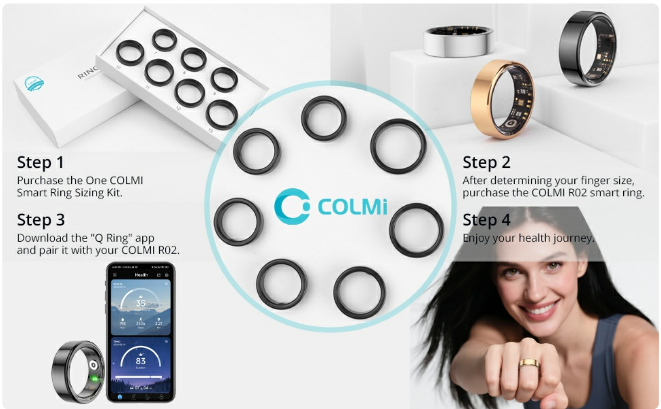
Figure 4.2: The COLMI Smart Ring Sizing Kit, recommended for precise size determination.