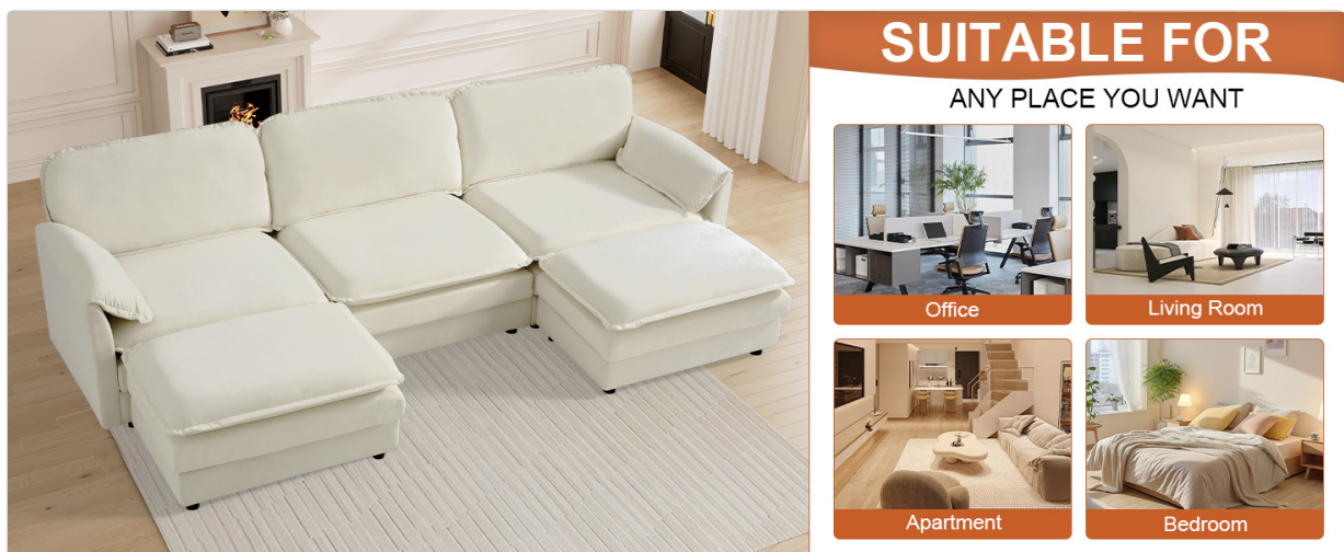
Image: Various usage scenarios demonstrating the versatility and comfort of the sectional for different activities.

The included ottoman can be used to extend any seat into a chaise lounge, as a standalone footrest, or as additional seating.