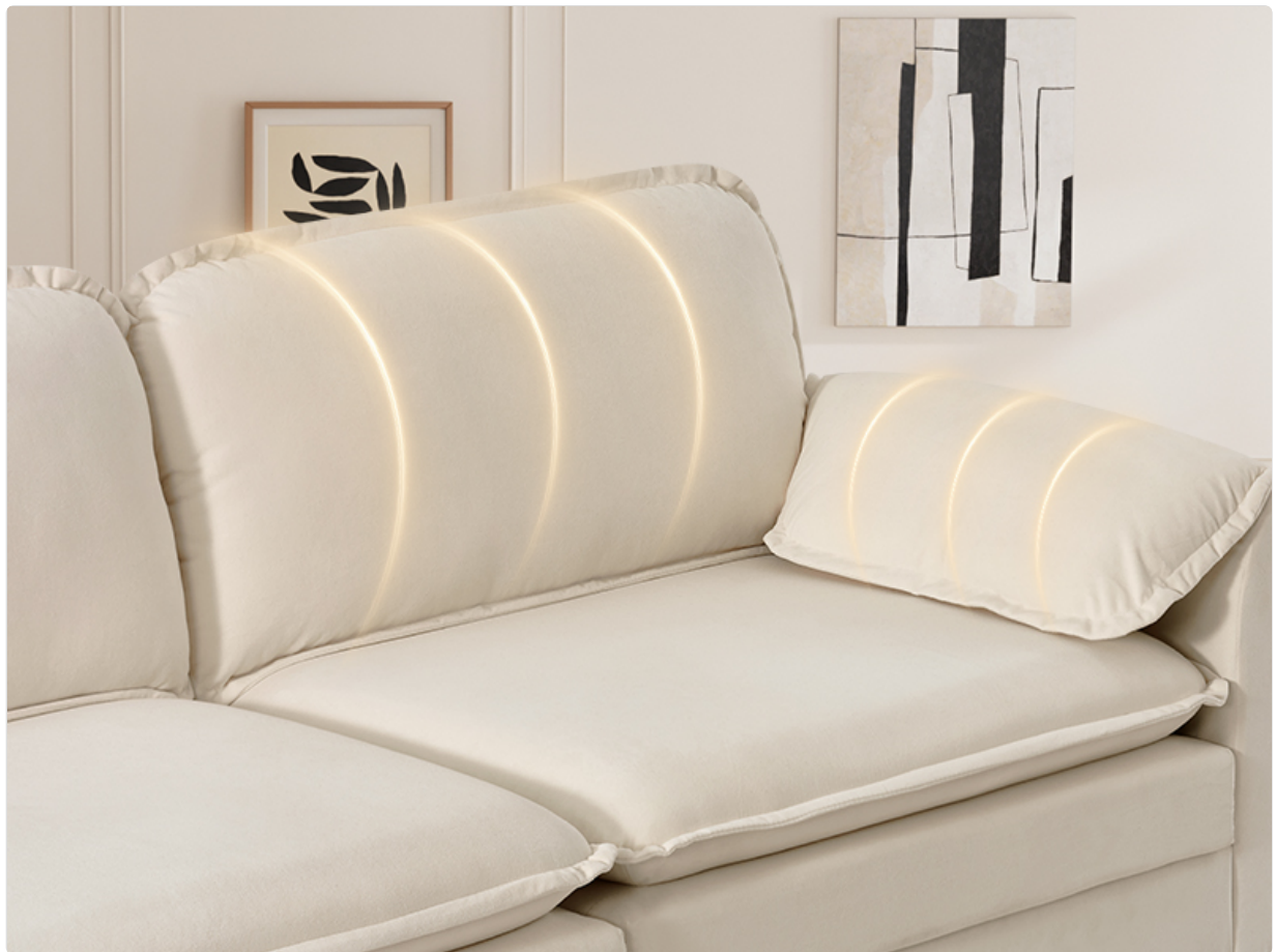
Image: A detailed view of the pillow-style armrest, emphasizing its soft and supportive design.