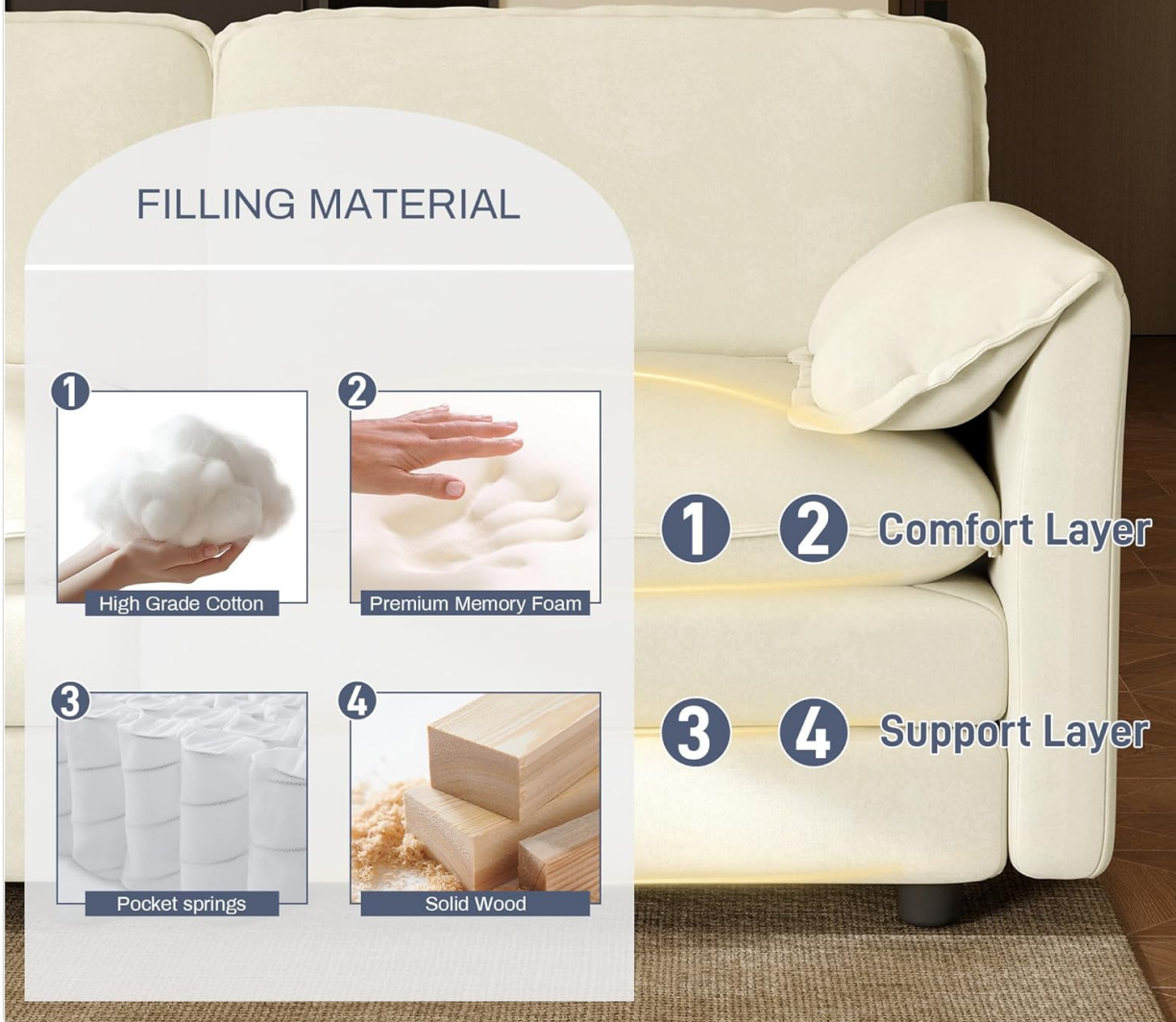
Image: Cross-section view of the double-layer cushion, highlighting the comfort layer (high-grade cotton, memory foam) and support layer (pocket springs, solid wood).