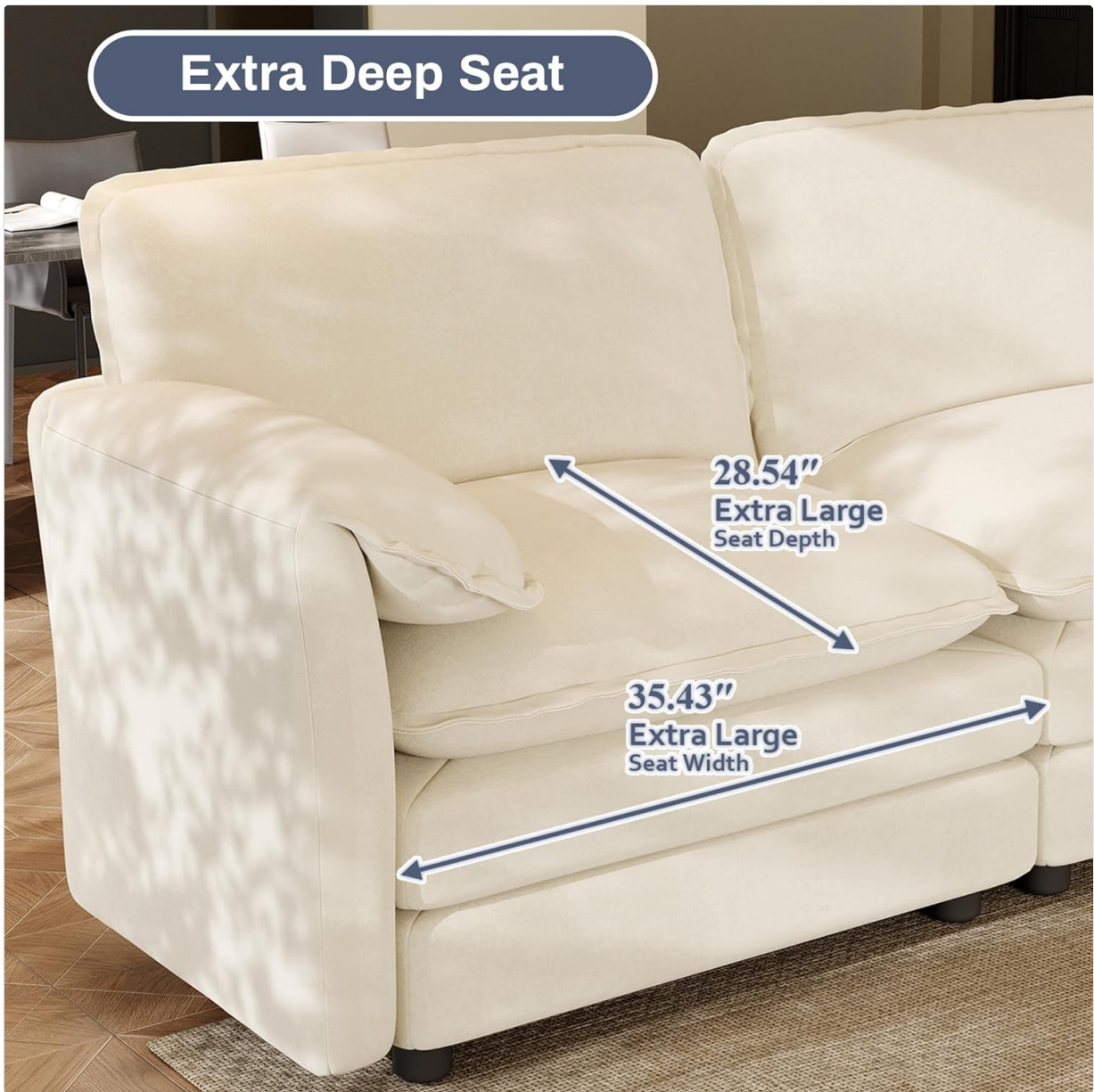
Image: A close-up of the sectional seat, indicating its extra-deep dimensions for spacious comfort.