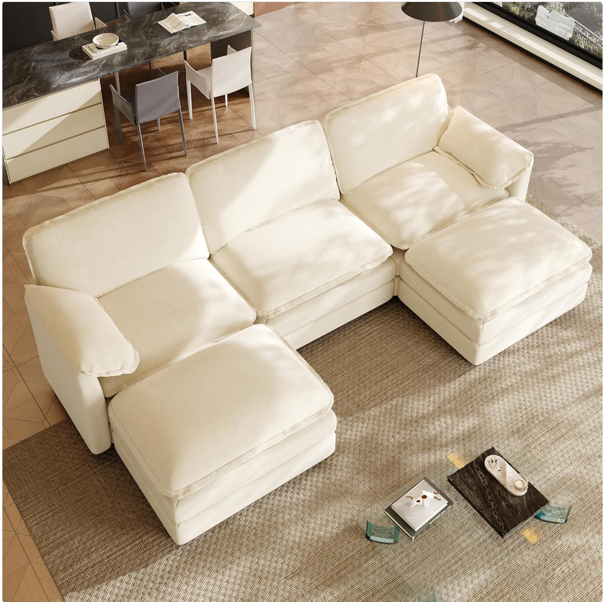
Image: The ONEMMLION 114" U Shaped Cloud Couch Sectional, showcasing its modular design and beige chenille fabric.