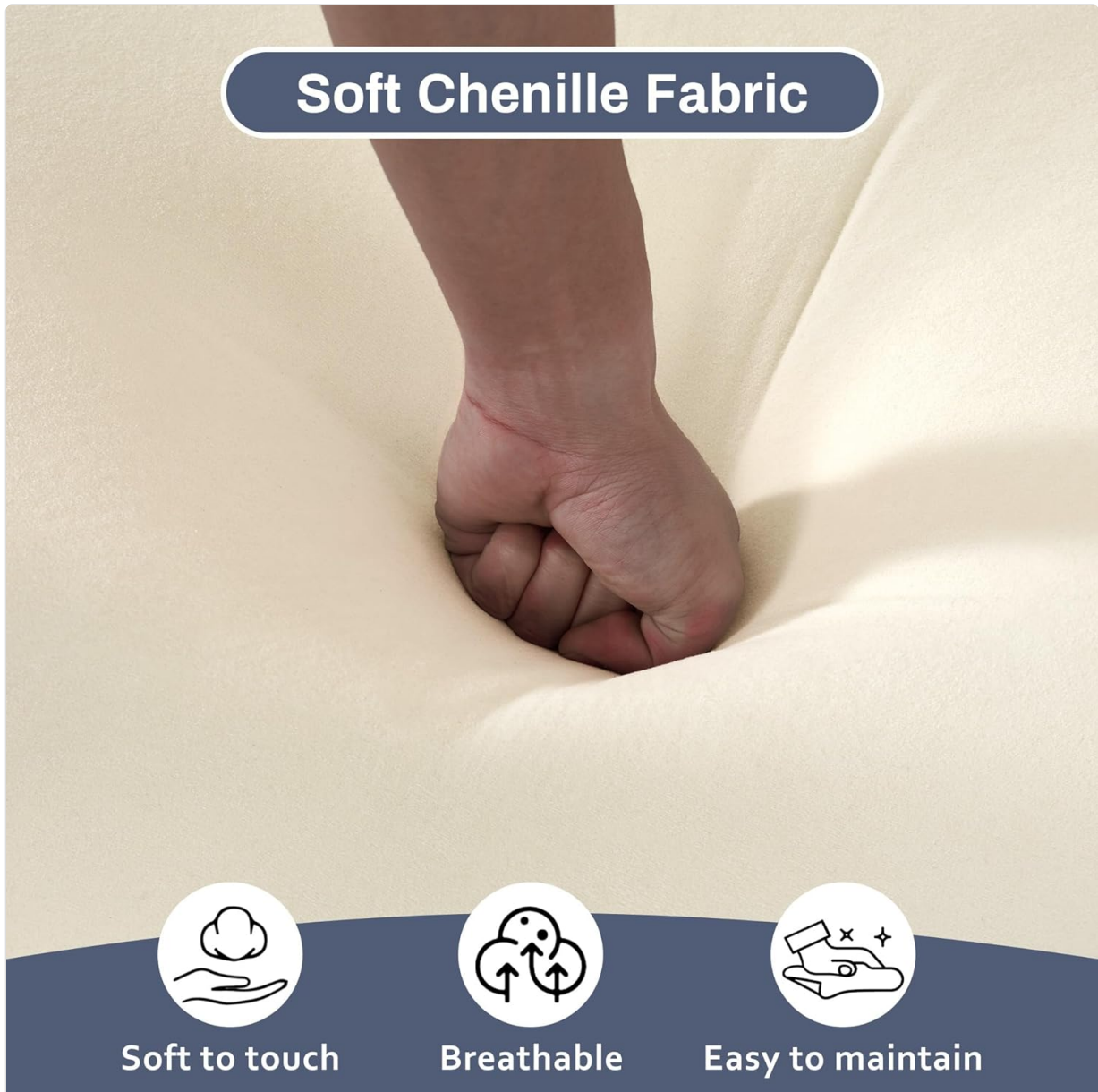
Image: A hand pressing into the soft chenille fabric, illustrating its texture and highlighting its soft, breathable, and easy-to-maintain qualities.