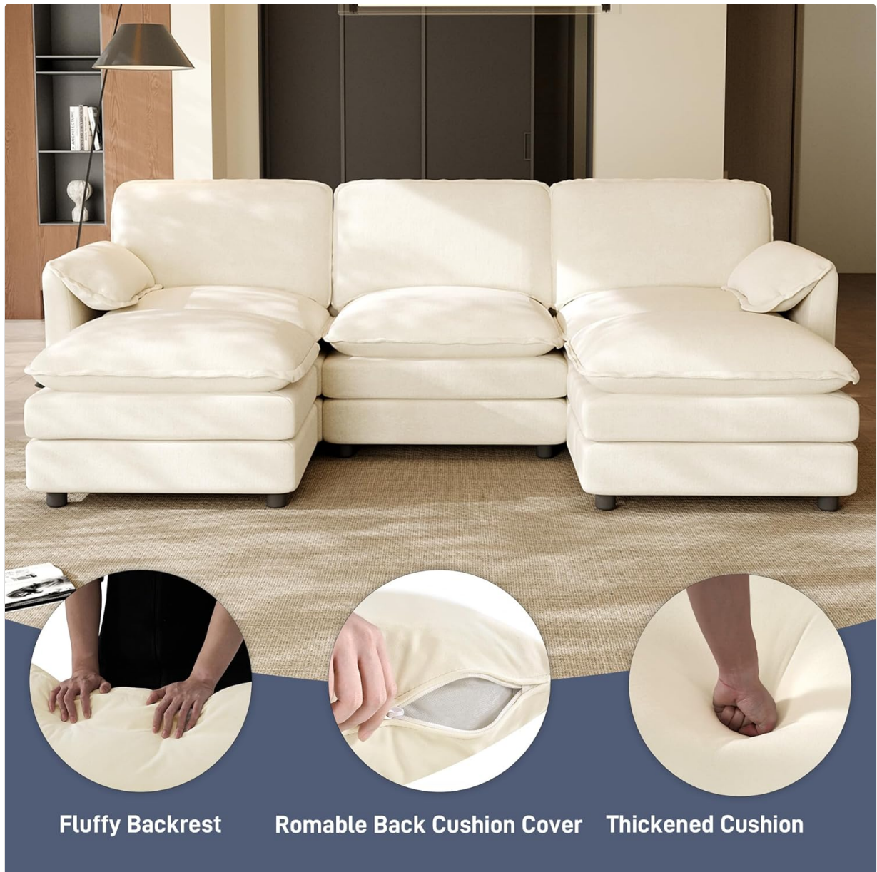
Image: Close-up views demonstrating the fluffy backrest, the zipper for the removable back cushion cover, and the density of the thickened cushion.