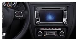
For VW SAGITAR