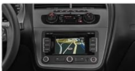
For Seat Altea