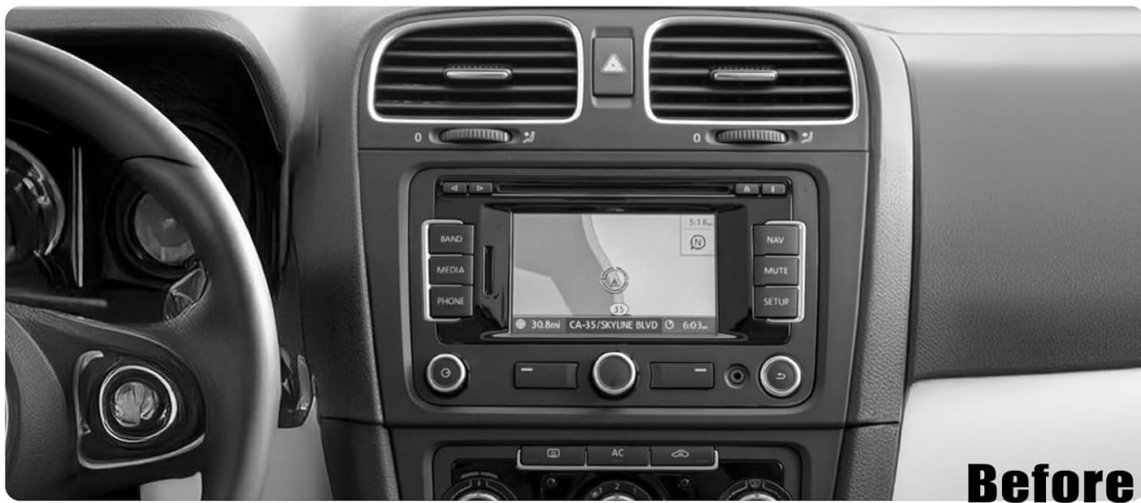
Image 4.1: Comparison of the dashboard before and after installing the AMprime car stereo.