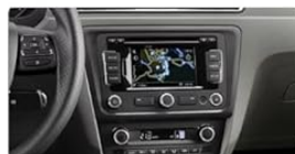
For Seat Toledo