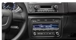
For Skoda Roomster