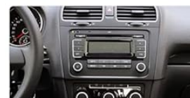
For VW GOLF