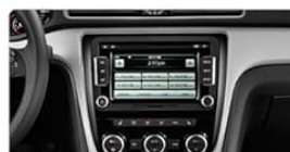
For VW PASSAT