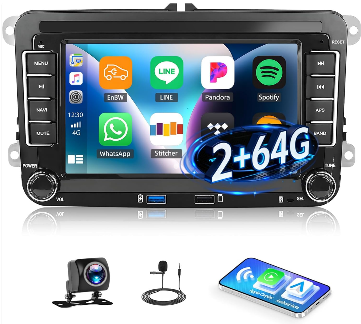
Image 1.1: AMprime Android 15 Car Radio Stereo with included accessories.