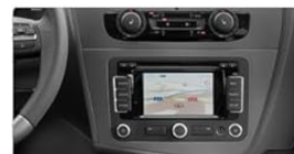
For Seat Leon