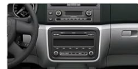
For Skoda Fabia