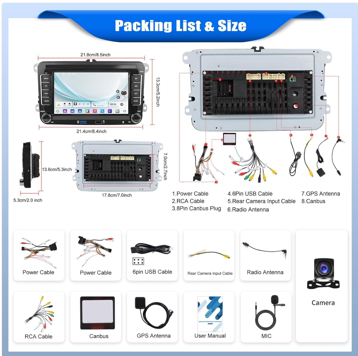
Image 3.1: Visual representation of the package contents and unit dimensions.