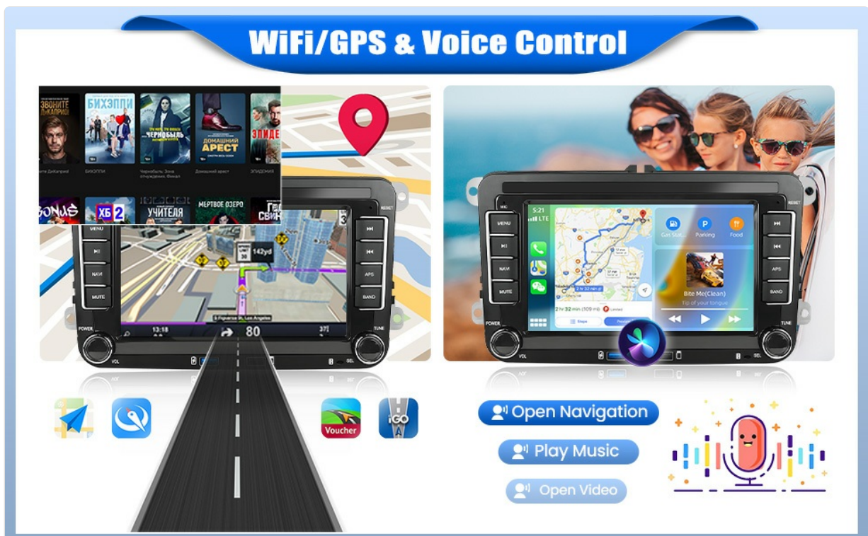
Image 5.3: WiFi/Hotspot connectivity and GPS navigation with voice control.