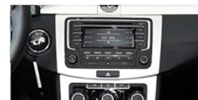
For VW MAGOTAN