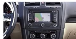
For VW JATTA