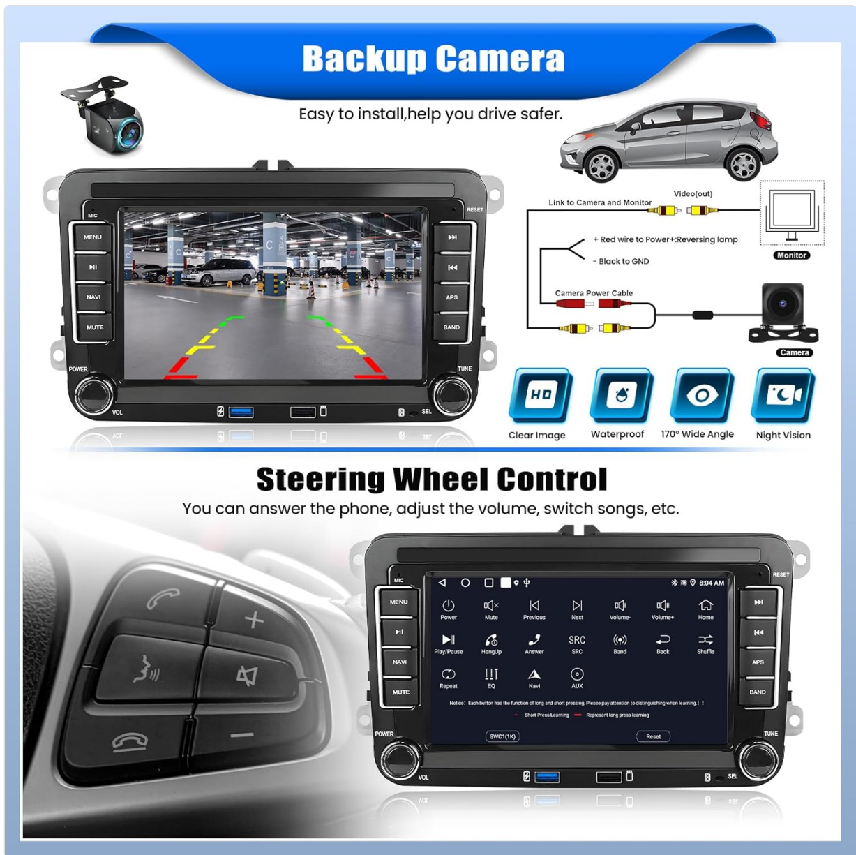
Image 5.4: Backup camera display and steering wheel control interface.