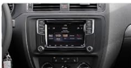
For VW TOURAN