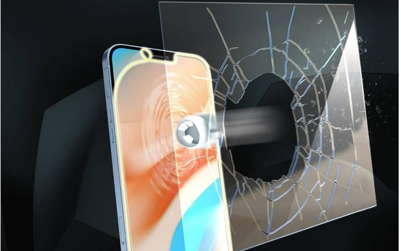
Image: Visual representation of shatterproof protection, showing a screen protector preventing a screen from cracking under impact.