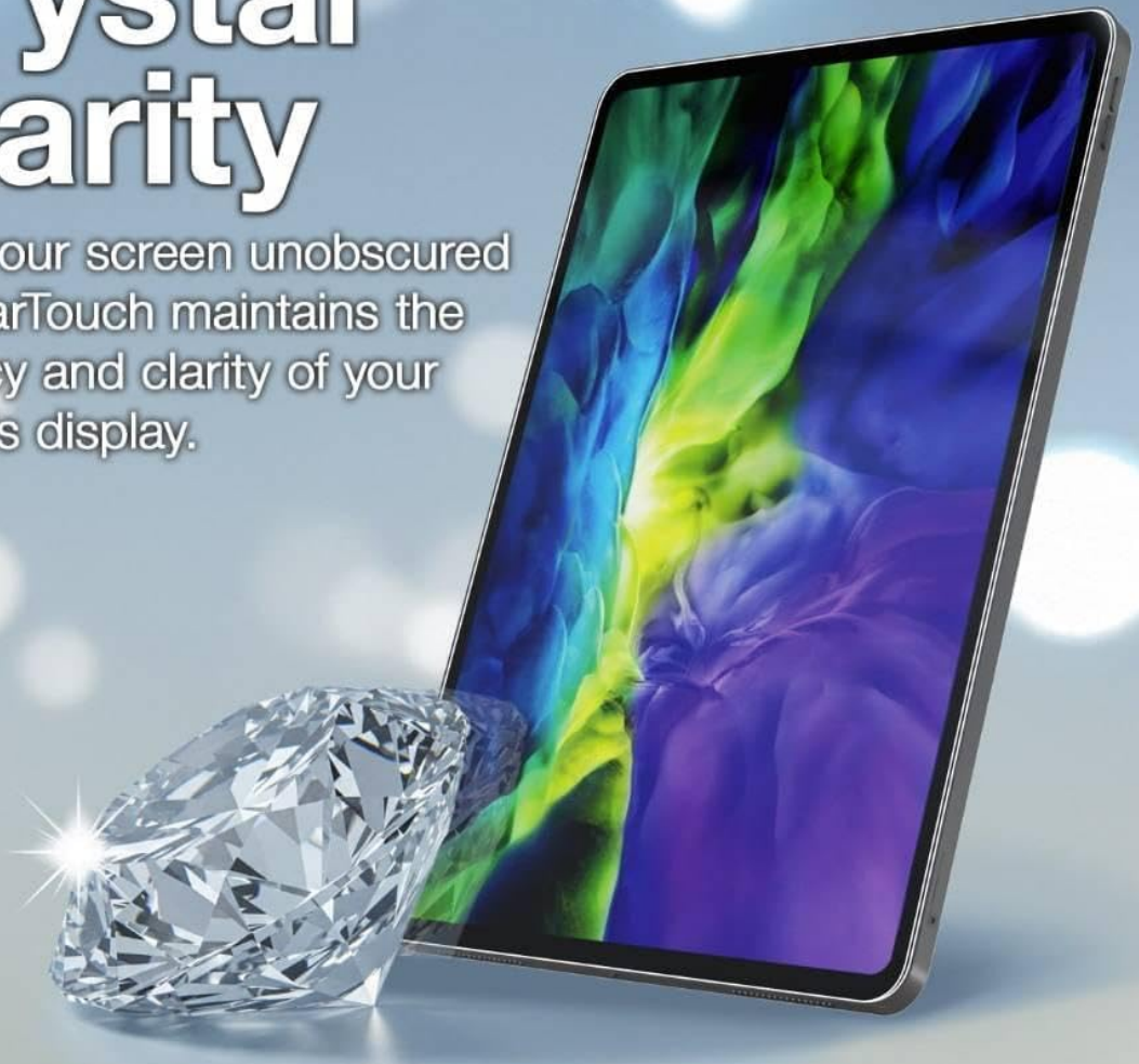
Image: A diamond next to a tablet screen, symbolizing the crystal clarity and brilliance maintained by the screen protector.

Keep your screen unobscured as ClearTouch maintains the vibrancy and clarity of your device's display.