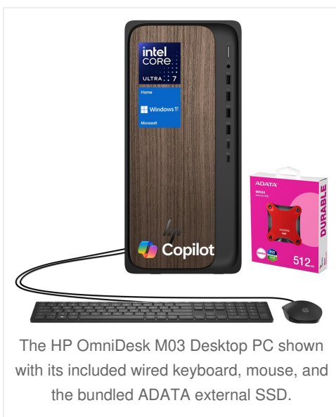
The HP OmniDesk M03 Desktop PC shown with its included wired keyboard, mouse, and the bundled Adata external SSD.