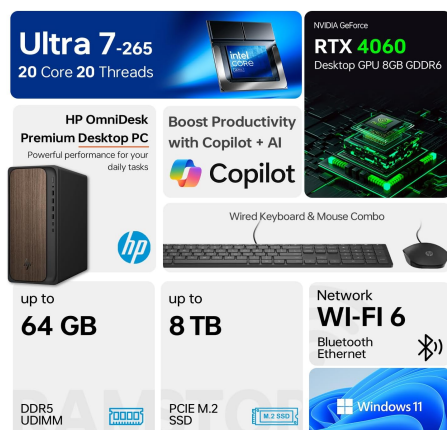
An overview highlighting the desktop's core specifications: Intel Core Ultra 7-265