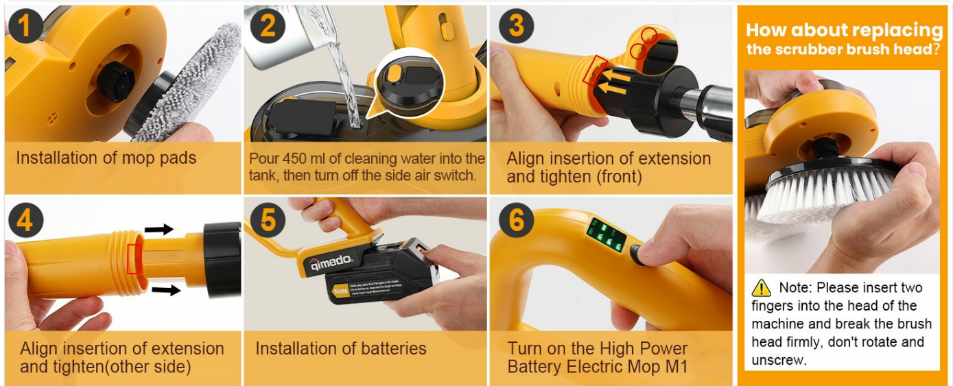
Image: Step-by-step visual guide for assembling the qimedo M1 Pro electric mop, showing pad installation, handle assembly, water filling, and battery insertion.