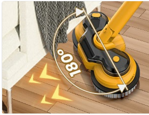
Image: The flexible mop head swiveling to clean under furniture, demonstrating its maneuverability.

Video: A demonstration of how to use the qimedo M1 electric mop, including assembly and operation.