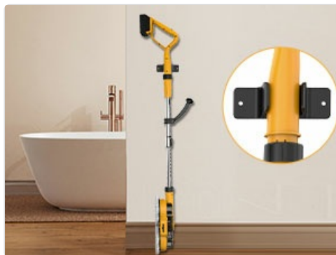
Image: The electric mop neatly stored on a wall-mounted hook, demonstrating space-saving storage.