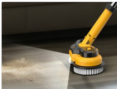
Image: The mop head with its LED lights activated, shining on the floor to reveal dirt.