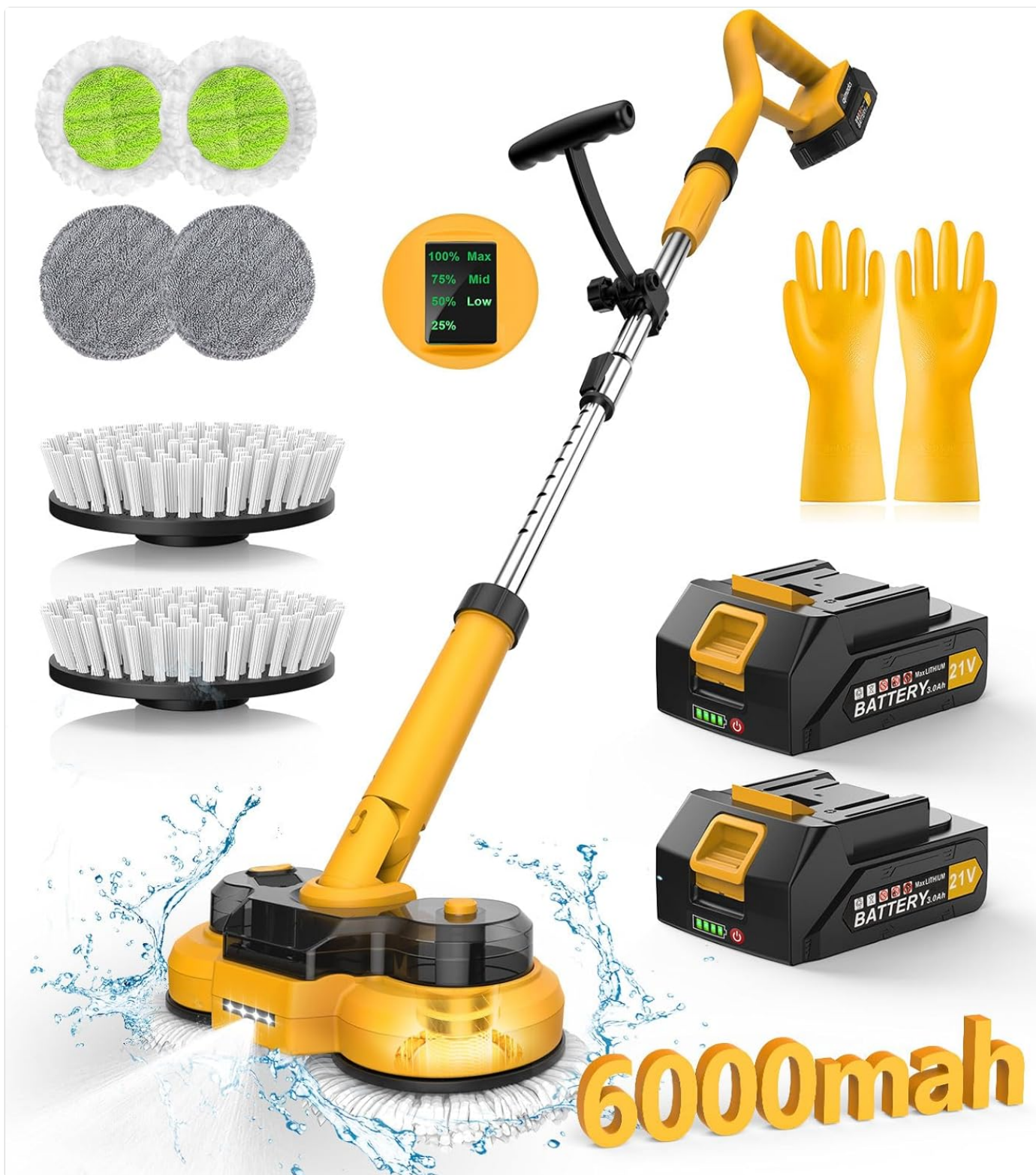
Image: All accessories included with the qimedo M1 Pro electric mop, laid out on a surface.