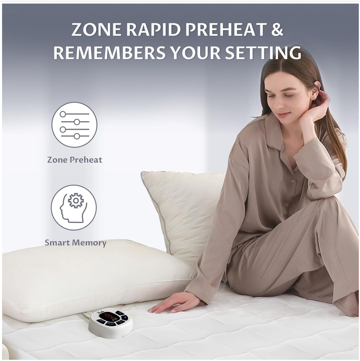
Image: This image highlights the controller's features, including rapid preheat and smart memory function that retains your preferred settings.