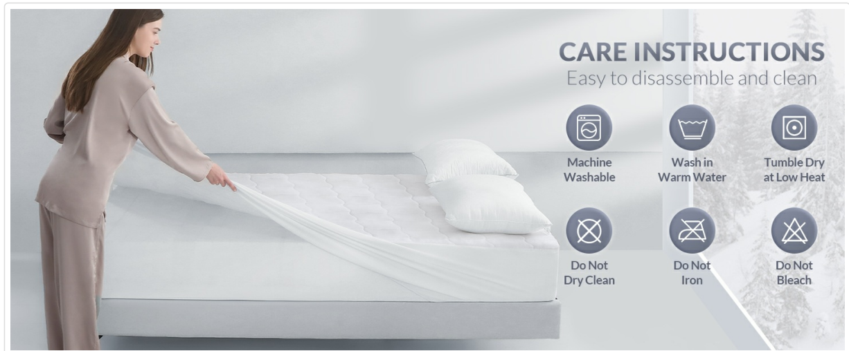
Image: This image provides clear care instructions, indicating the mattress pad is machine washable and outlining specific washing and drying guidelines.