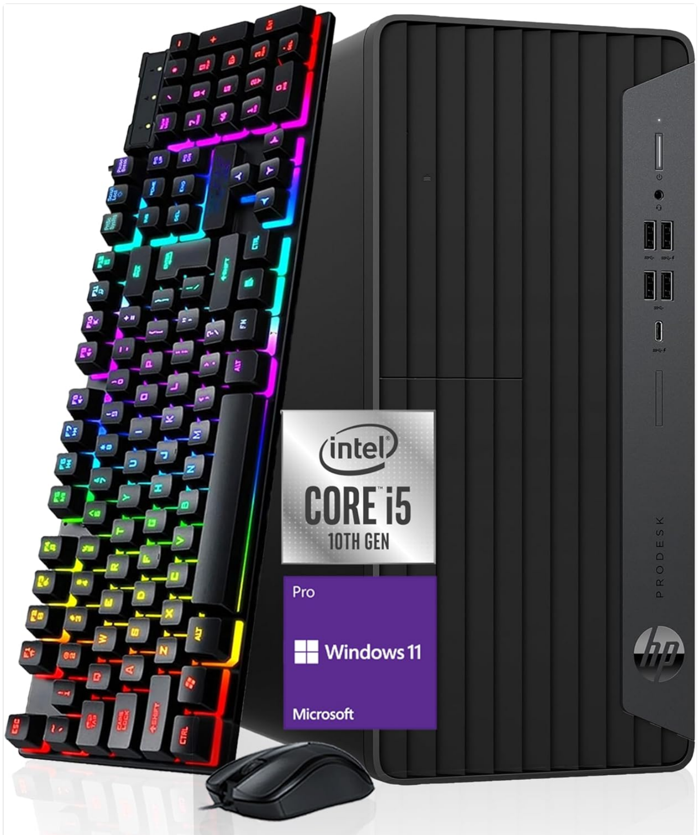
Image 1.1: HP ProDesk 600 G6 Microtower PC with included keyboard and mouse. This image displays the compact desktop tower alongside a backlit gaming-style keyboard and a standard mouse, illustrating the complete system setup.