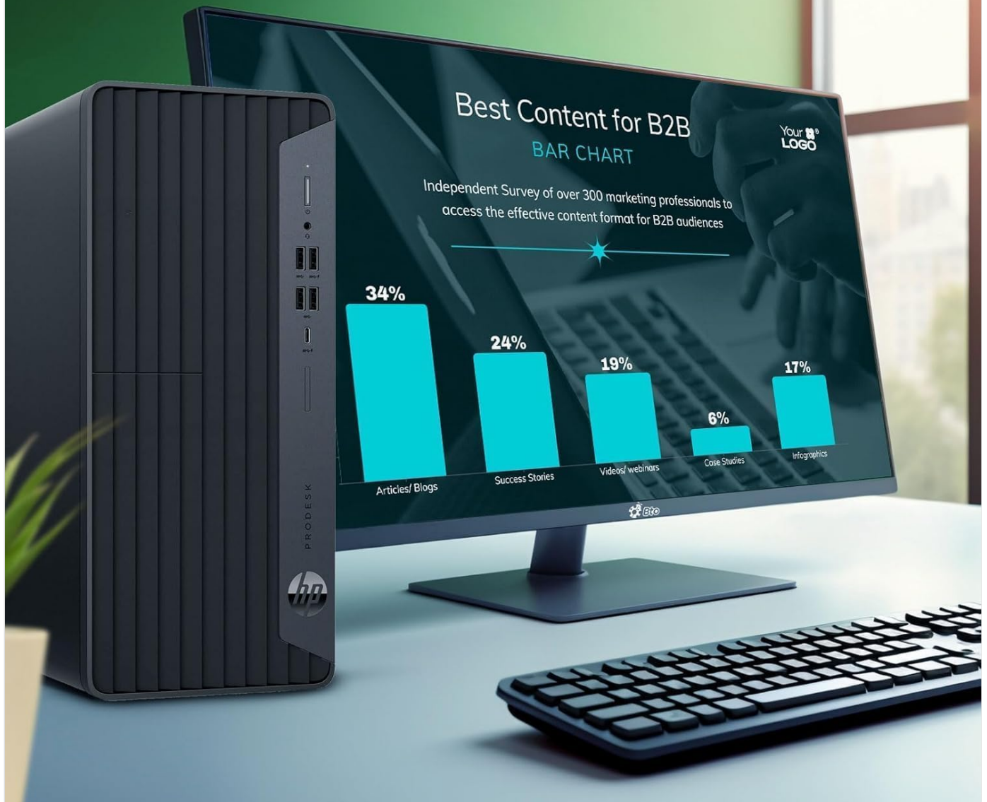
Image 3.1: HP ProDesk 600 G6 Microtower PC connected to a monitor. The monitor displays a graphical user interface with a bar chart, demonstrating the system's capability for business and productivity tasks.