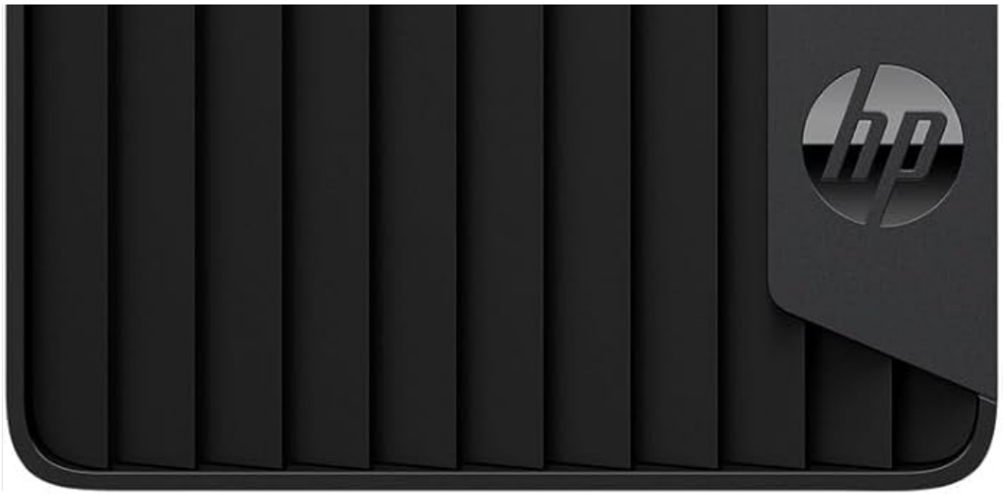
Image 2.3: Front view of the HP ProDesk 600 G6 Microtower PC. This image shows the front panel with the power button, USB ports, and optical drive bay (if present), illustrating the primary user interface.