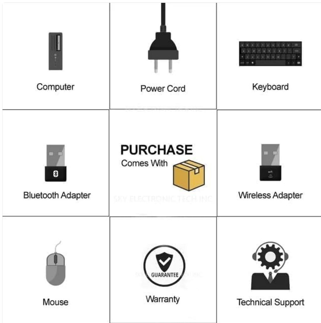
Image 2.1: Visual representation of items included in the box. This diagram shows icons for the computer tower, power cord, keyboard, Bluetooth adapter, wireless adapter, mouse, warranty, and technical support, indicating the standard package contents.