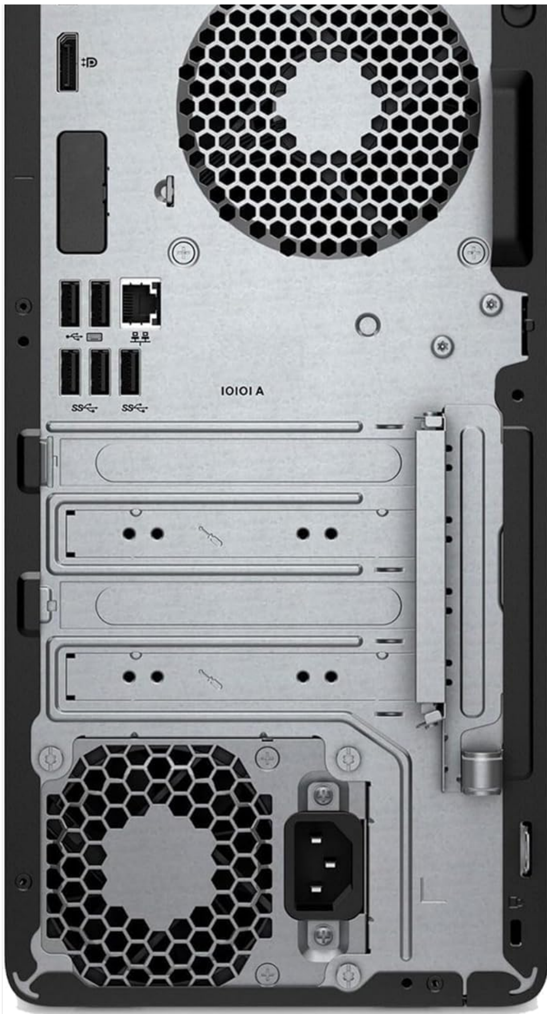
Image 2.2: Rear panel of the HP ProDesk 600 G6 Microtower PC. This view highlights the various connectivity ports, including DisplayPort, USB ports, RJ-45