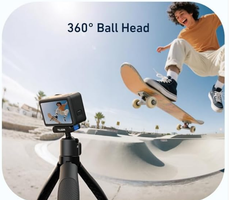
Figure 3: Multi-Directional Gimbal. Adjust the ball head for various shooting angles.