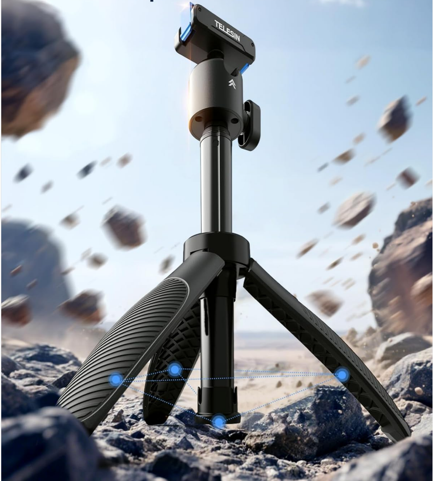
Figure 5: Tripod Stabilization. The integrated tripod provides a stable platform for your camera.