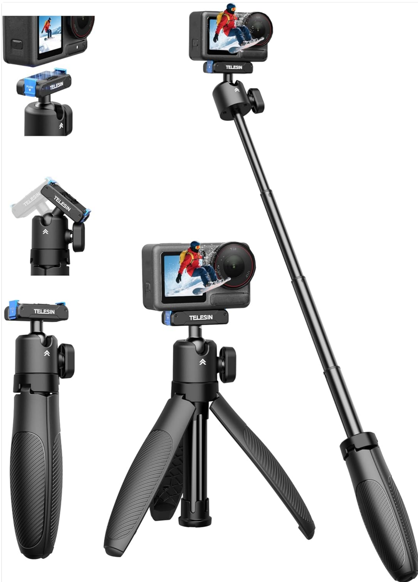
Figure 1: TELESIN 40cm Mini Selfie Stick Tripod with DJI Osmo Action camera attached, demonstrating its dual functionality as a selfie stick and a tripod.