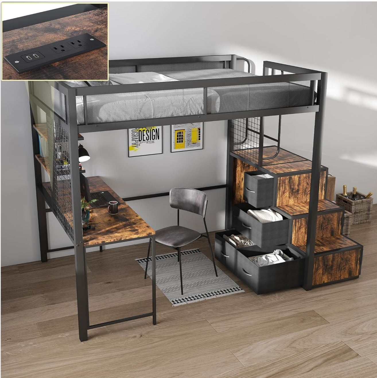
Overall view of the Polibi Full Size Metal Loft Bed, showcasing its integrated desk, staircase with storage, and upper sleeping platform.