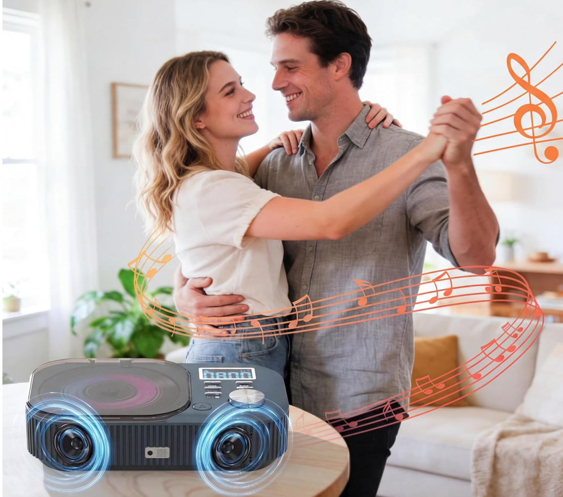
Image: Play modes and compatible formats.

Dual 3W speakers deliver crystal-clear stereo sound with punchy bass for any vibe.