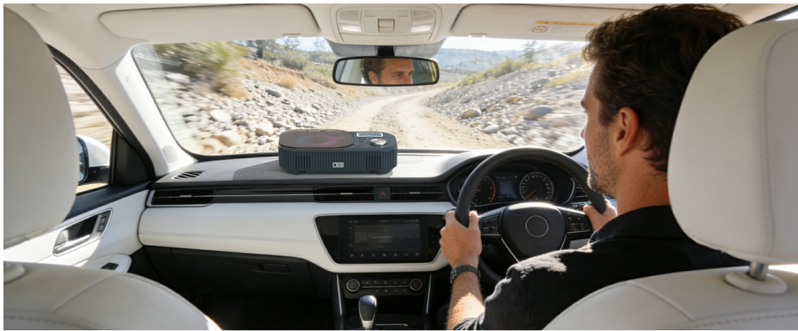
Image: Battery and charging information.

A full charge provides up to 12 hours of continuous playback.