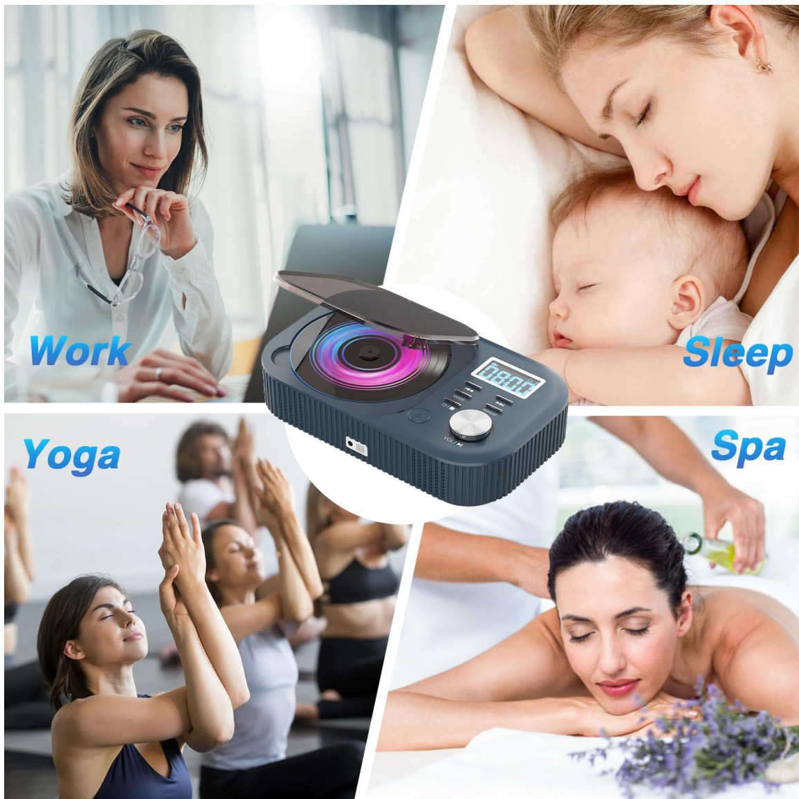
Image: White noise options for relaxation.

The CD319 includes 7 built-in white noise sounds to aid relaxation, sleep, or focus.