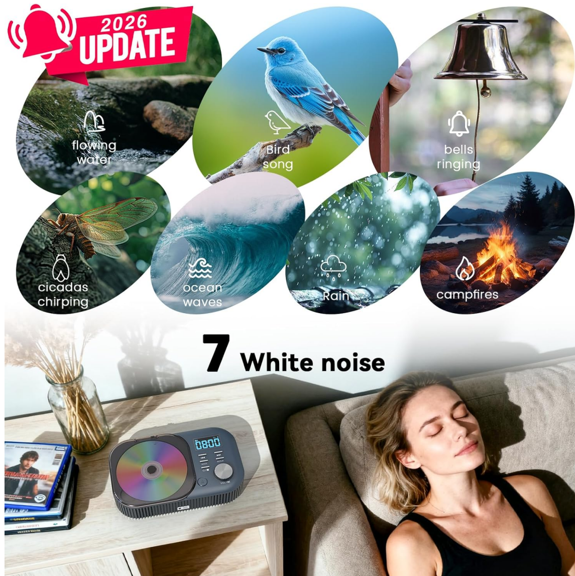
Image: Top view of the CD player with main controls.