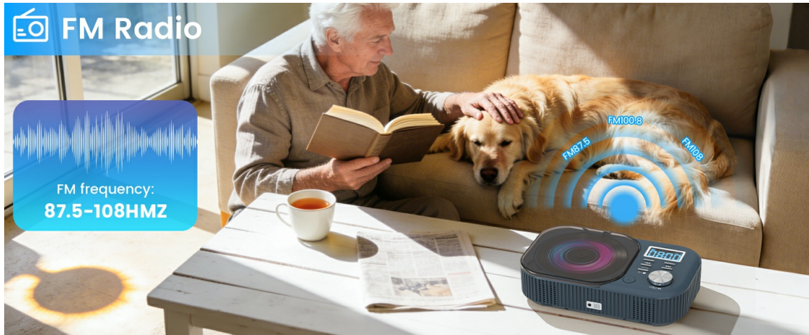
Image: FM Radio function with frequency range.