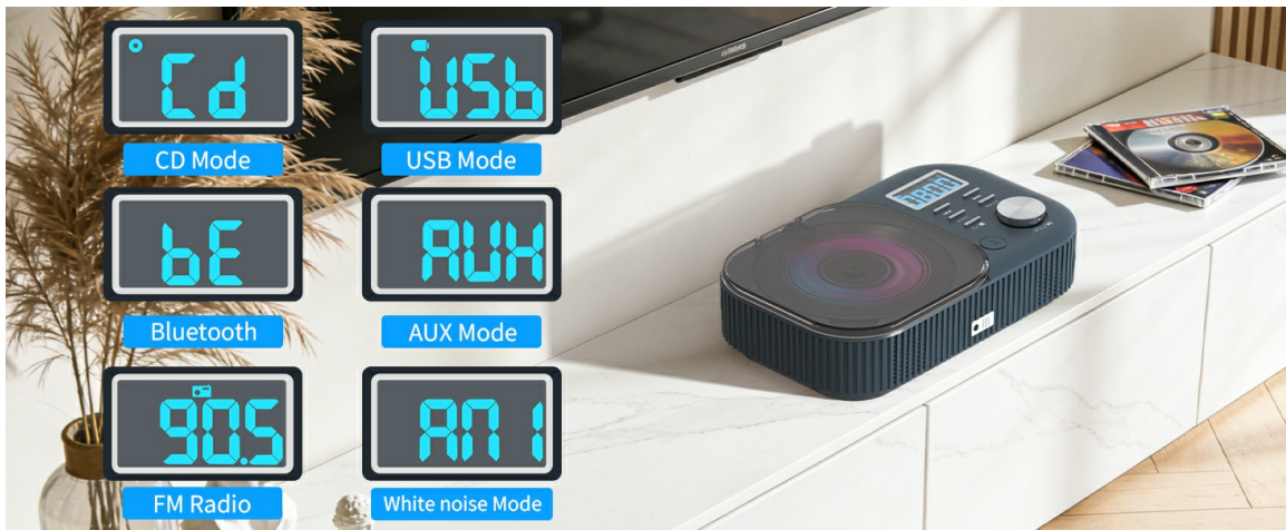
Image: Display showing different operating modes.

The MONODEAL CD319 supports multiple playback modes. Press the 'MODE' button on the device or remote to cycle through them.