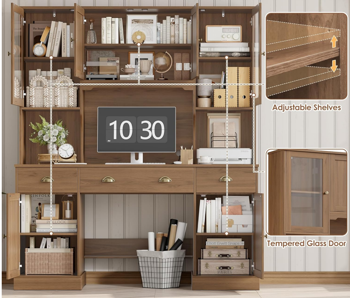
Image: A view of the desk's wide desktop surface, measuring 63 inches, with three smooth-gliding storage drawers beneath it, shown open to display their capacity.