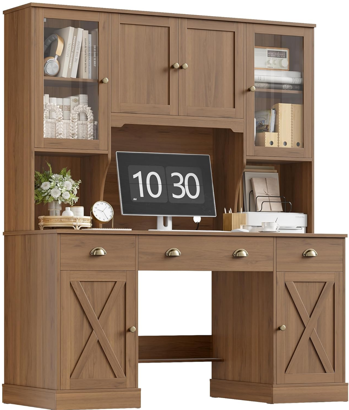
Image: The Keyluv Executive Desk with Hutch and Drawers, featuring a rustic brown finish, multiple storage compartments, and a spacious desktop.