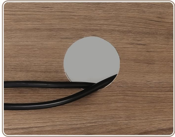
Cord Management Hole