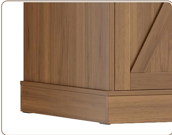
Robust Wood Pedestal