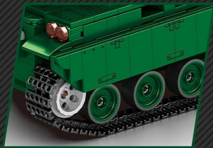
⤴ SIMULATED TRACKS ⤵