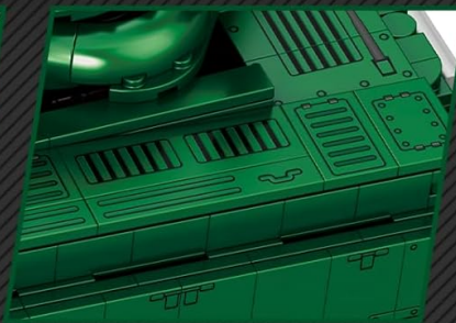
⤴ CLEAR STICKER PRINTING ⤵