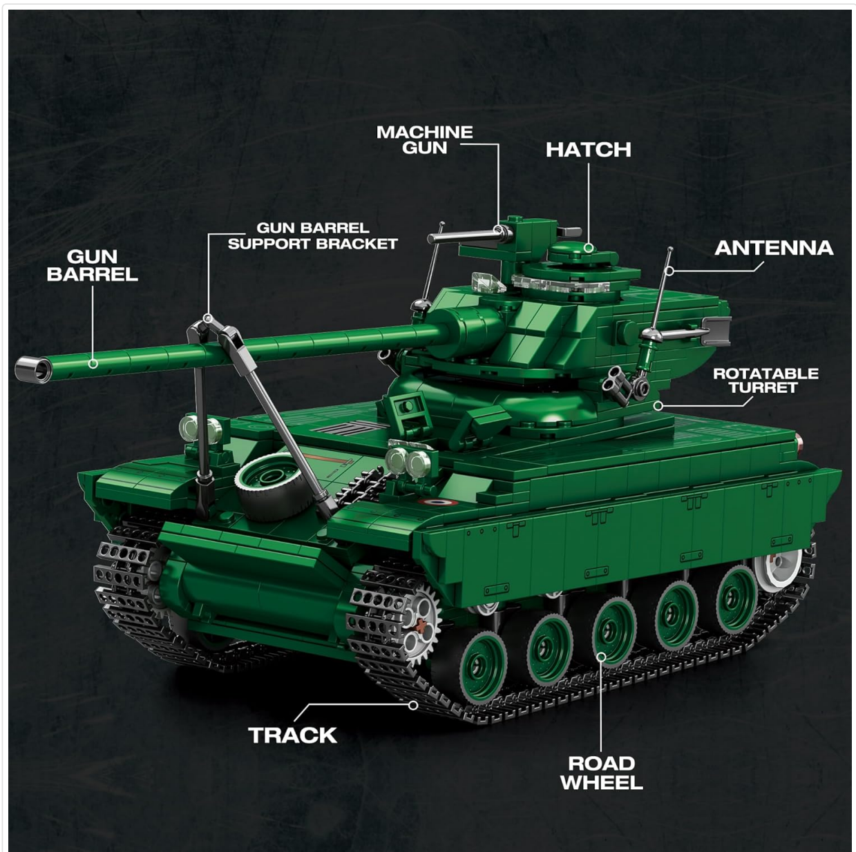
Image 4.3: Key components of the tank model, including the gun barrel, machine gun, hatch, antenna, rotatable turret, tracks, road wheels, and gun barrel support bracket.