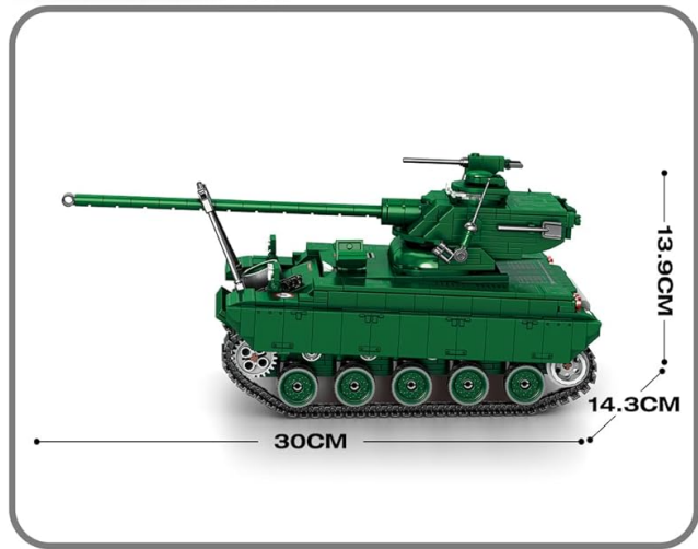
Image 3.2: Product packaging and overall dimensions of the assembled model.