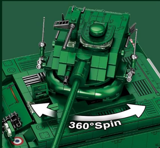
Image 4.2: Close-up views of the quick-release simulated engine interior, gun barrel support bracket, openable turret hatch cover, and 360° rotatable turret.