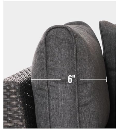
Thickened Back Pad