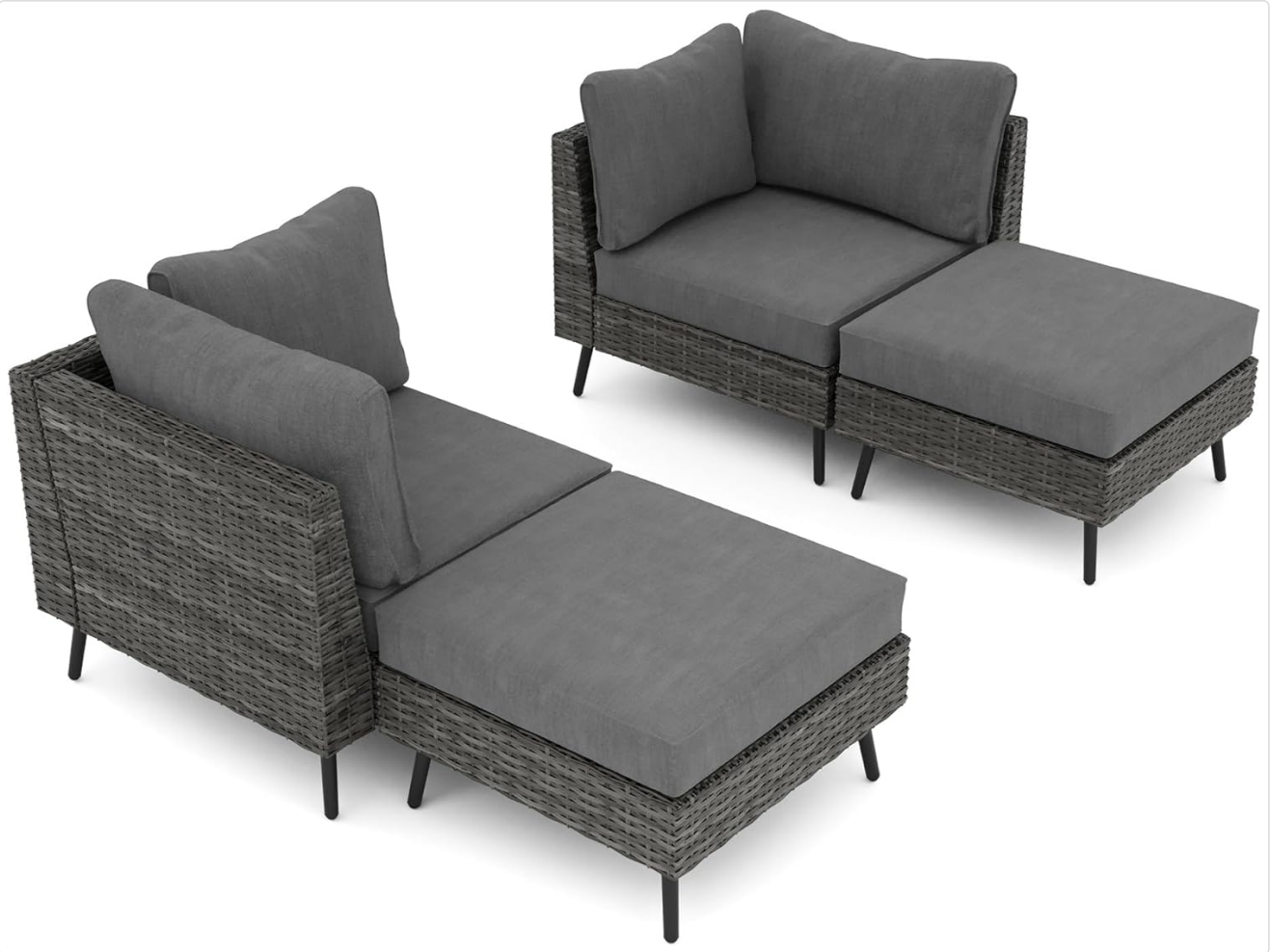
Image: Detailed product dimensions for the corner chairs and ottoman units.