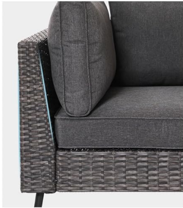
Armrest Angled Design