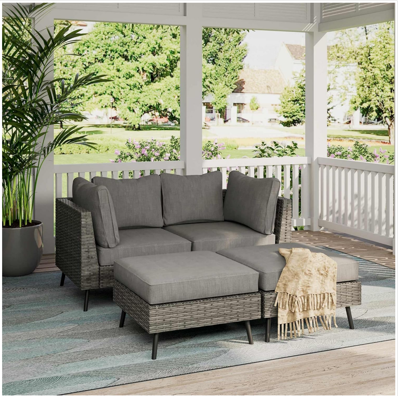
Image: The 4-piece sectional sofa set in a typical outdoor arrangement.