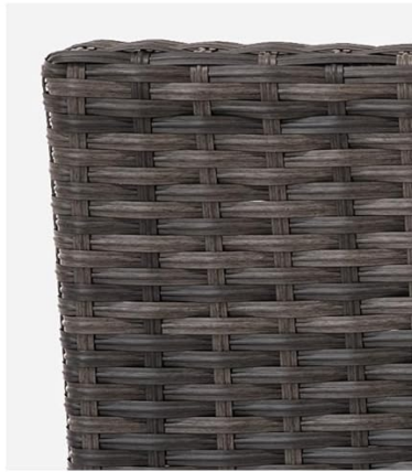
Wider and thicker PE rattan