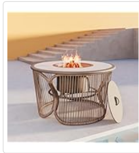
Image: Assembly time estimation for one or two individuals.