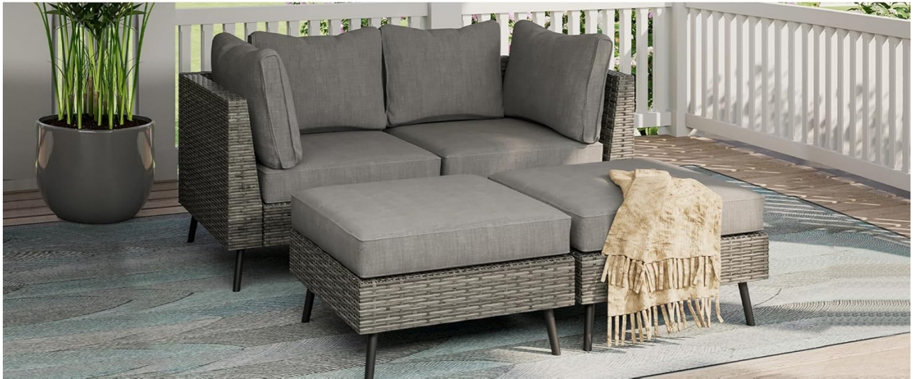
Image: Examples of multiple combination layouts for the sectional sofa.