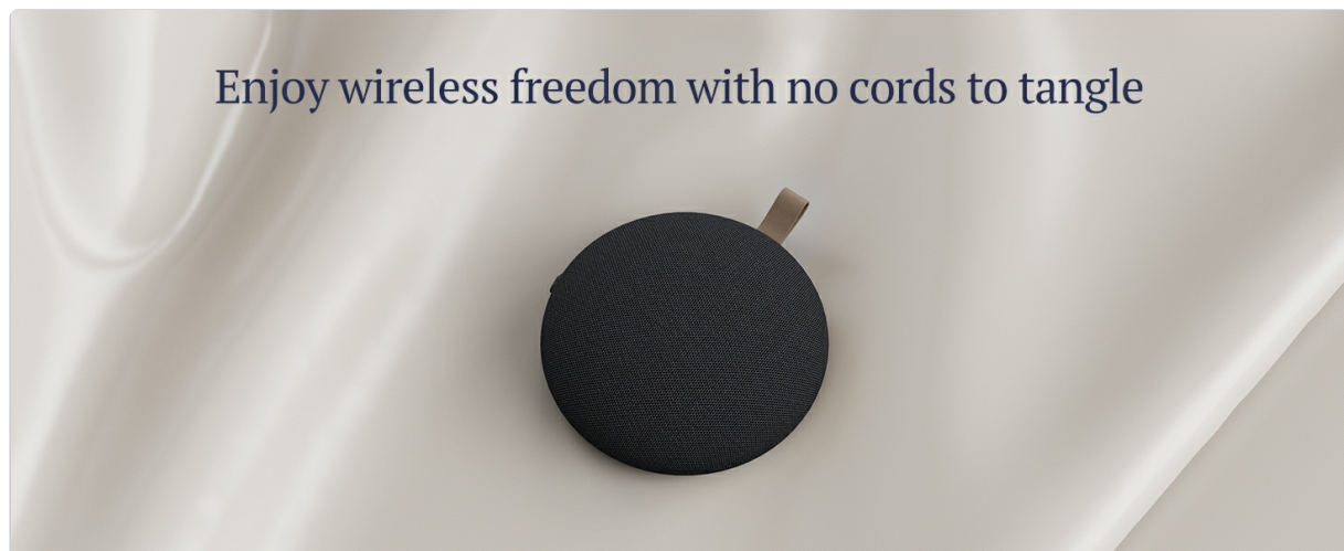
Image: The wireless bed shaker offers three levels of vibration intensity: High, Medium, and Low.

Your browser does not support the video tag.