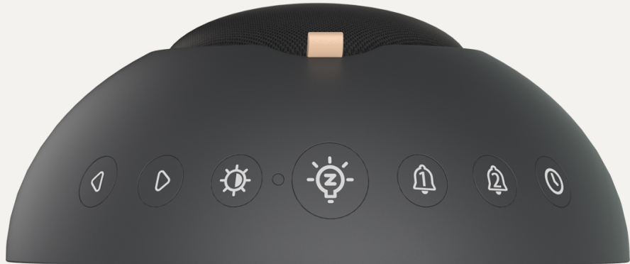
Image: The alarm clock features vibrant mood lighting with 9 colors and 6 brightness levels.