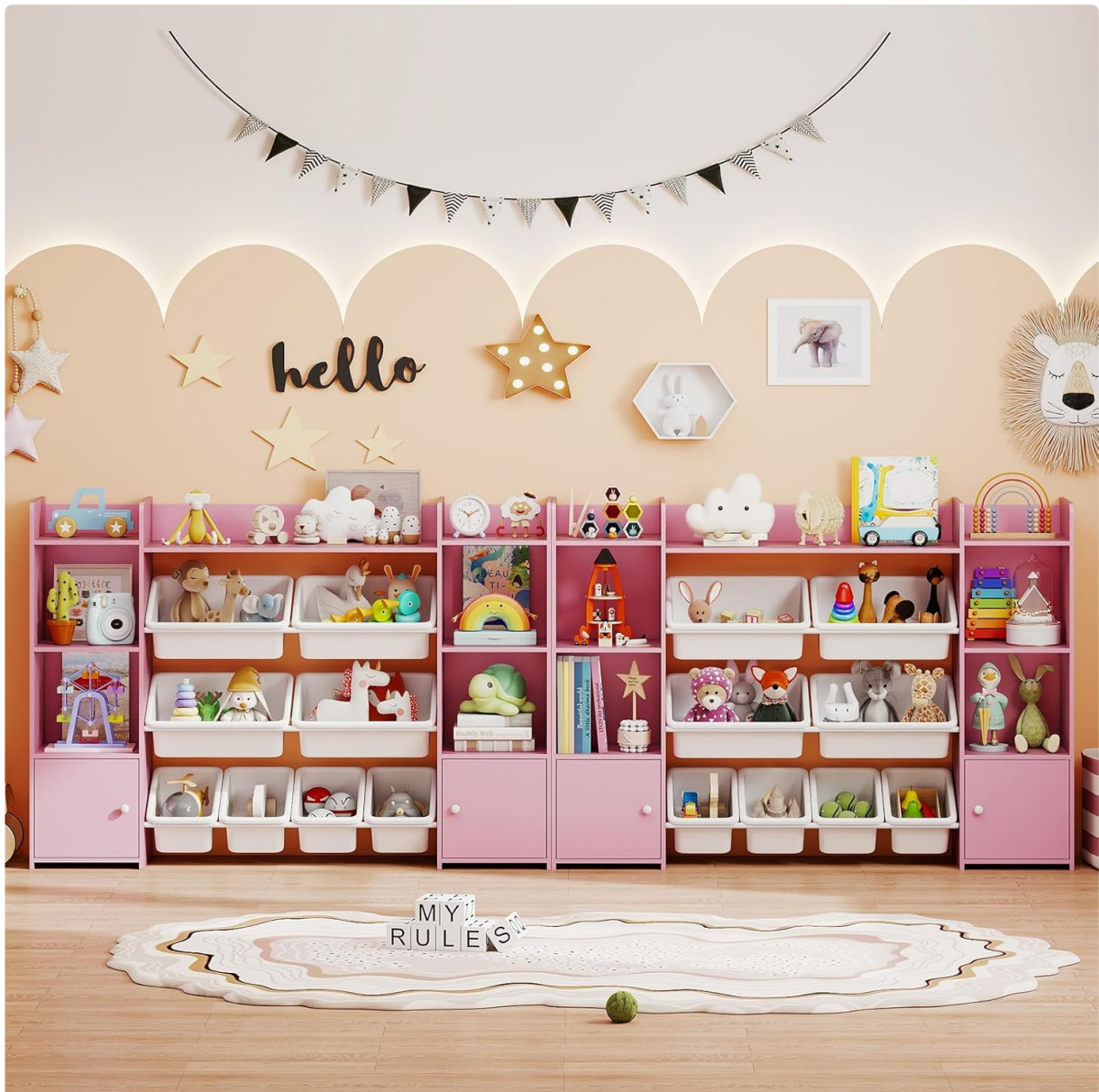
Image: Categorized storage solutions with toys neatly arranged in bins and on shelves.