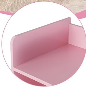
Protective Raised Edges