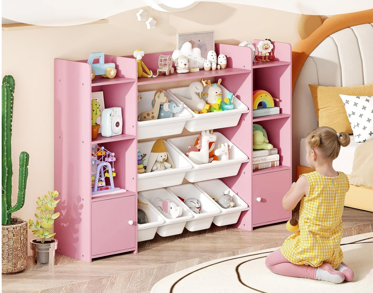
Image: Anti-toppling device for enhanced stability and safety.