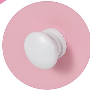
User-friendly Round Knobs