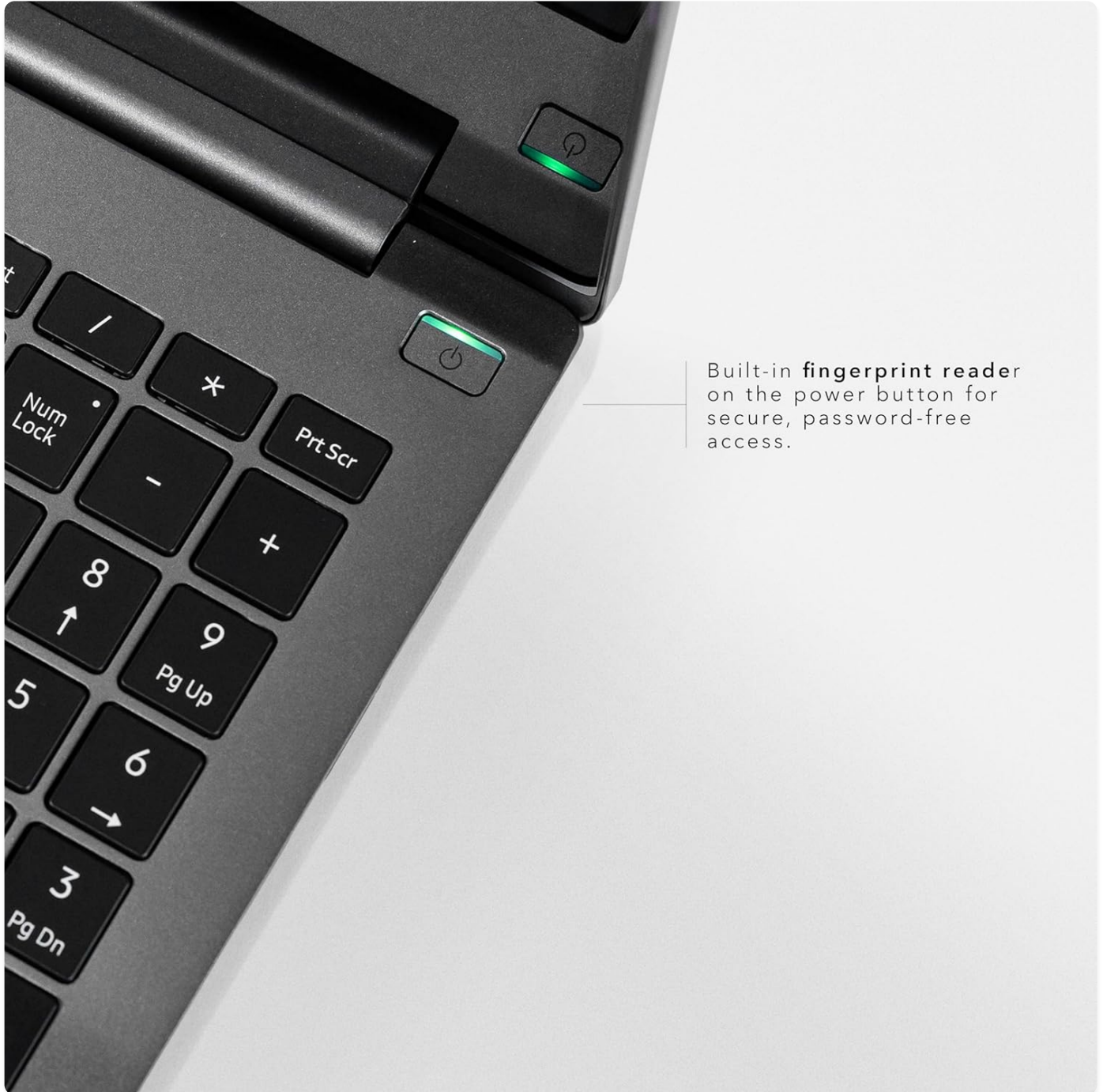
Image: A detailed view of the VAIO FS 16-inch Laptop's keyboard area, focusing on the power button with its built-in fingerprint reader for secure, password-free access.

For enhanced security and convenience, set up the integrated fingerprint reader and Windows Hello IR camera. Navigate to Windows Settings > Accounts > Sign-in options to configure these features for fast, secure logins.