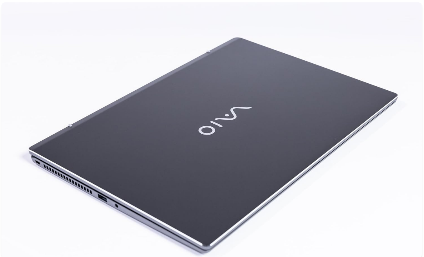
Image: A closed VAIO FS 16-inch Laptop, highlighting its slim profile and the VAIO logo on the lid.

Connect the power adapter to the laptop's power port and then plug it into a wall outlet. It is recommended to fully charge the battery before initial use.