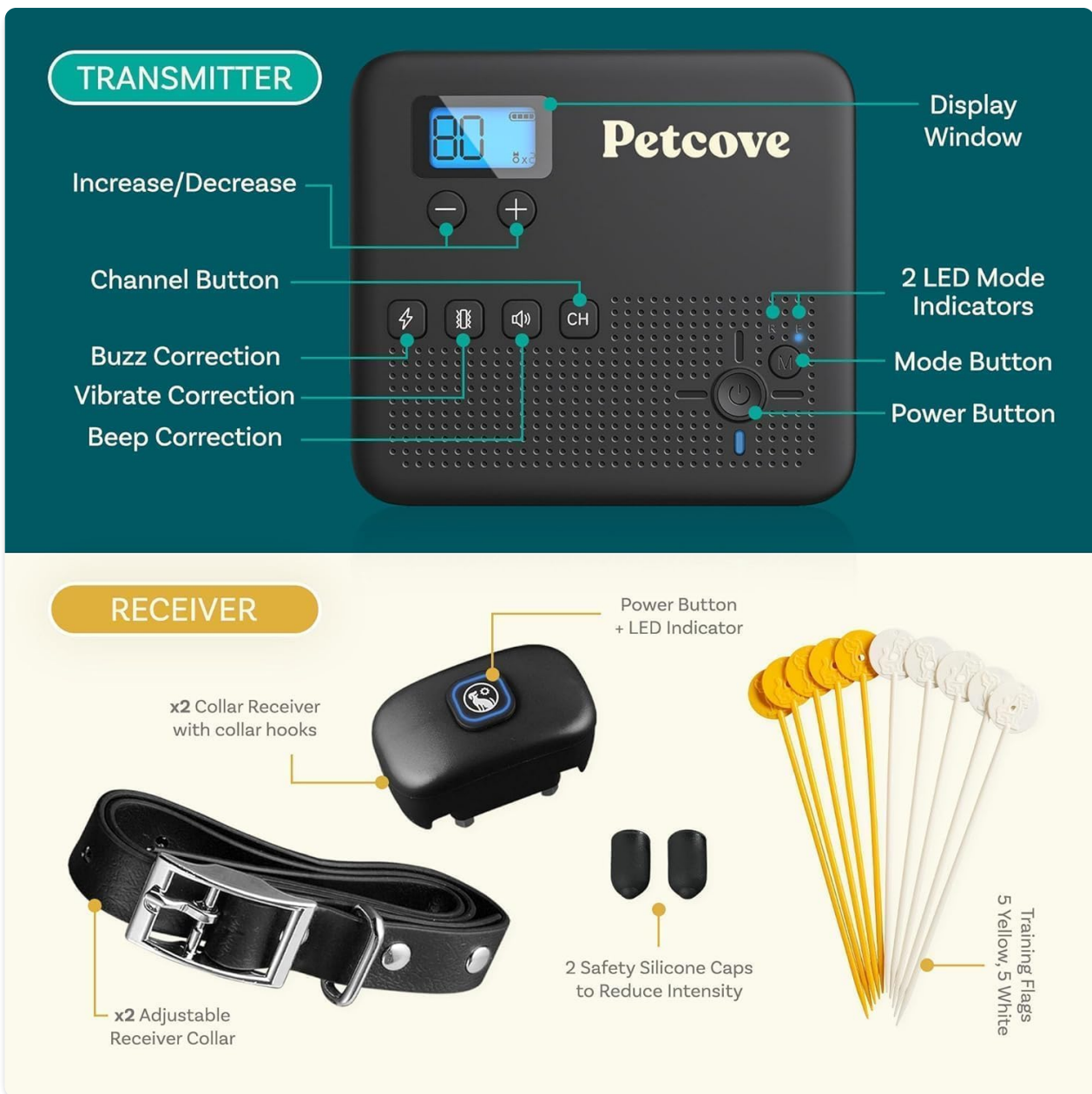
Figure 3.1: Detailed view of the Transmitter and Receiver components.