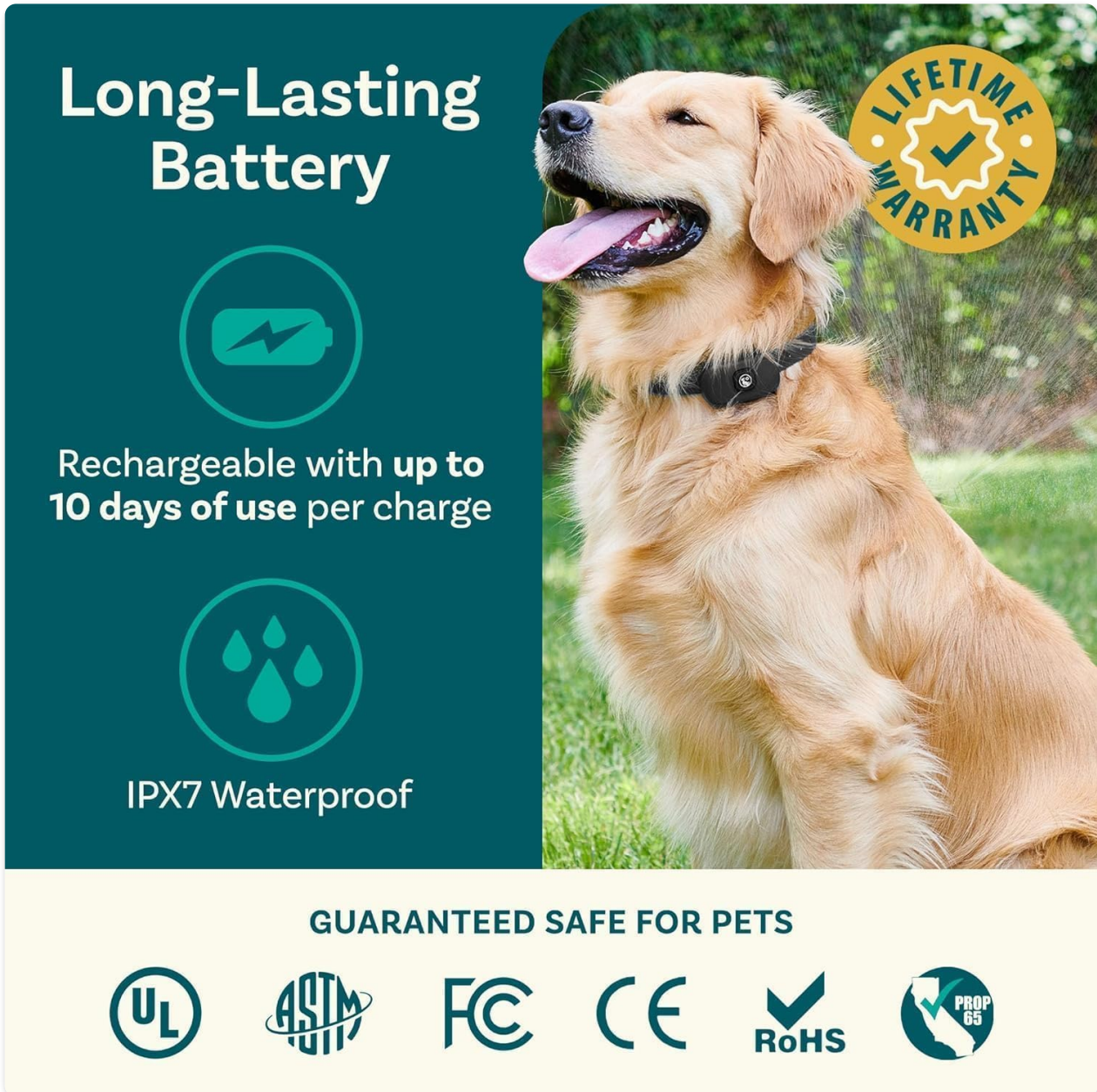
Figure 5.1: The PetCove system offers both wireless fence and remote training functionalities.