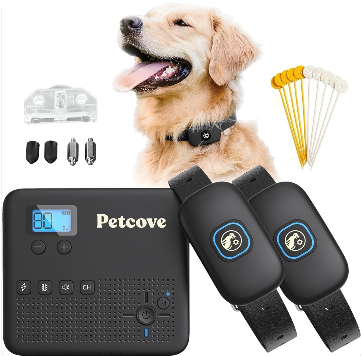
Figure 2.1: All components included in the PetCove Wireless Dog Fence System package.