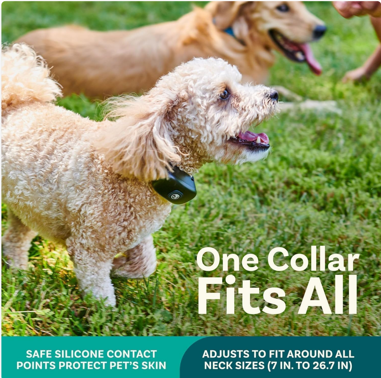
Figure 4.2: The adjustable collar ensures a comfortable and secure fit for various dog sizes.