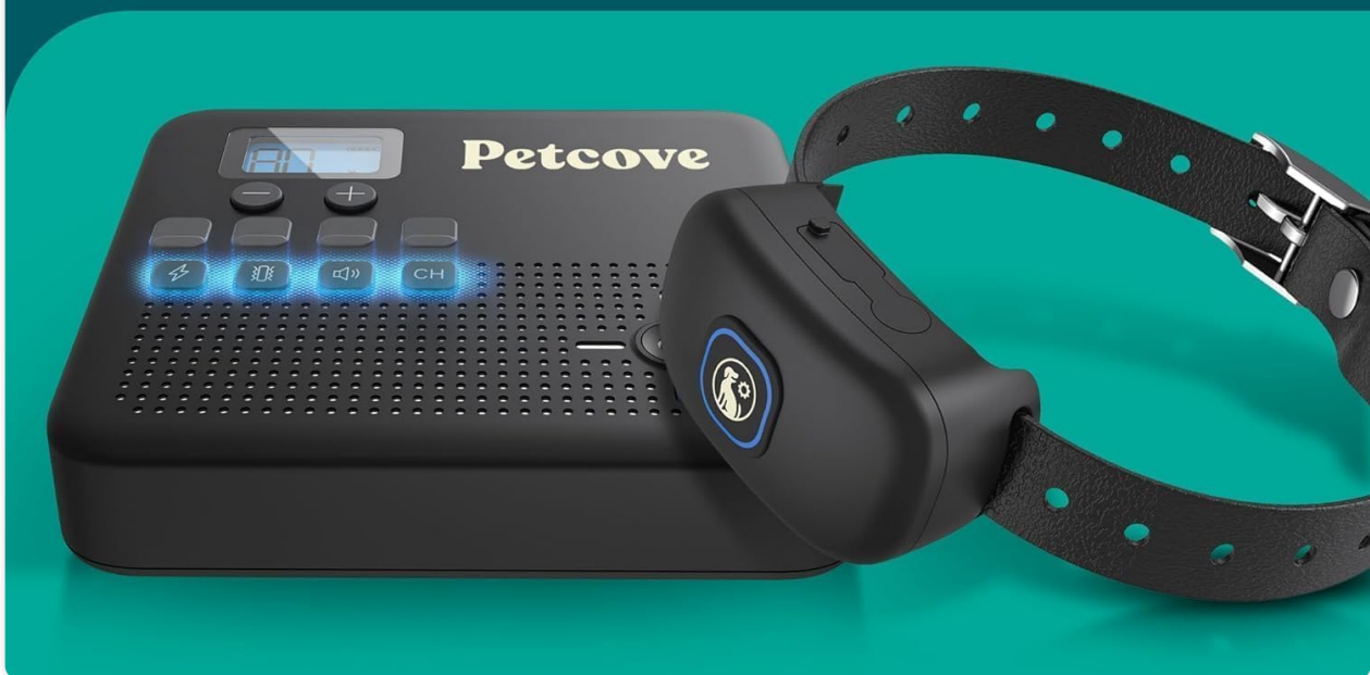
Figure 4.3: The transmitter allows for custom control of training modes and signal range.