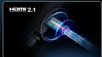
Image: Overview of Haier S81 Series QLED 50-inch TV features, including Dolby Audio, Google TV, Gaming Accelerator, and HDR 10.