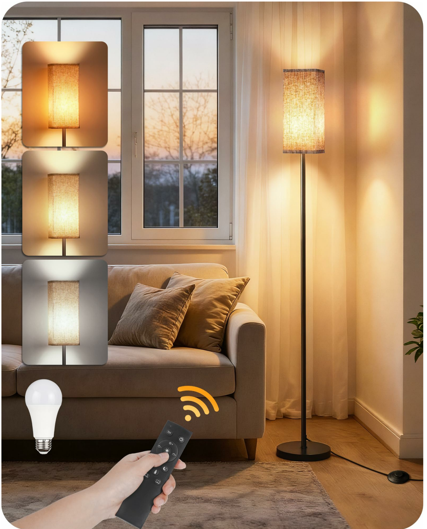
The GOEBLESON 64.2 inch Dimmable Floor Lamp, showcasing its modern design and soft illumination in a living room environment.