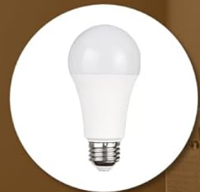
A19 Bulb Included