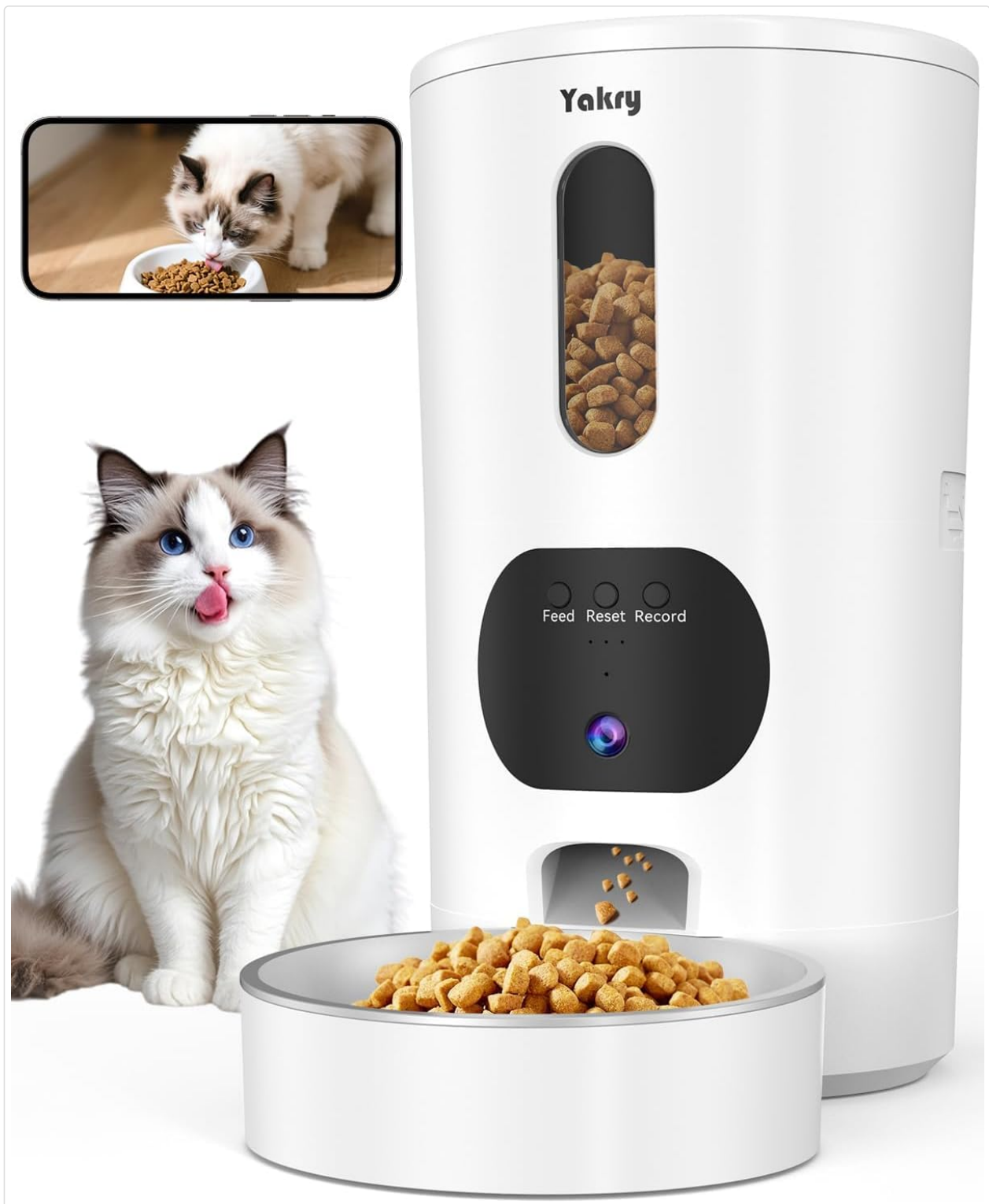
Figure 2.1: Assembled Yakry Automatic Cat Feeder with Camera.