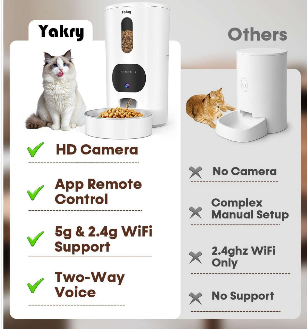
Figure 3.2: Two-way audio communication with your pet.