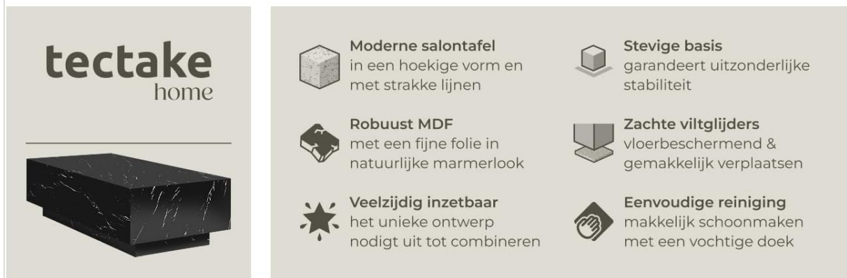
Image 5.1: An overview of the table's key features, highlighting its robust construction, stable design, floor protection, and ease of maintenance.