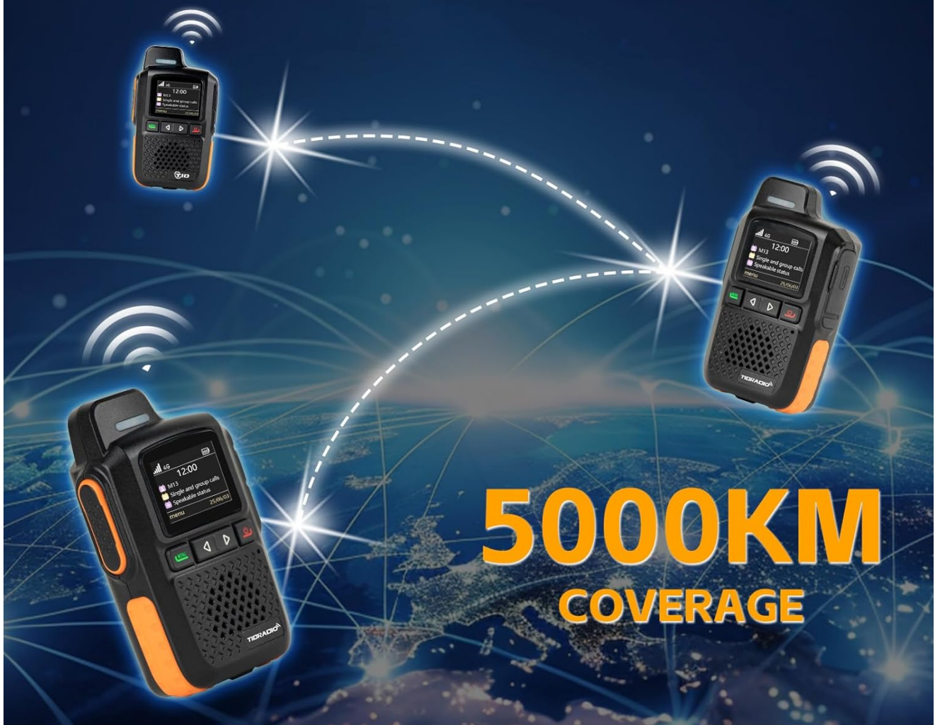
Figure 4: Global Intercom Capability of TD-M13.

TD-M13 Works anywhere with cellur 4G LTE coverage.