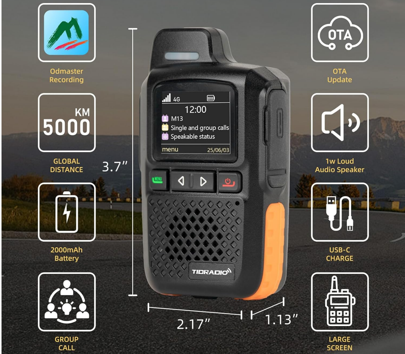
Figure 2: TD-M13 Product Dimensions and Basic Functions.