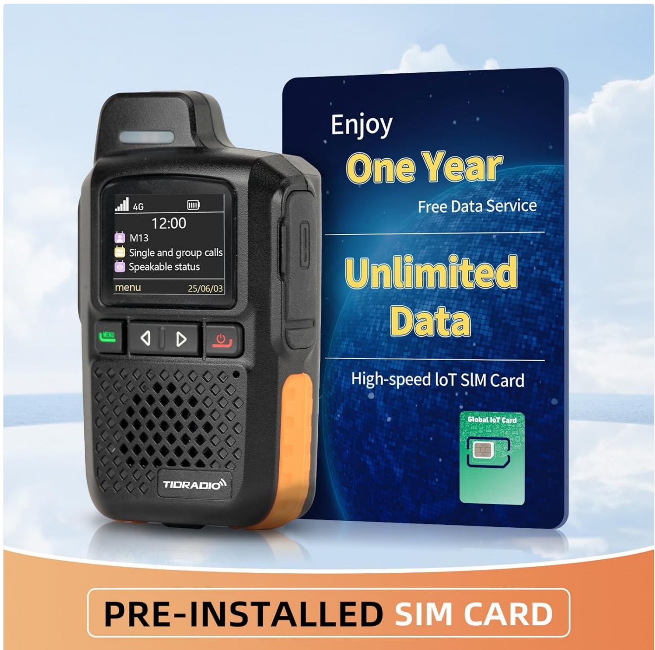
Figure 3: Pre-installed SIM Card and Data Service Information.

3. Reinstall the battery and battery cover.