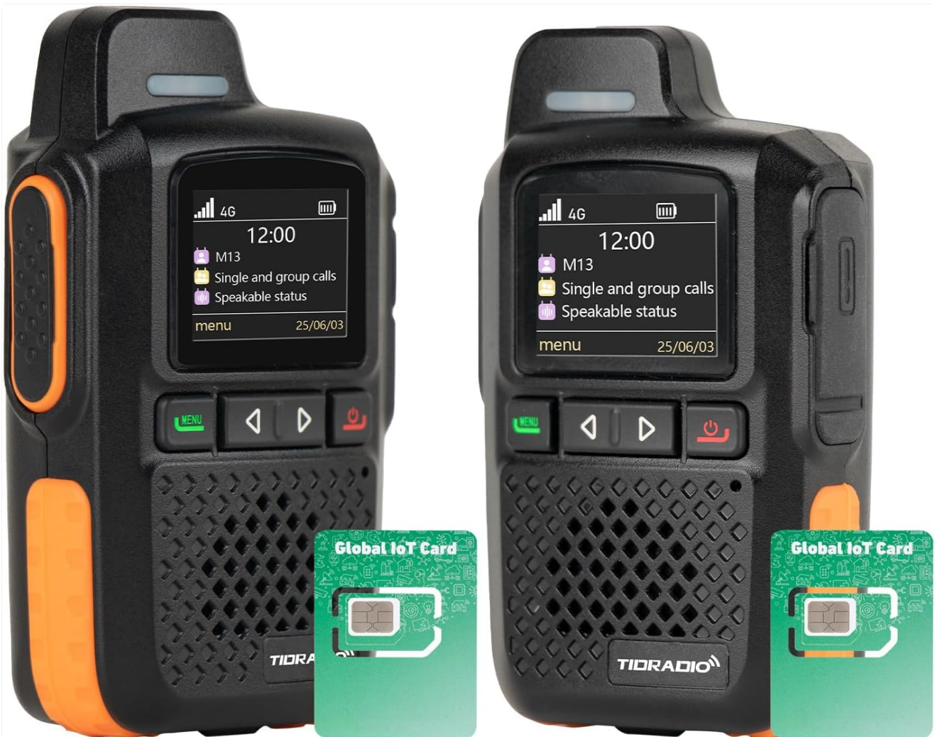
Figure 1: TIDRADIO TD-M13 Global Walkie Talkies with SIM Cards.