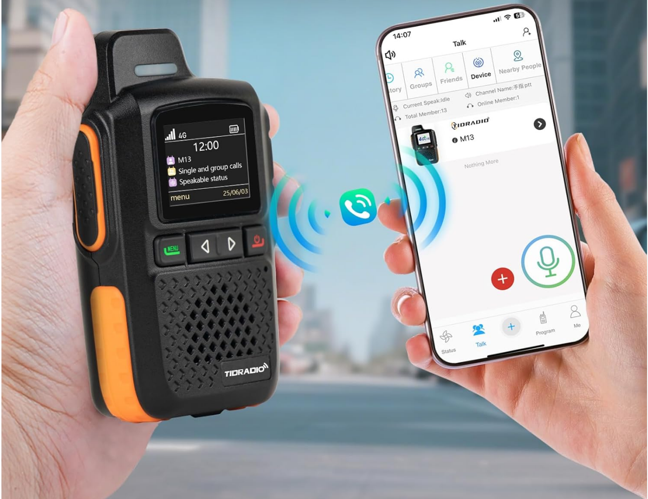
Figure 6: Odmaster App 'Talk on Phone' Feature.