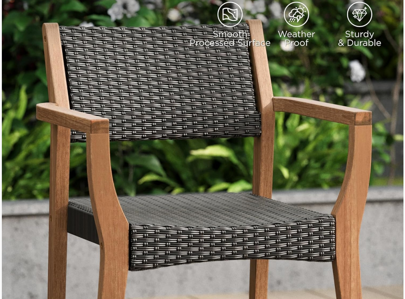
Image: A close-up view of a PHI VILLA dining chair, highlighting the acacia wood frame and the woven wicker back and seat. Text overlays indicate "Premium Selected Acacia Wood," "Smooth Processed Surface," "Weather Proof," and "Sturdy & Durable."

Elevate the Sophisticated Atmosphere of Your Patio