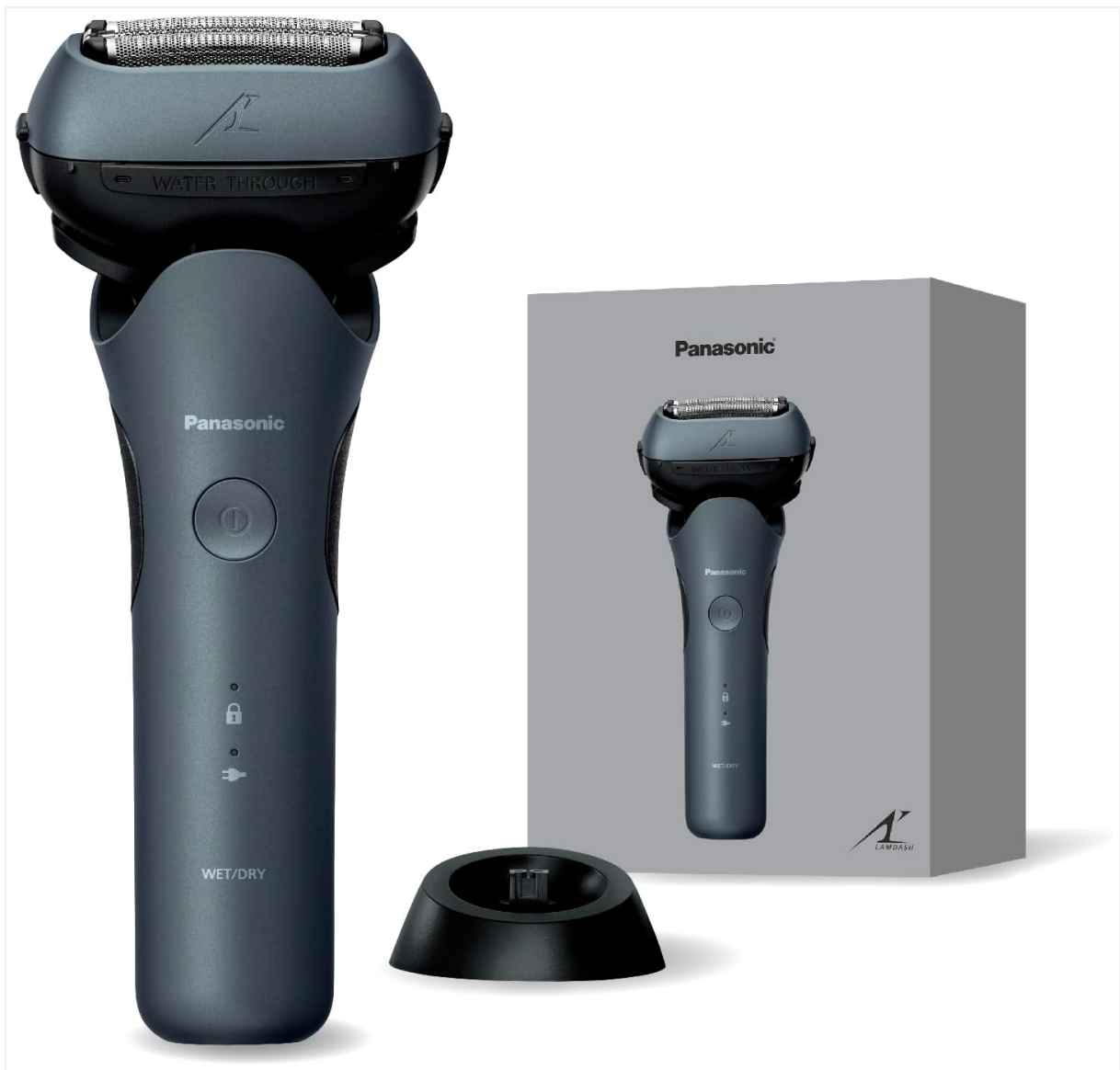
Image 1.1: Panasonic Lamdash ES-L361W-A Shaver, Charging Stand, and Box.