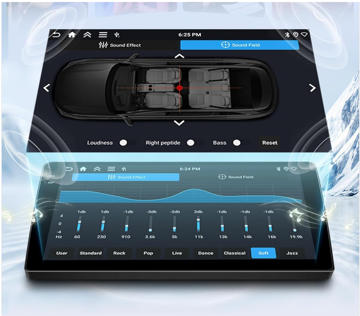
Interface for adjusting DSP and 32-band equalizer settings.