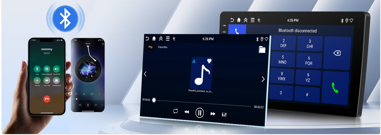
Illustration of Bluetooth 5.0 connectivity for calls and music.