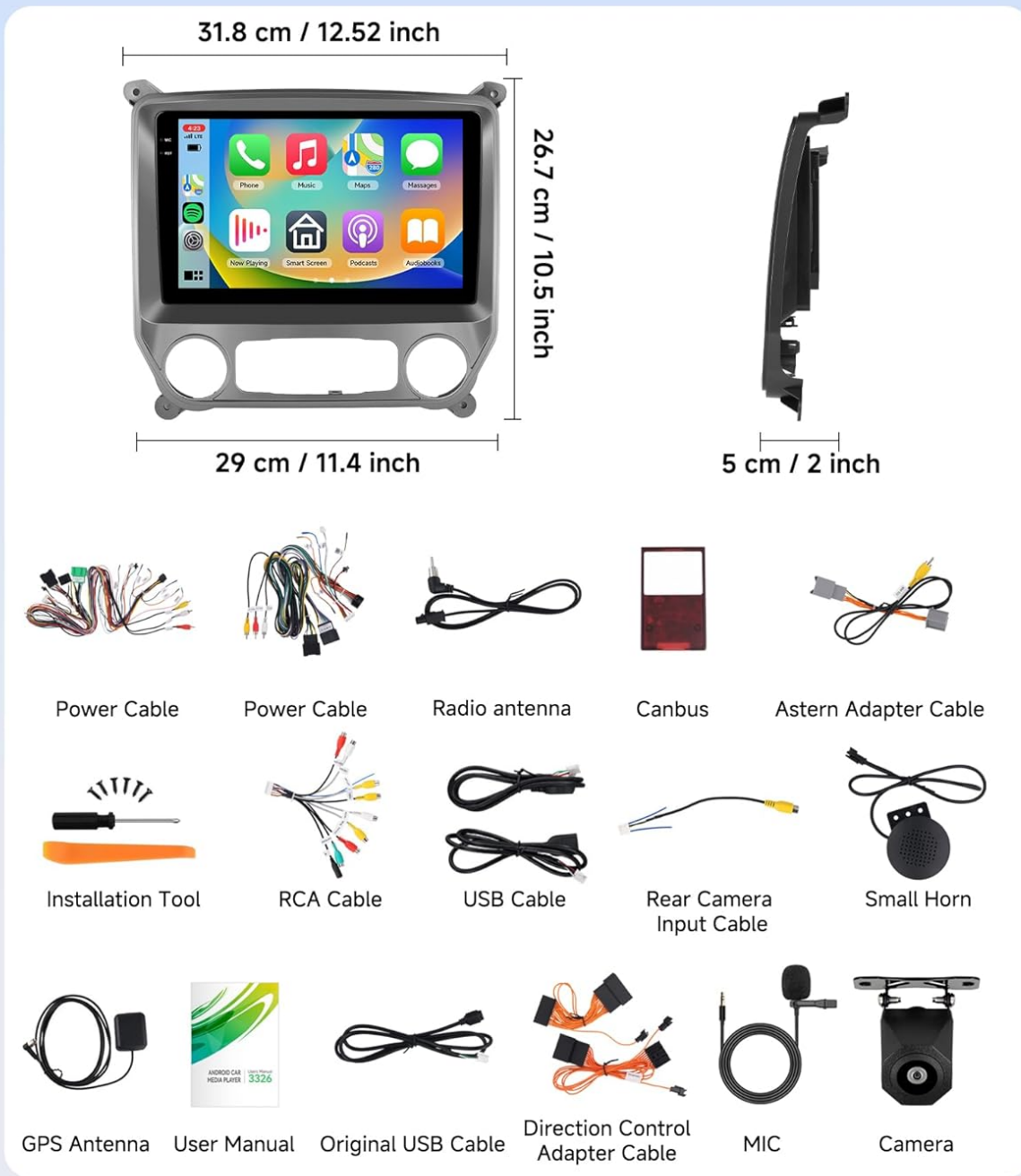
Overview of the car stereo dimensions and included accessories like cables, camera, and tools.