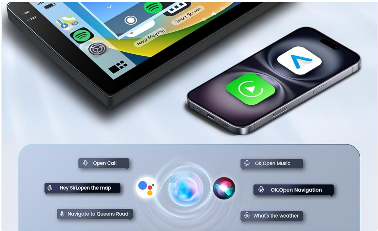
Visual representation of Wireless Carplay and Android Auto interfaces.