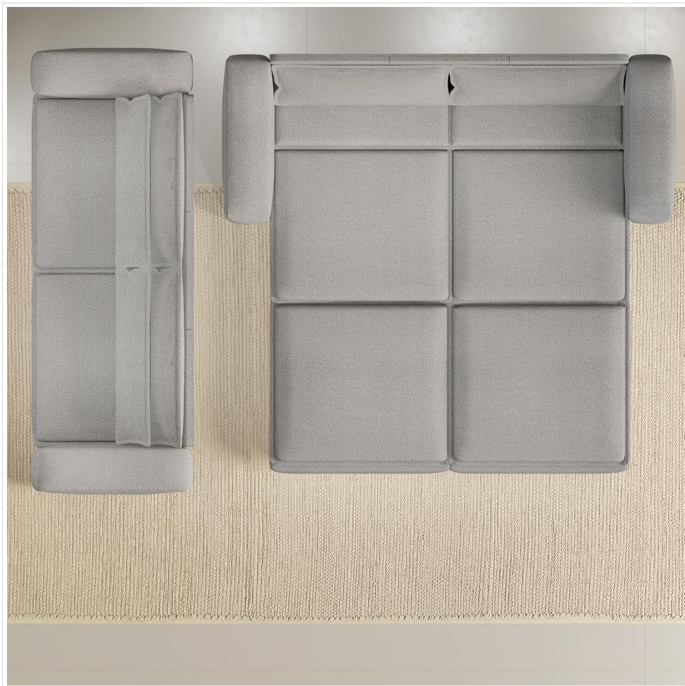
Image: A visual sequence illustrating the three configurations: 3-seat sofa, chaise lounge, and King Size bed, highlighting the convertible functionality.