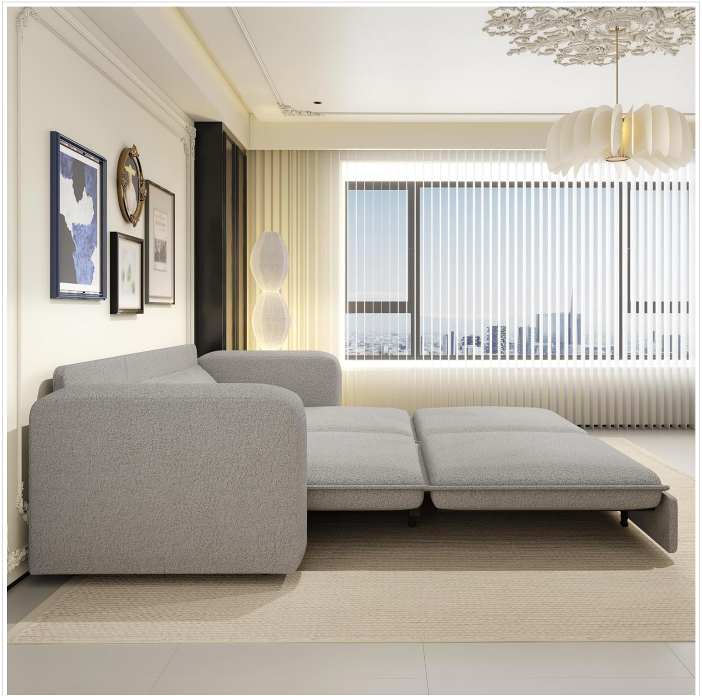
Image: The Polibi sofa transformed into a chaise lounge, offering a semi-reclined position for relaxation.