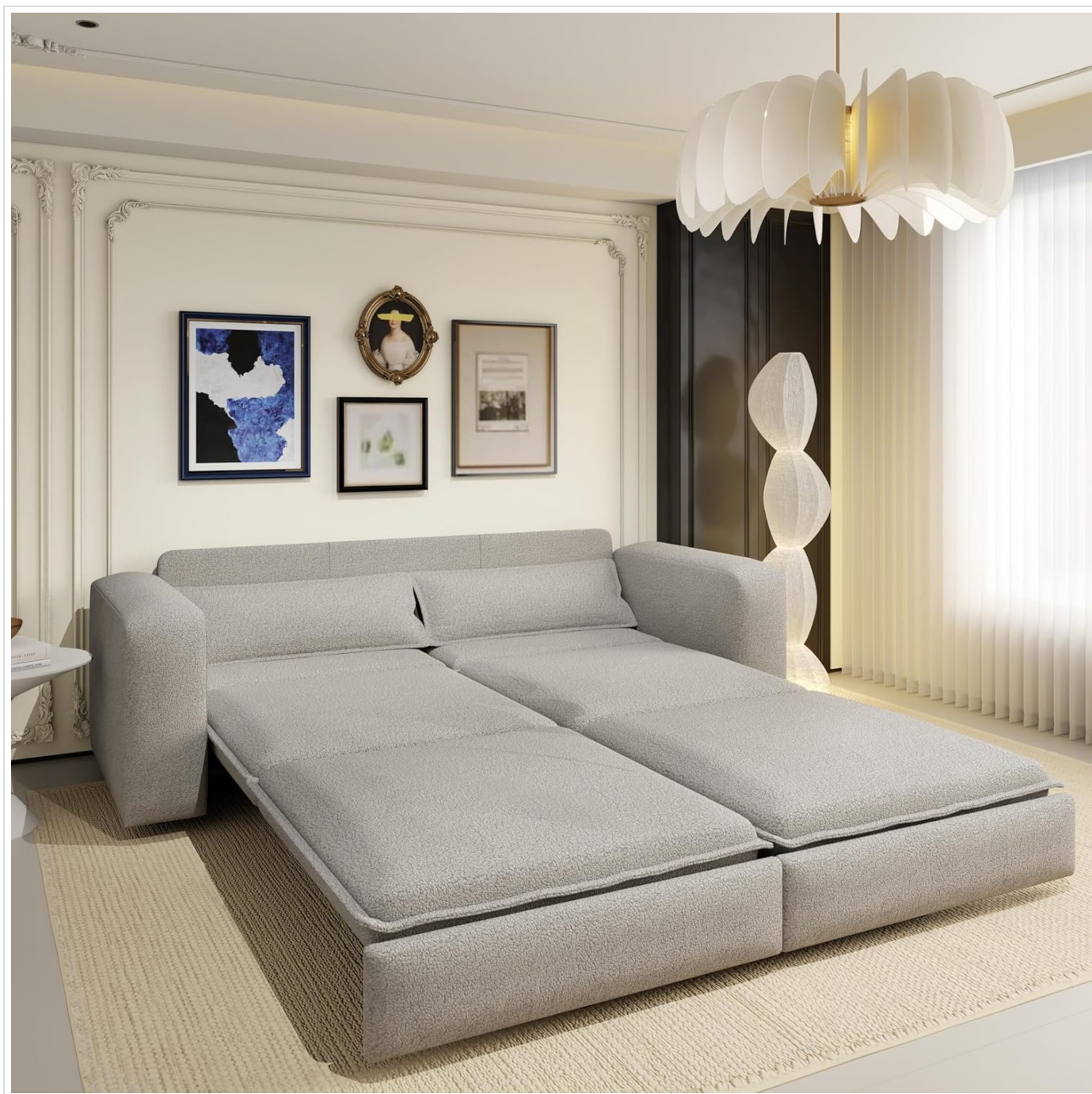
Image: The Polibi sofa fully converted into a King Size bed, providing a spacious sleeping area.