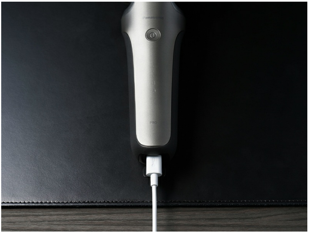
Figure 4: LAMDASH AI+ automatically adjusts power based on beard density.