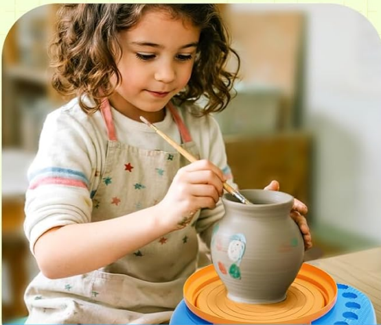
Paint After Dried