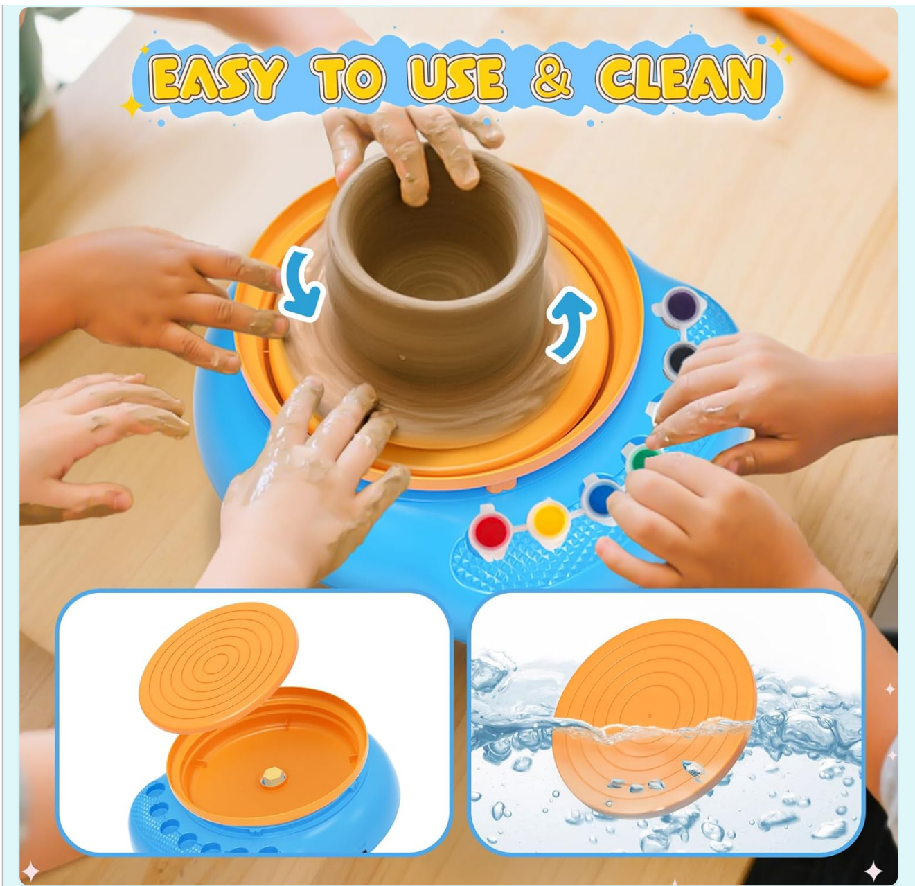
Figure 4: The pottery wheel in action, highlighting its user-friendly design.