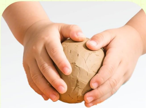
Knead the Clay