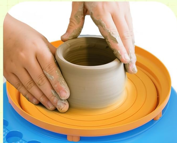
Shaping Your Pottery