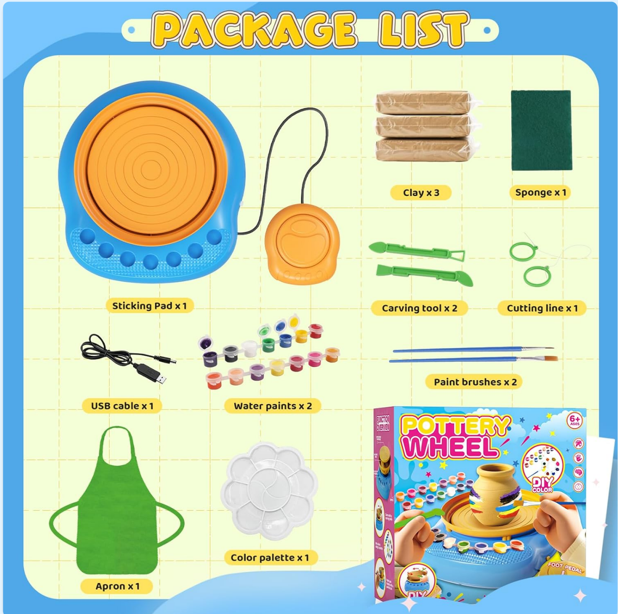
Figure 1: All components included in the Weilim Pottery Wheel Kit.