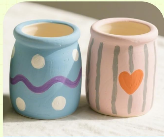
Pottery Artwork Show