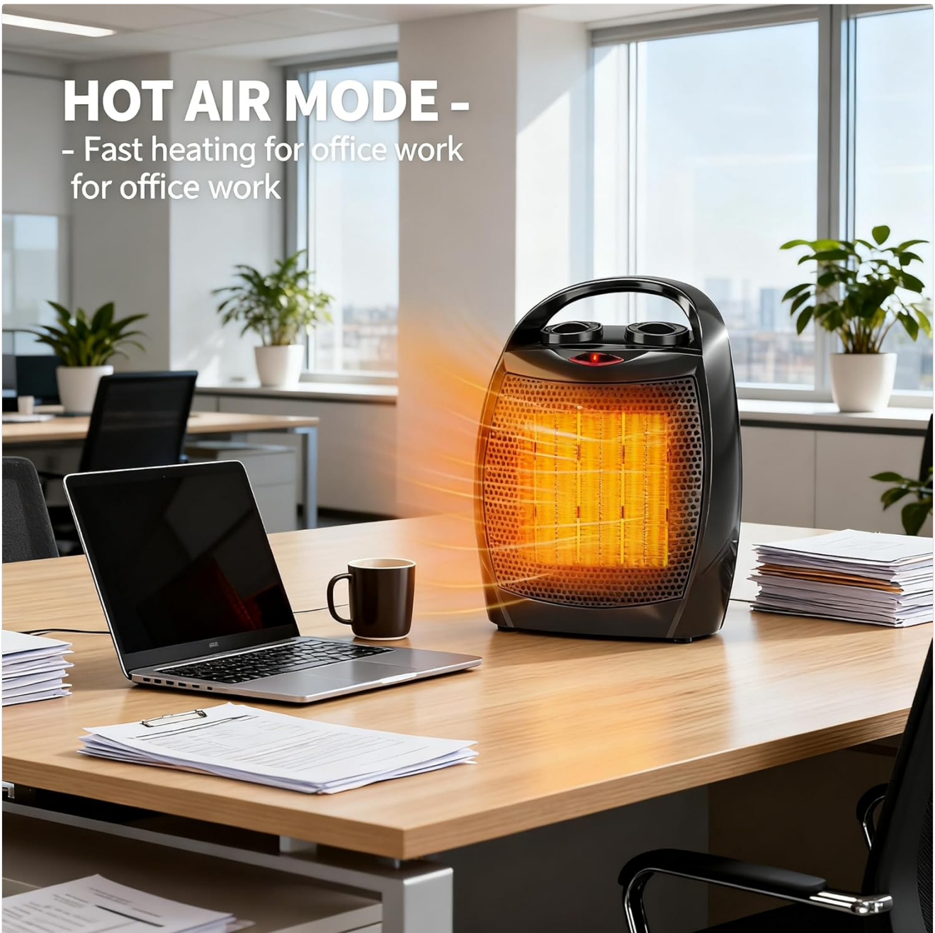
Figure 1: Garvee PTC909A Portable Electric Space Heater, showing its compact design and carry handle.

- Fast heating for office work for office work