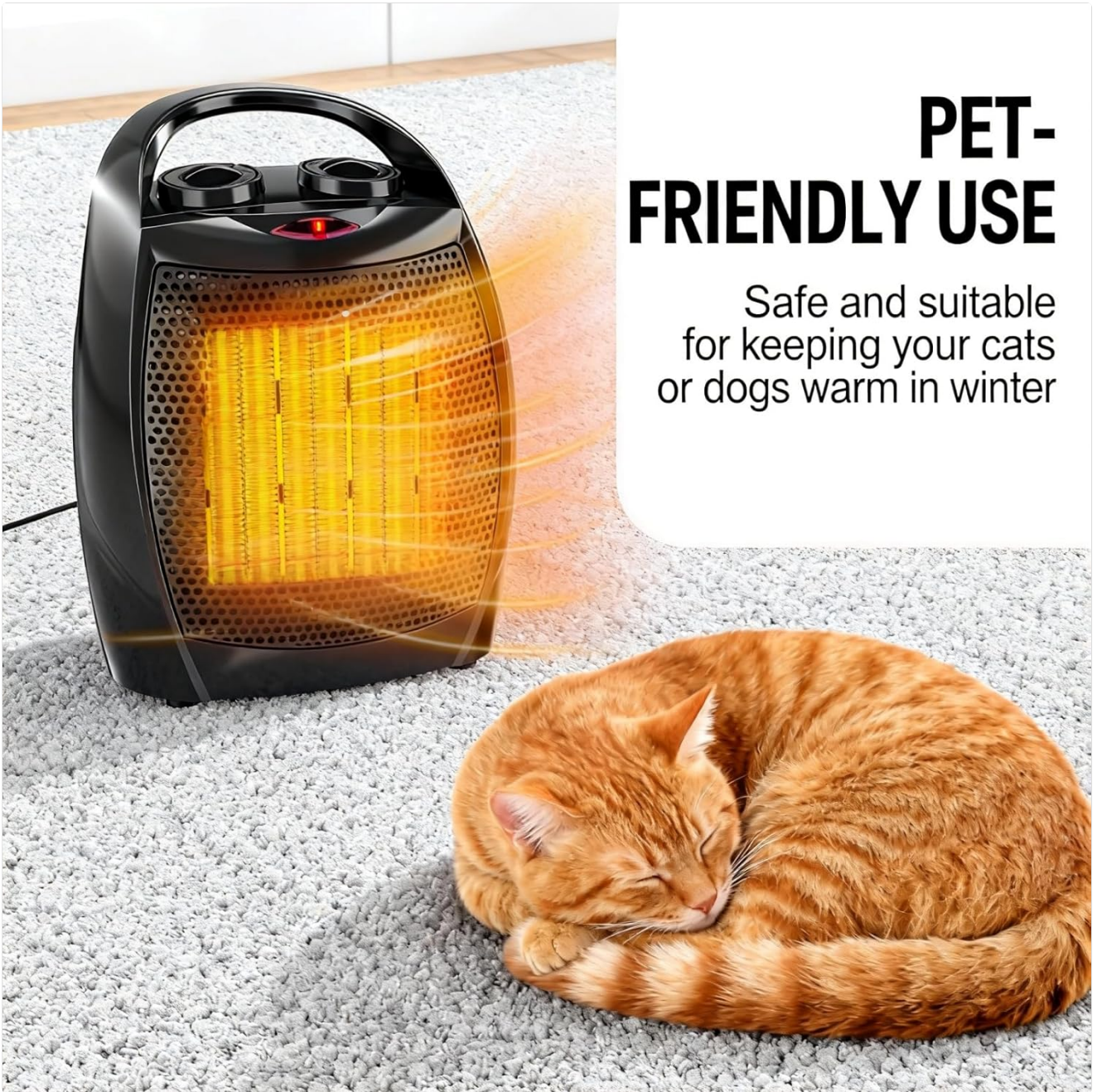
Figure 5: The Garvee space heater in use, providing warmth for a pet cat, highlighting its pet-friendly design.

Safe and suitable for keeping your cats or dogs warm in winter