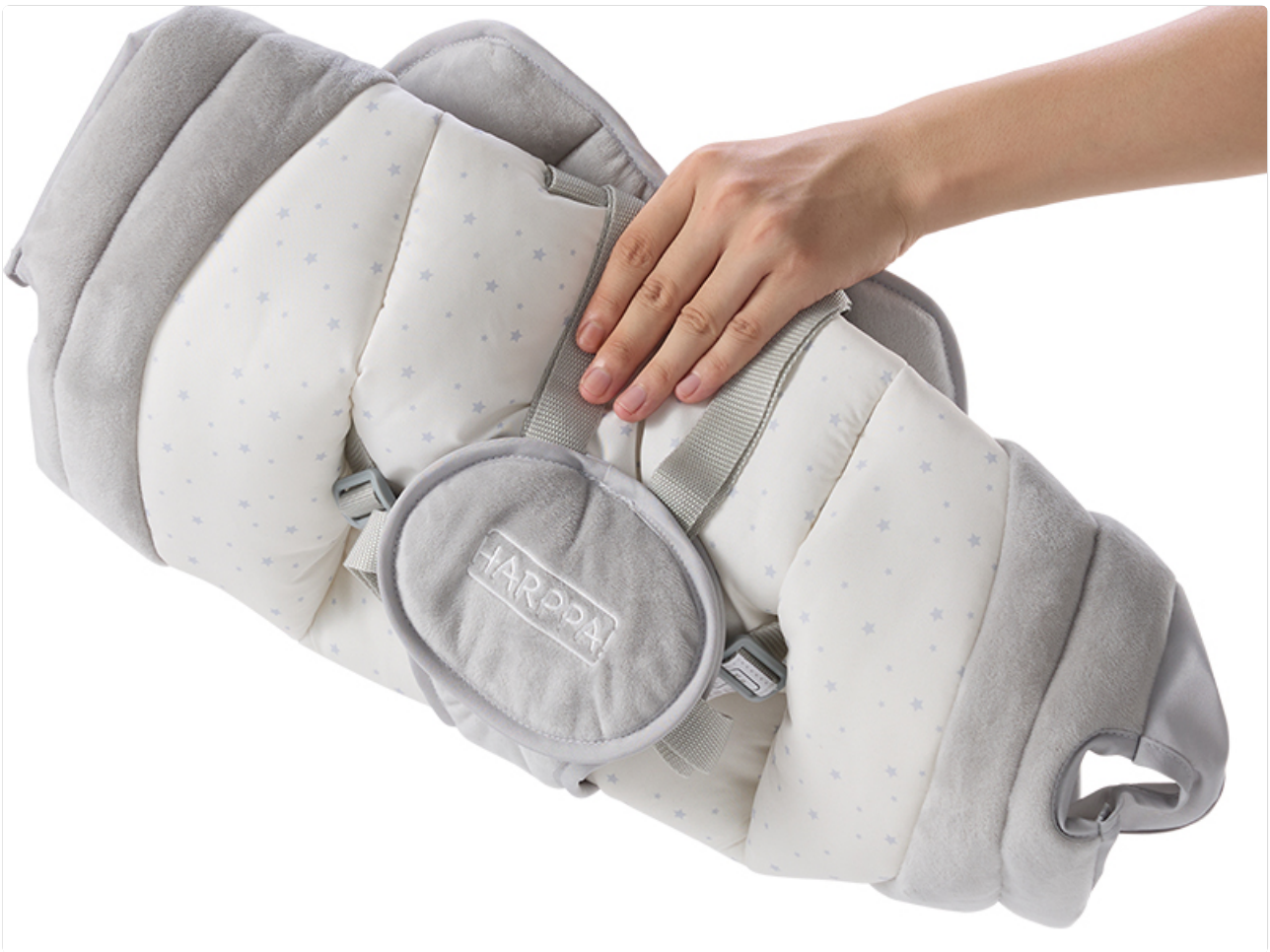
Figure 4: Detachable Seat Pad