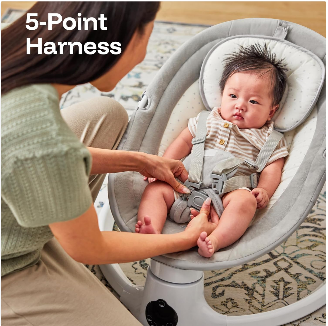
Figure 3: Securing the 5-Point Harness