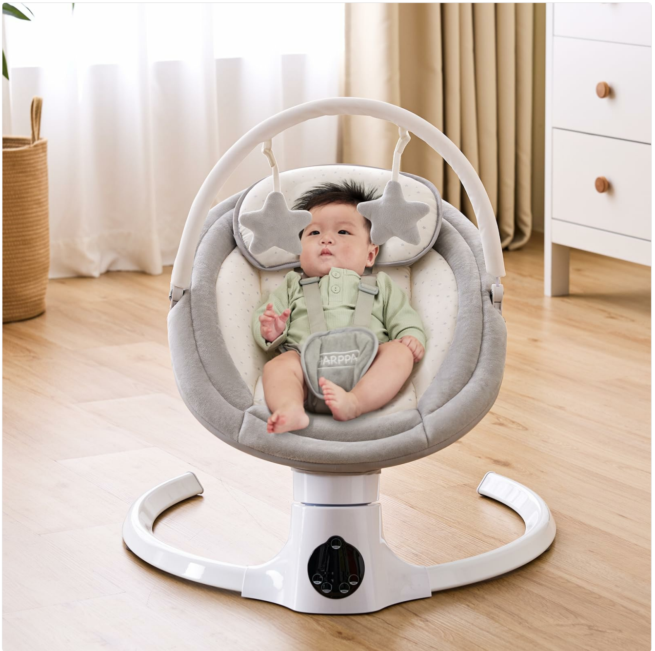
Figure 1: HARPPA Electric Baby Swing (Gray model)