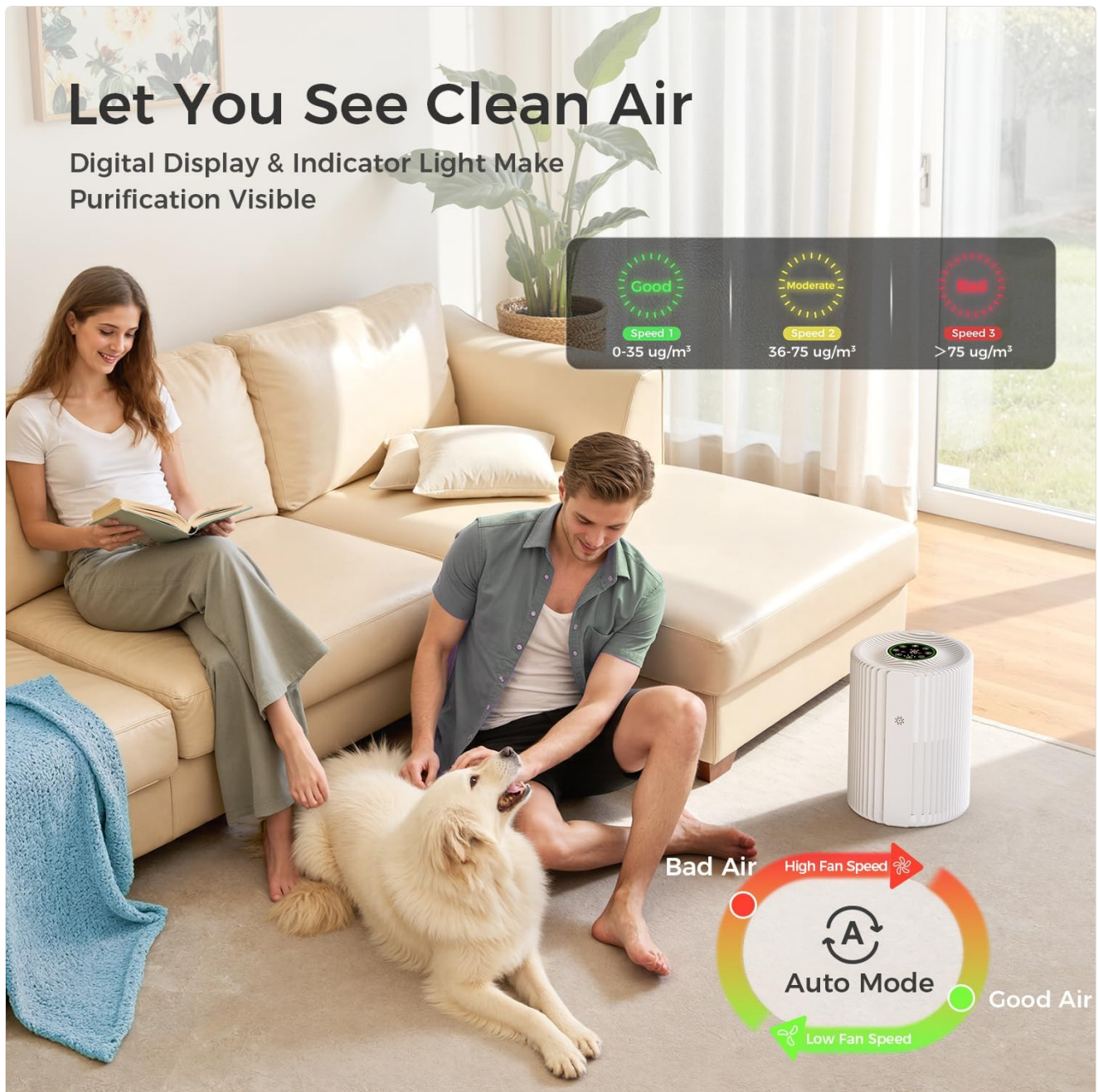
Figure 2: Air Quality Display and Auto Mode. This image illustrates the air purifier's display showing PM2.5 levels and corresponding color indicators for air quality and fan speed adjustments.

Digital Display & Indicator Light Make Purification Visible