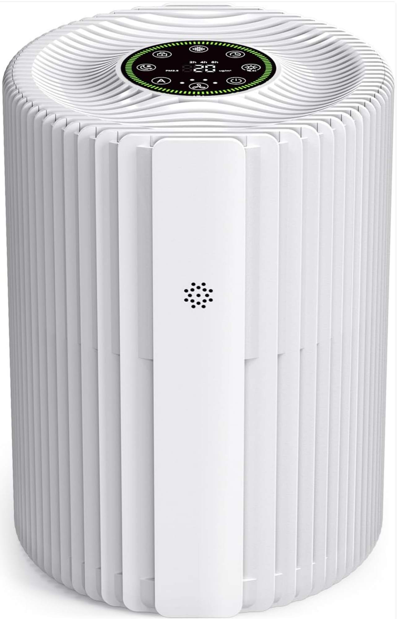
Figure 1: VOOPNU DH-JHD07 Air Purifier. This image shows the overall design of the air purifier, highlighting its cylindrical shape and top control panel.