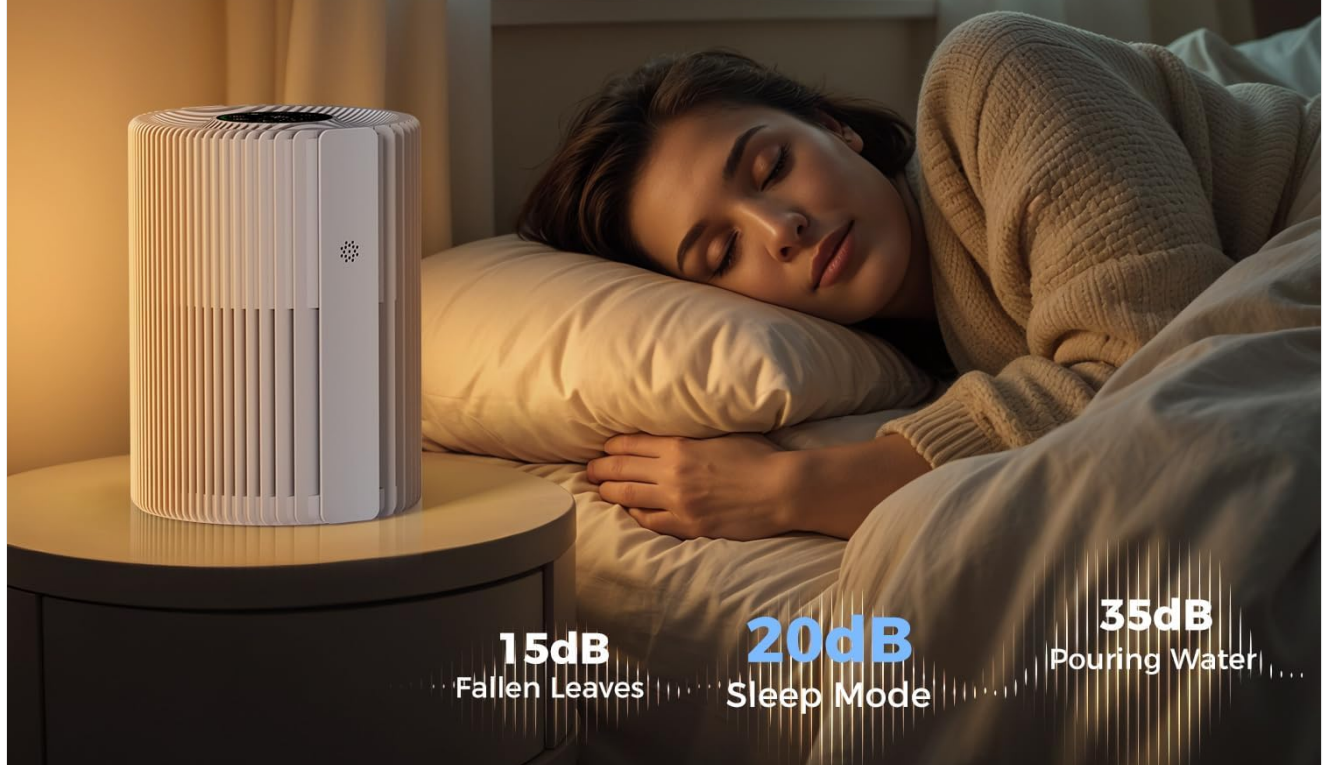
Figure 3: Sleep Mode Operation. This image shows the air purifier operating in a bedroom at night, illustrating its quiet performance in Sleep Mode.