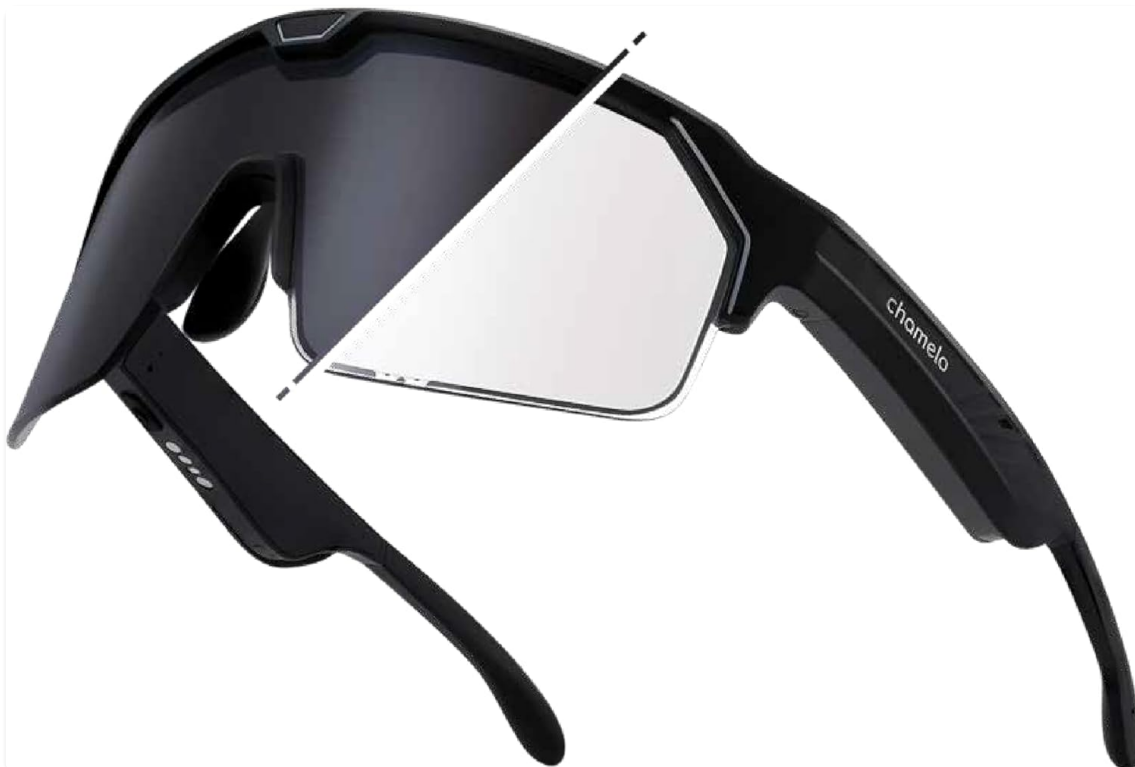
Image 1: CHAMELO Music Shield Smart Audio Sunglasses demonstrating electronic tint adjustment.

Welcome to the world of advanced audio eyewear. The CHAMELO Music Shield Smart Audio Sunglasses combine premium eye protection with integrated open-ear audio technology and electronic tint control. This manual provides essential information for the proper setup, operation, and maintenance of your new smart sunglasses.