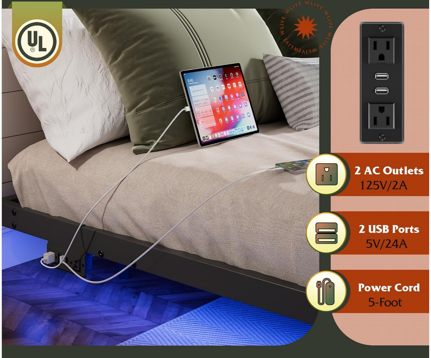
Figure 4: Built-in Charging Station.