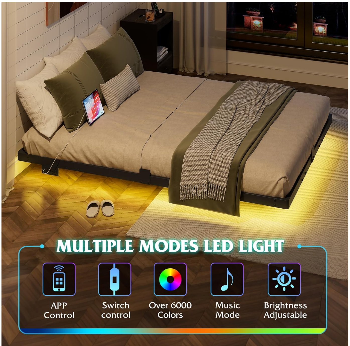
Figure 3: LED Light Features and Control Options.