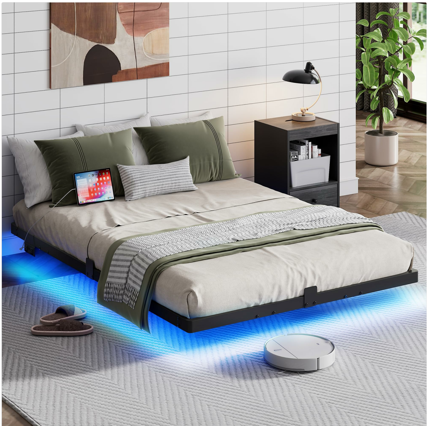
Figure 2: Fully assembled WLIVE Floating Full Bed Frame.