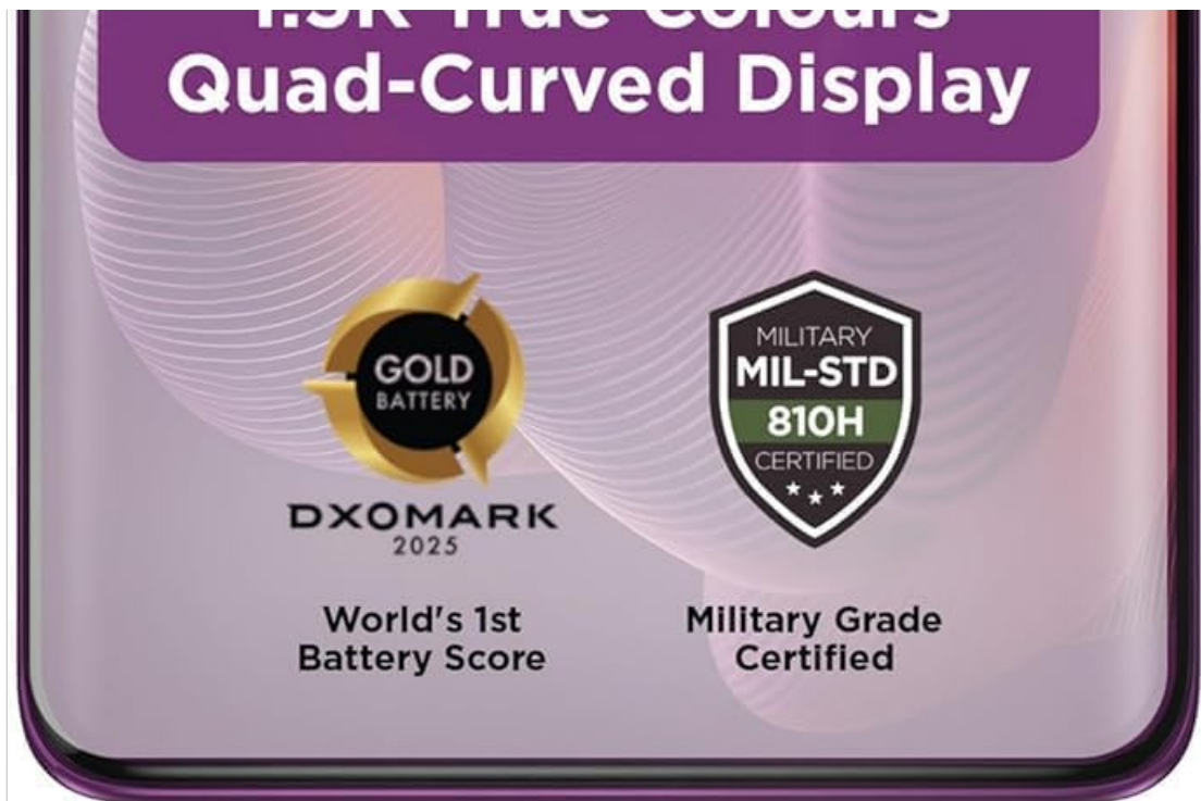
Image: Front view of the Motorola Moto Edge 60 Pro, highlighting its curved display and key features like the 50MP+50MP+50X AI Camera, Moto AI, and 1.5K True Colours Quad-Curved Display.