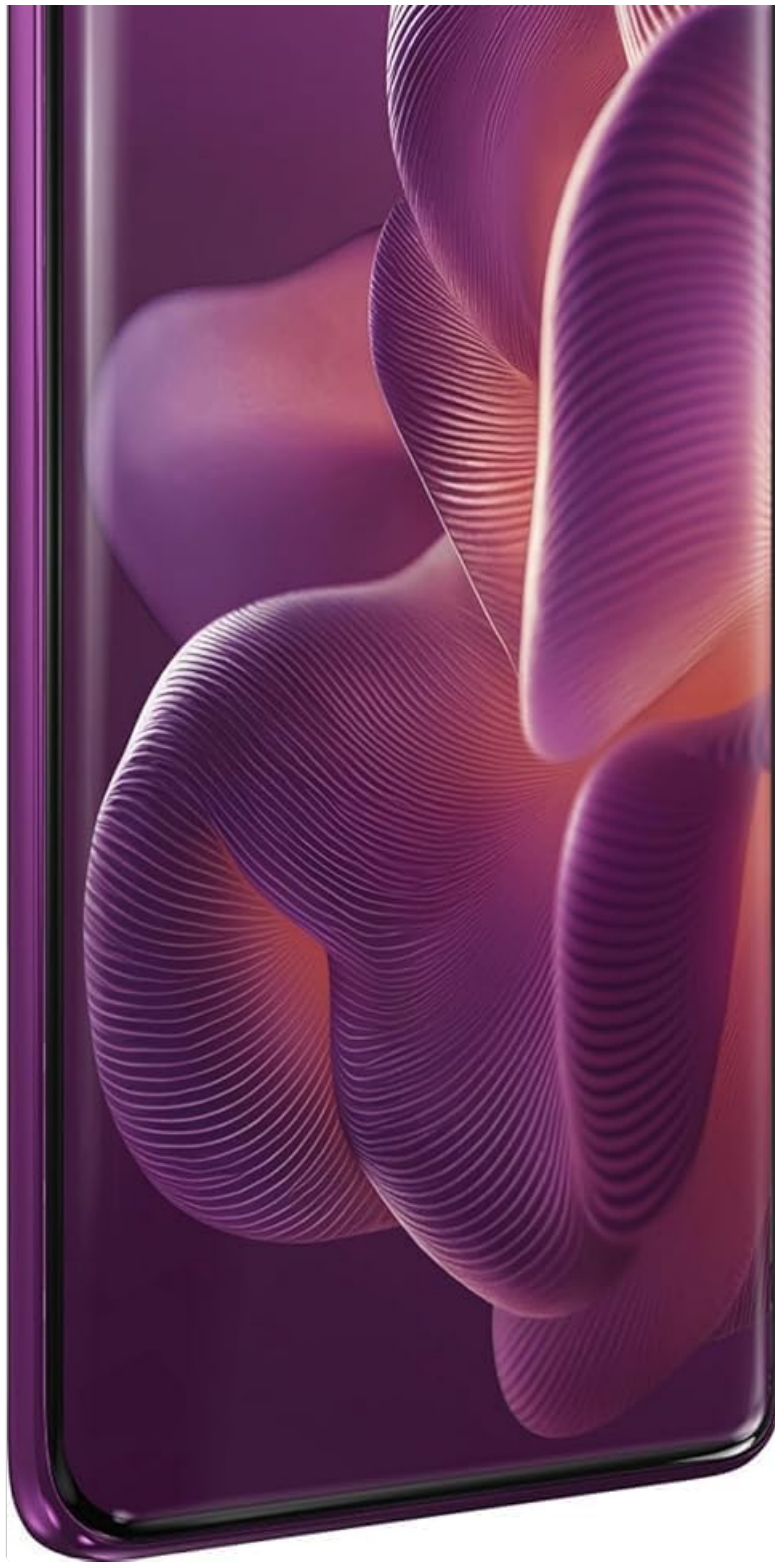
Image: Side view of the Motorola Moto Edge 60 Pro, emphasizing the curved display and slim profile.