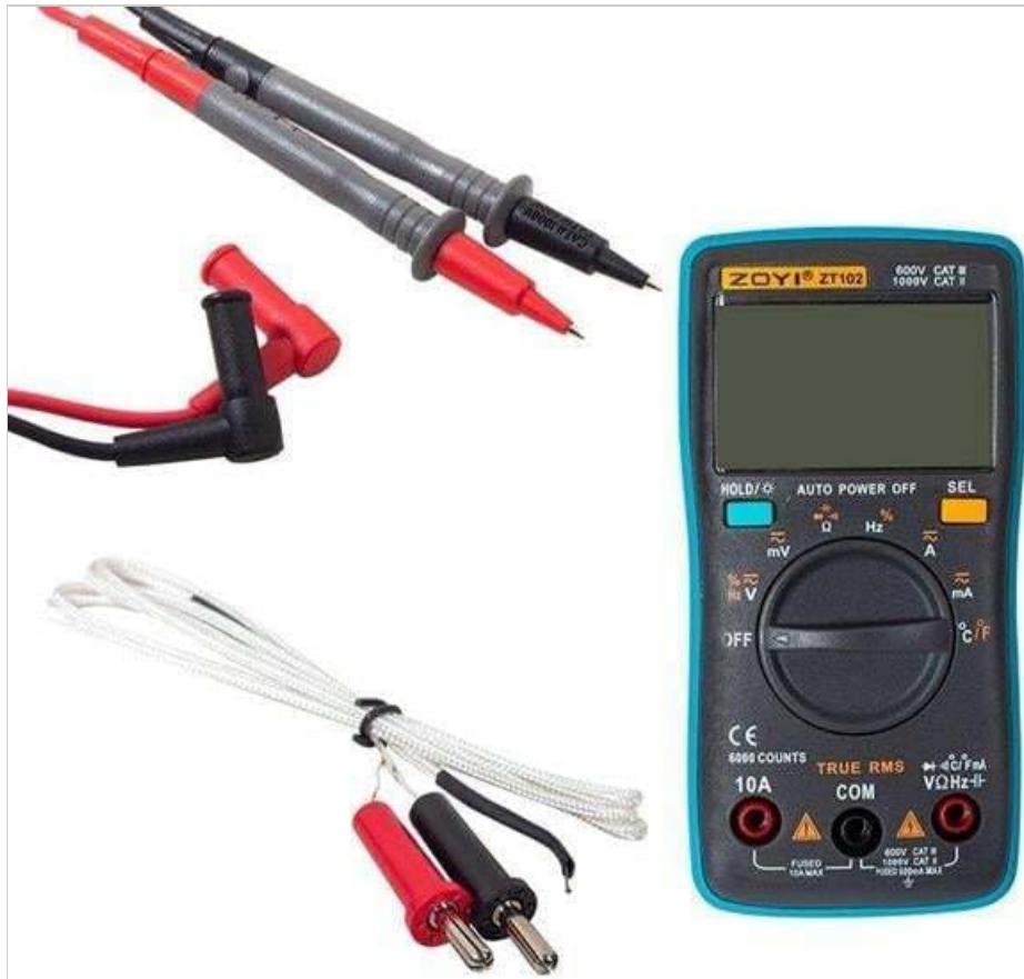
Image: The Zoyi ZT-102 Multimeter with test leads connected to the input jacks.