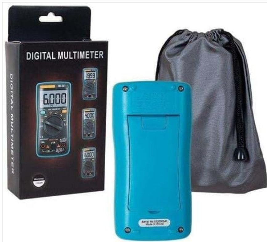
Image: The Zoyi ZT-102 Digital Multimeter, its retail packaging, and the gray carrying bag.