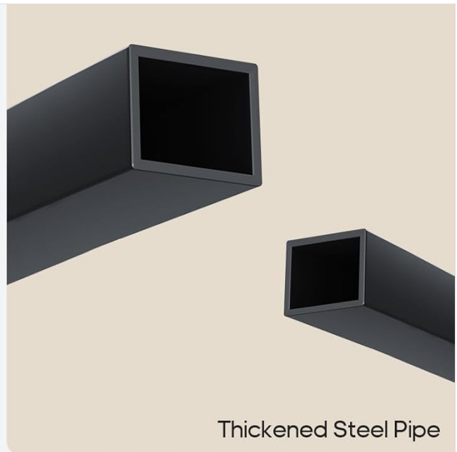
Thickened Steel Pipe