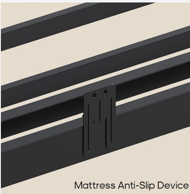
Mattress Anti-Slip Device