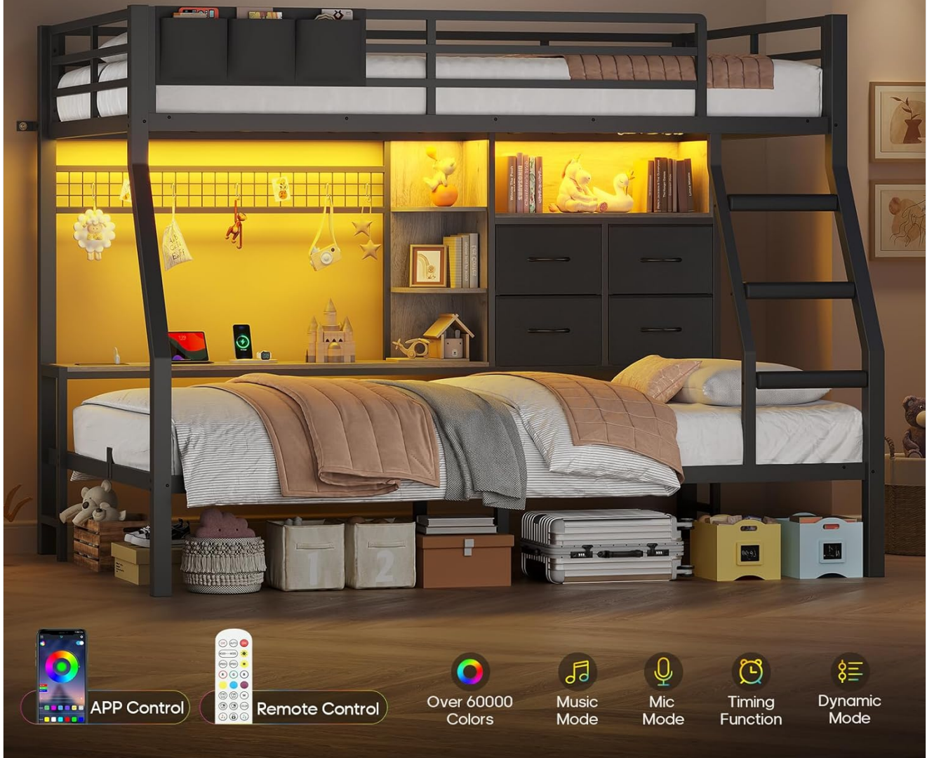
Image: The bunk bed illuminated with colorful LED lights, showcasing the various lighting options and controls available via app and remote.

Create a cozy environment, and it can also be used as a night light