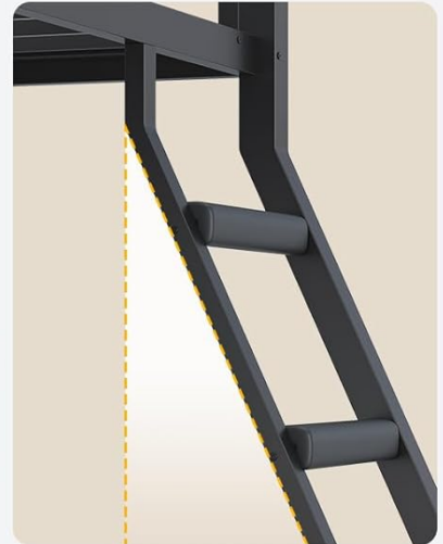
Inclined Ladder Design