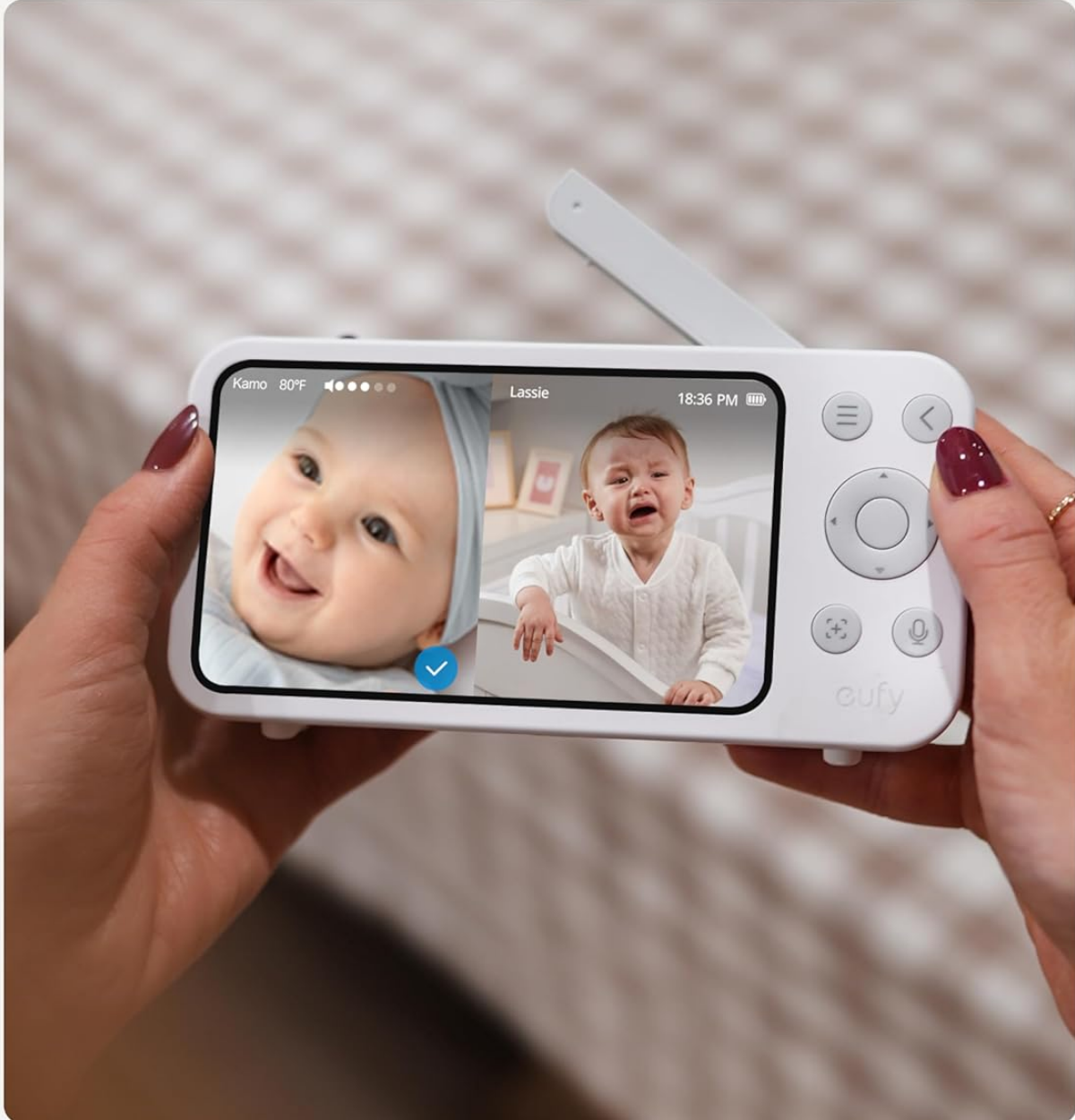
Image: The eufy Baby Monitor E20 parent unit displaying a split-screen view, showing two different babies in their cribs, highlighting the comprehensive protection feature.