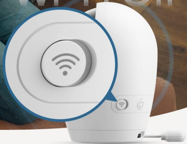
Image: The eufy Baby Monitor E20 camera with a close-up on its Wi-Fi off switch, emphasizing its full privacy and security features.