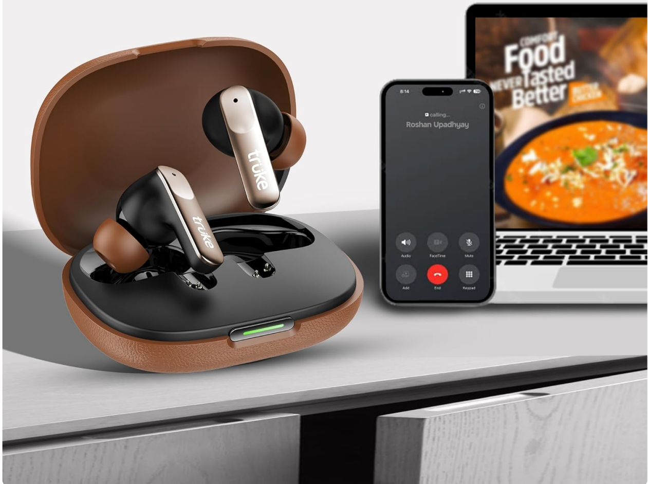
Image: truke Mega 8 Dual Pairing Feature. This image shows the earbuds and case next to a smartphone making a call and a laptop, illustrating the ability to connect to two devices simultaneously.

Connect the Earbuds to Two Devices Simultaneously