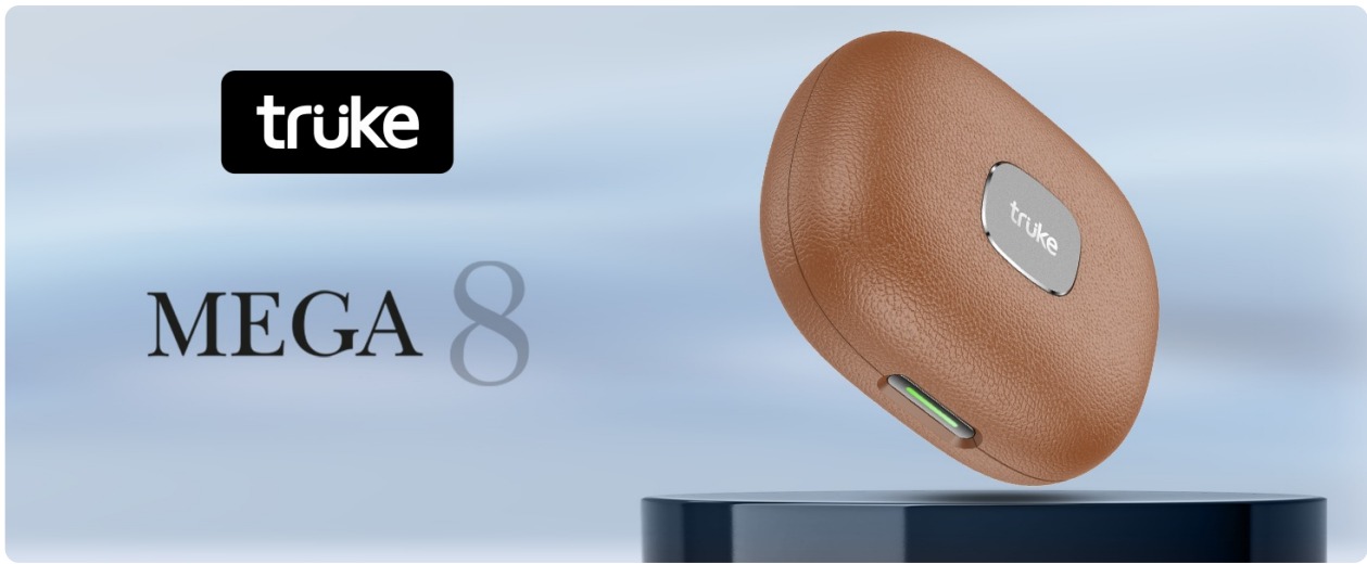
Image: truke Mega 8 Earbuds and Charging Case. This image displays the truke Mega 8 earbuds inside their walnut brown leather-finish charging case, alongside the truke brand logo.