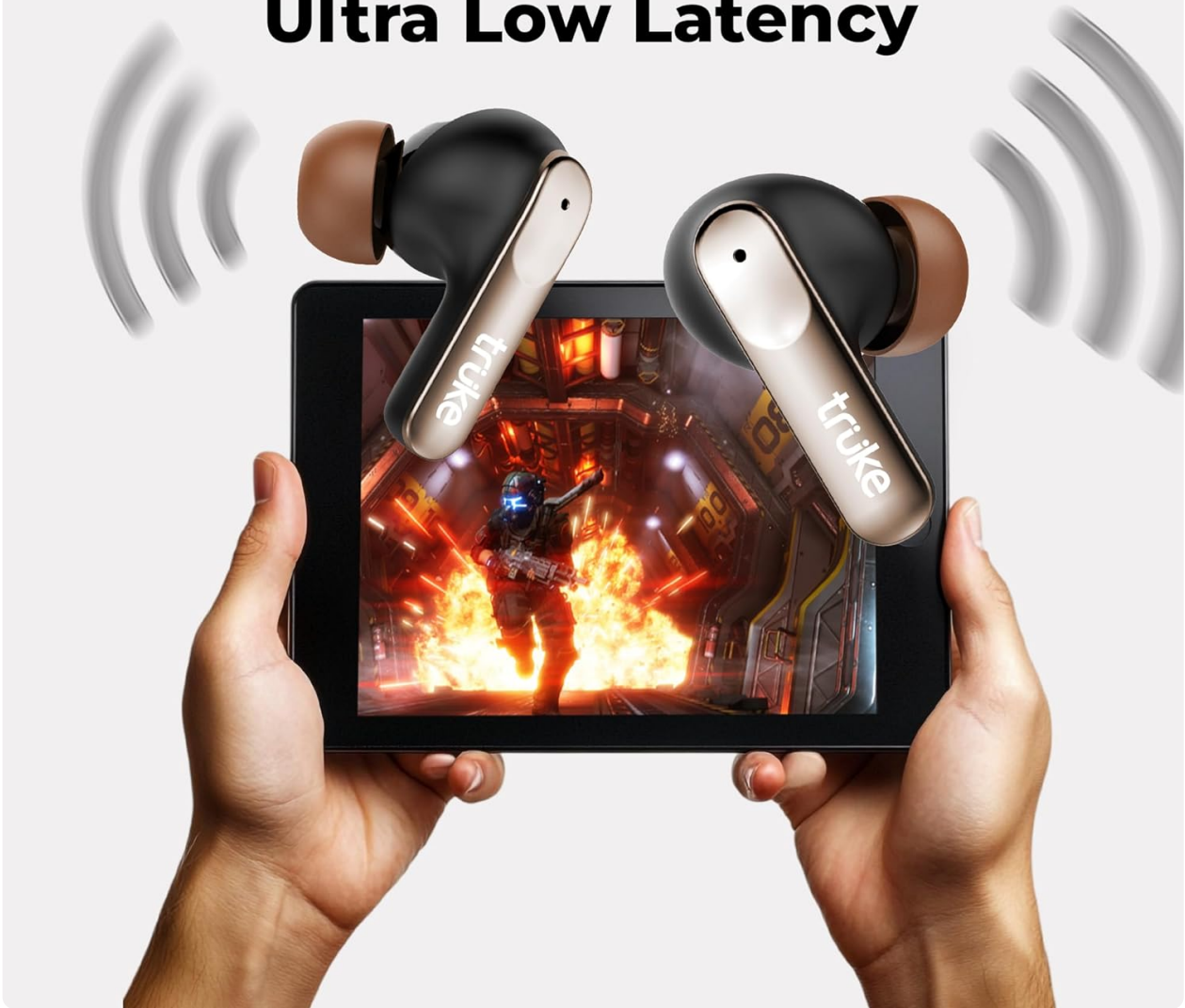
Image: truke Mega 8 40ms Ultra Low Latency. This image depicts the earbuds next to a tablet displaying a gaming scene, with sound wave icons indicating low latency audio transmission.