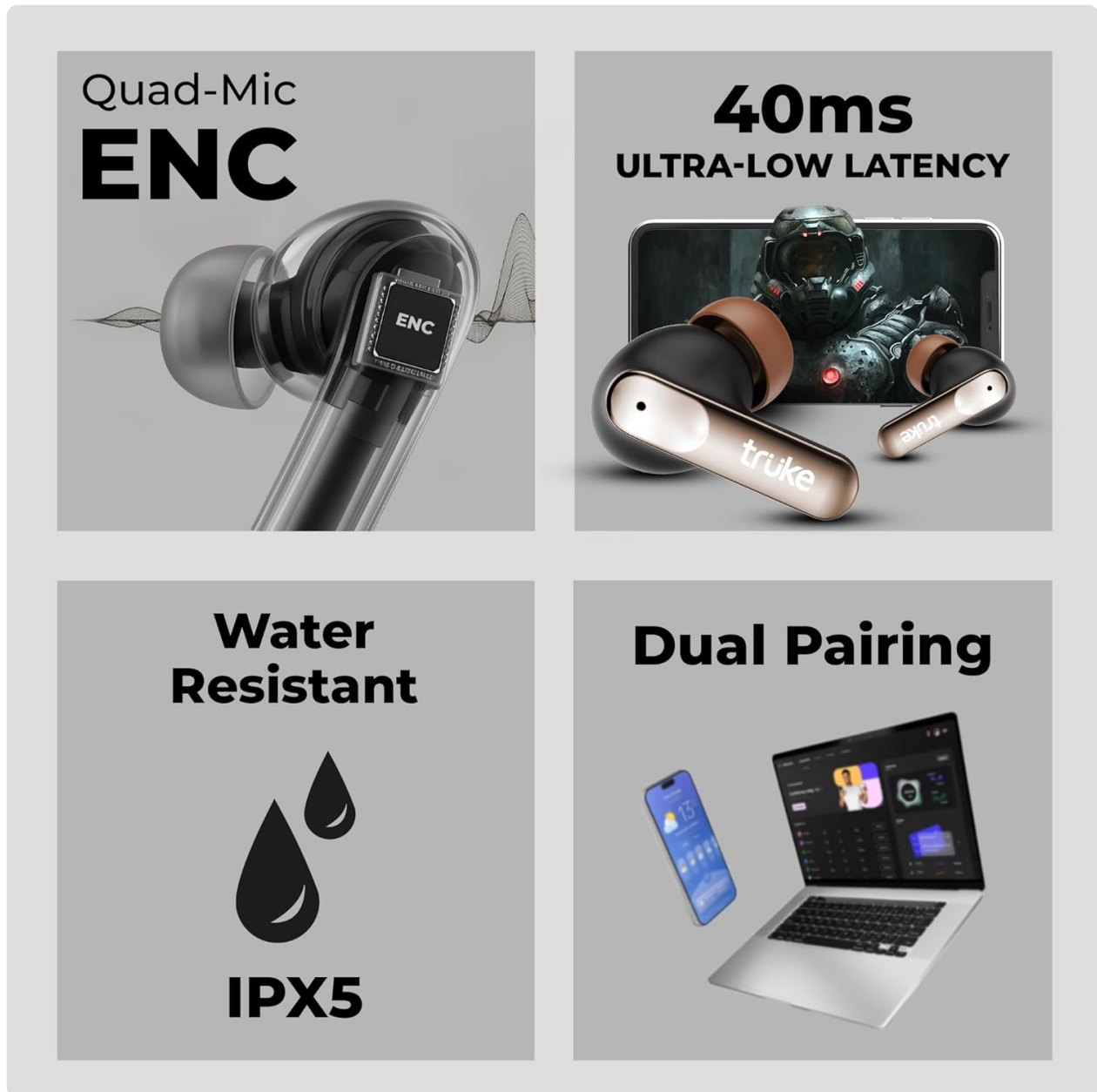
Image: truke Mega 8 Water Resistant IPX5. This image shows a grid of features including 'Water Resistant IPX5' with a droplet icon, indicating the earbuds' resistance to water.

water jets from any direction. They are suitable for workouts and light rain, but should not be submerged in water or exposed to heavy downpours.