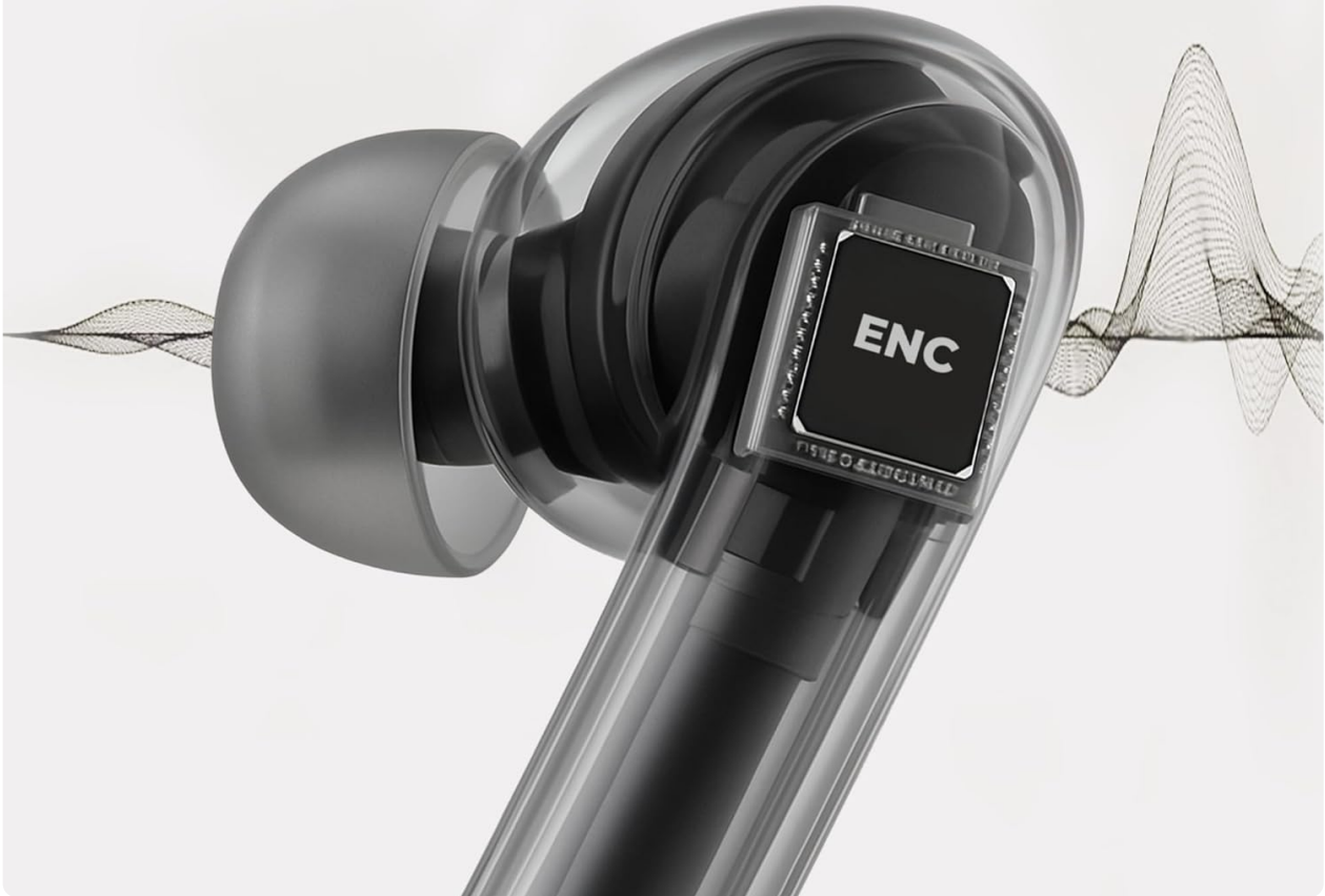
Image: truke Mega 8 Quad-Mic PureVoice ENC. This image provides a close-up, transparent view of an earbud, highlighting the internal ENC chip and sound wave patterns to illustrate noise cancellation.