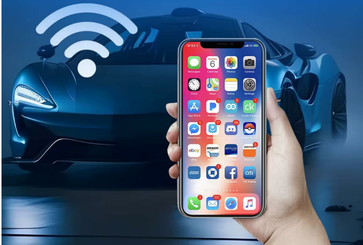
Image depicting a smartphone automatically connecting to a car's infotainment system via the wireless adapter, symbolized by WiFi signals, indicating the automatic reconnection feature.

After connecting the box for the first time, the subsequent car can be automatically connected, intelligent and convenient