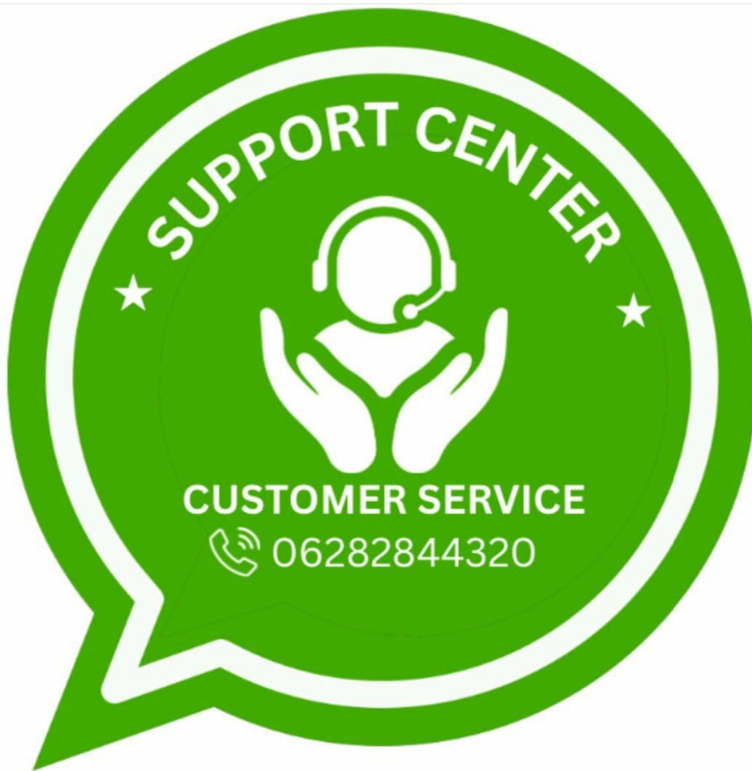
Image of a 'Support Center' badge with a customer service icon and a phone number, indicating available customer assistance for the product.