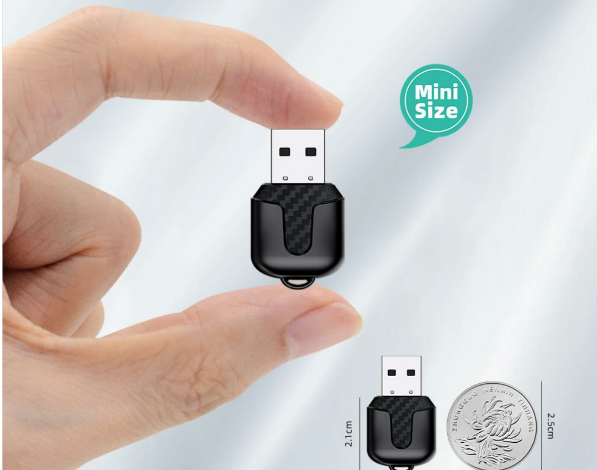
Image illustrating the small size of the EKIY EC16 Wireless Adapter, shown next to a human hand and a coin for scale, highlighting its ultra-miniature design.