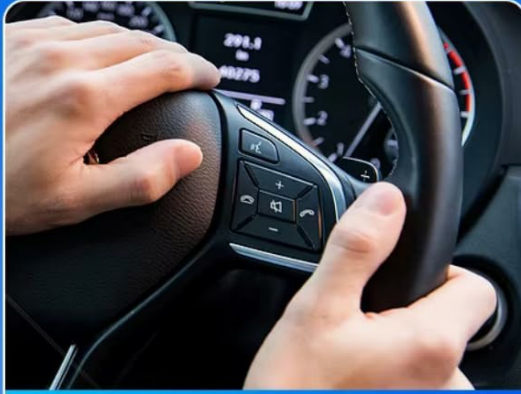
Steering Wheel Control