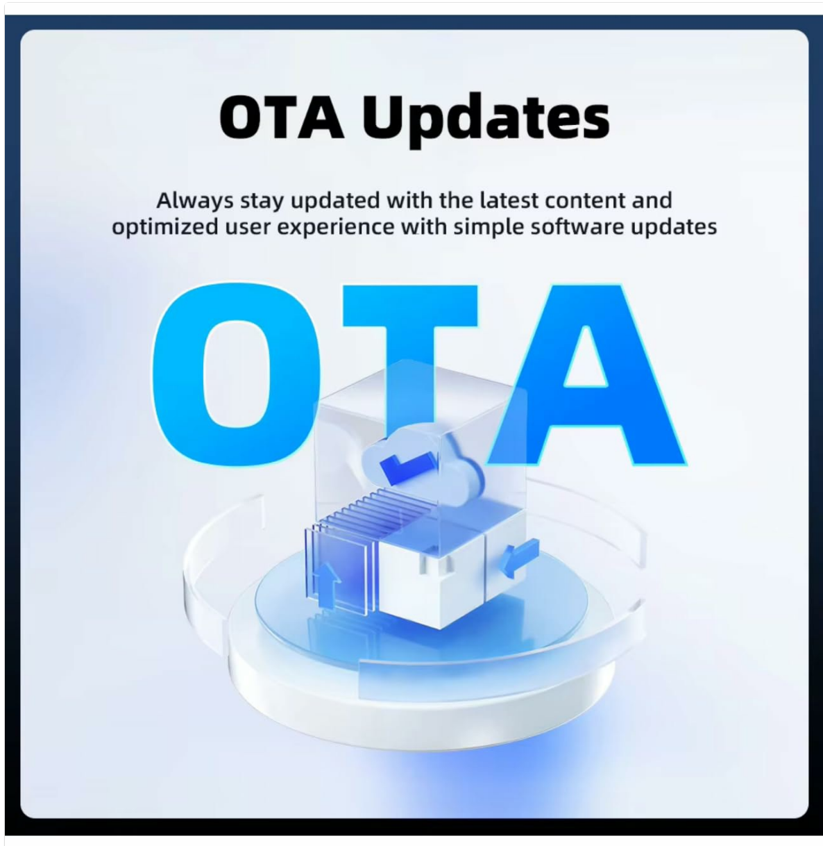
Image illustrating the Over-The-Air (OTA) update process, showing data being wirelessly transmitted to the adapter, ensuring it stays updated with the latest software and features.

The adapter supports OTA updates to ensure it always has the latest features and optimized performance. Connect the adapter to a WiFi network (if prompted) or follow instructions provided by the manufacturer for updates.