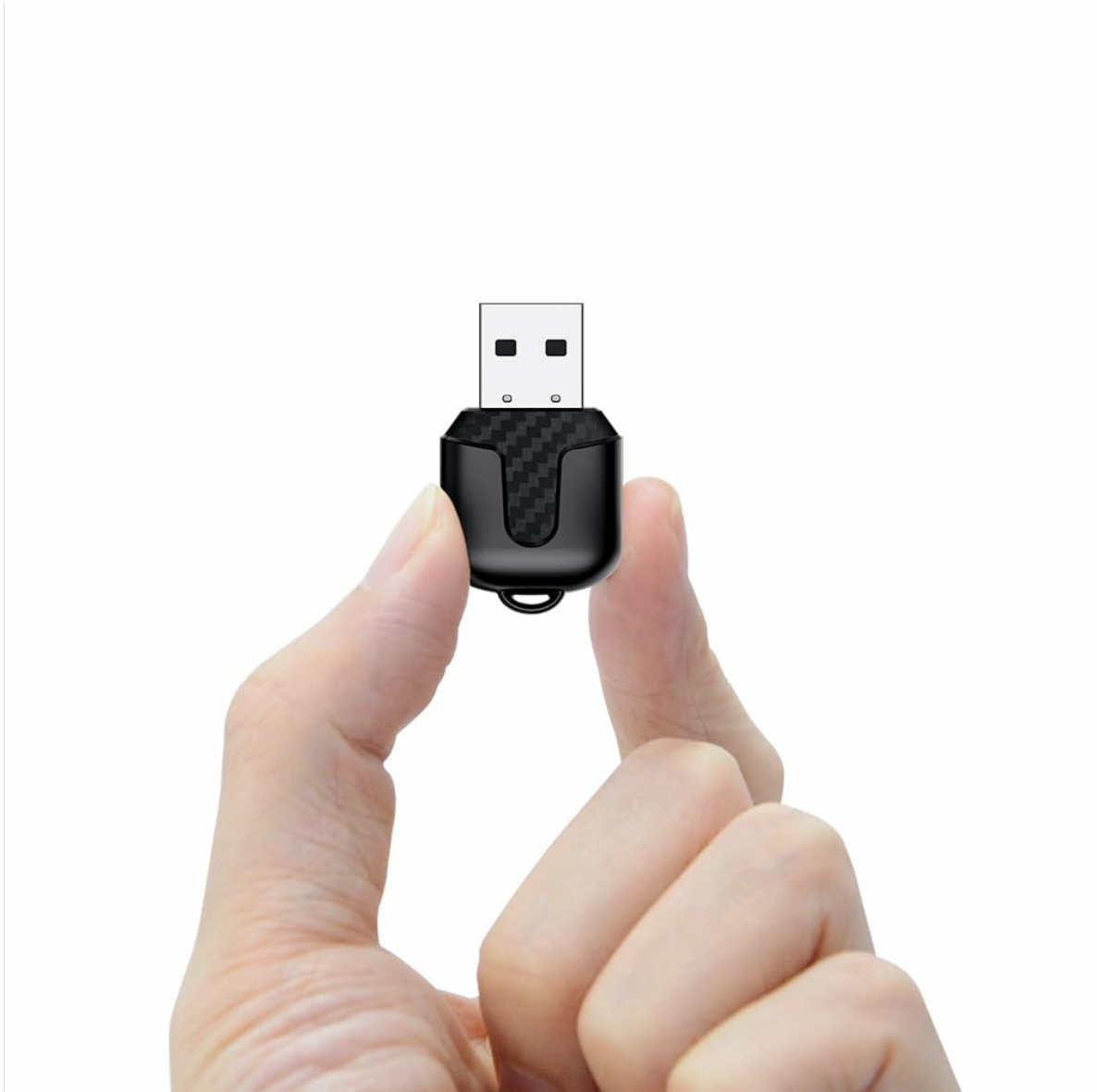
Image of the EKIY EC16 Wireless Adapter, a compact device designed for easy integration into a car's USB port.