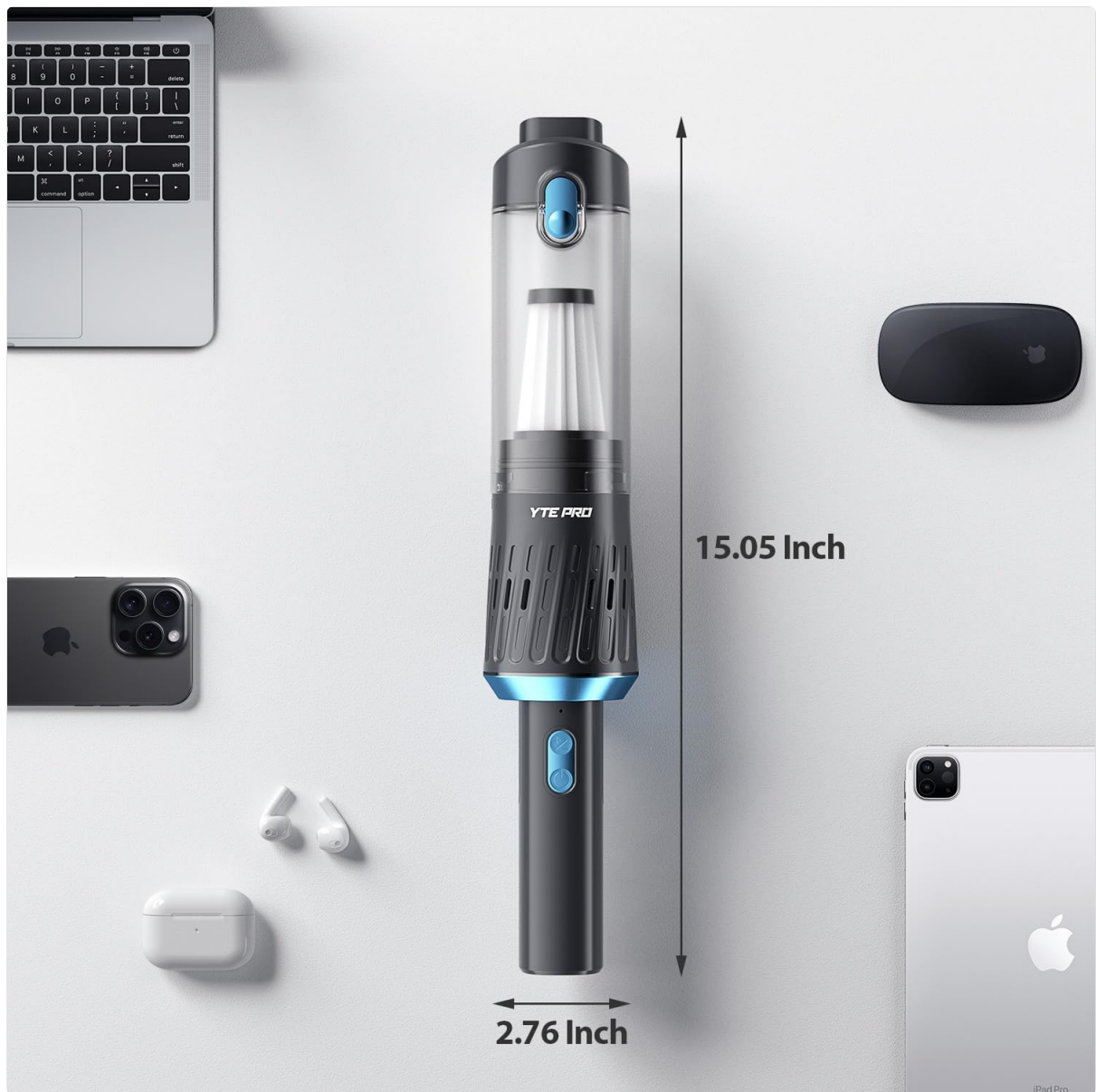
Image: The YTE PRO Handheld Cordless Vacuum with its dimensions clearly marked: 15.05 inches in length and 2.76 inches in width.