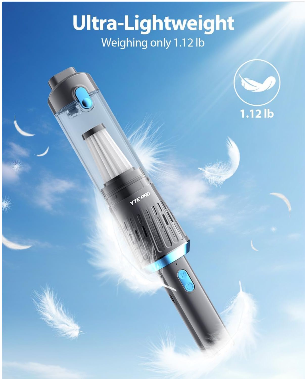
Image: The YTE PRO Handheld Cordless Vacuum, highlighting its ultra-lightweight design (1.12 lb) against a sky background with feathers.

The YTE PRO Handheld Cordless Vacuum VC-D17B1 is a lightweight and portable cleaning device designed for convenience and efficiency. Weighing only 1.15 pounds, its cordless design and ergonomic non-slip handle ensure easy maneuverability for quick cleaning tasks in various environments.