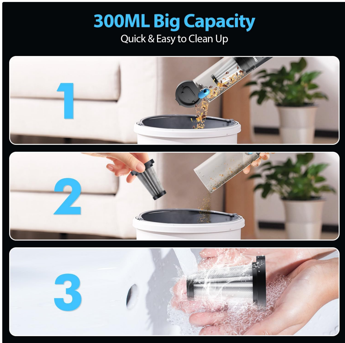
Image: A three-step visual guide showing how to empty the 300ml dust cup: 1) Pressing the release button to empty debris, 2) Removing the filter, and 3) Rinsing the filter under water.

This design minimizes direct contact with dirt.