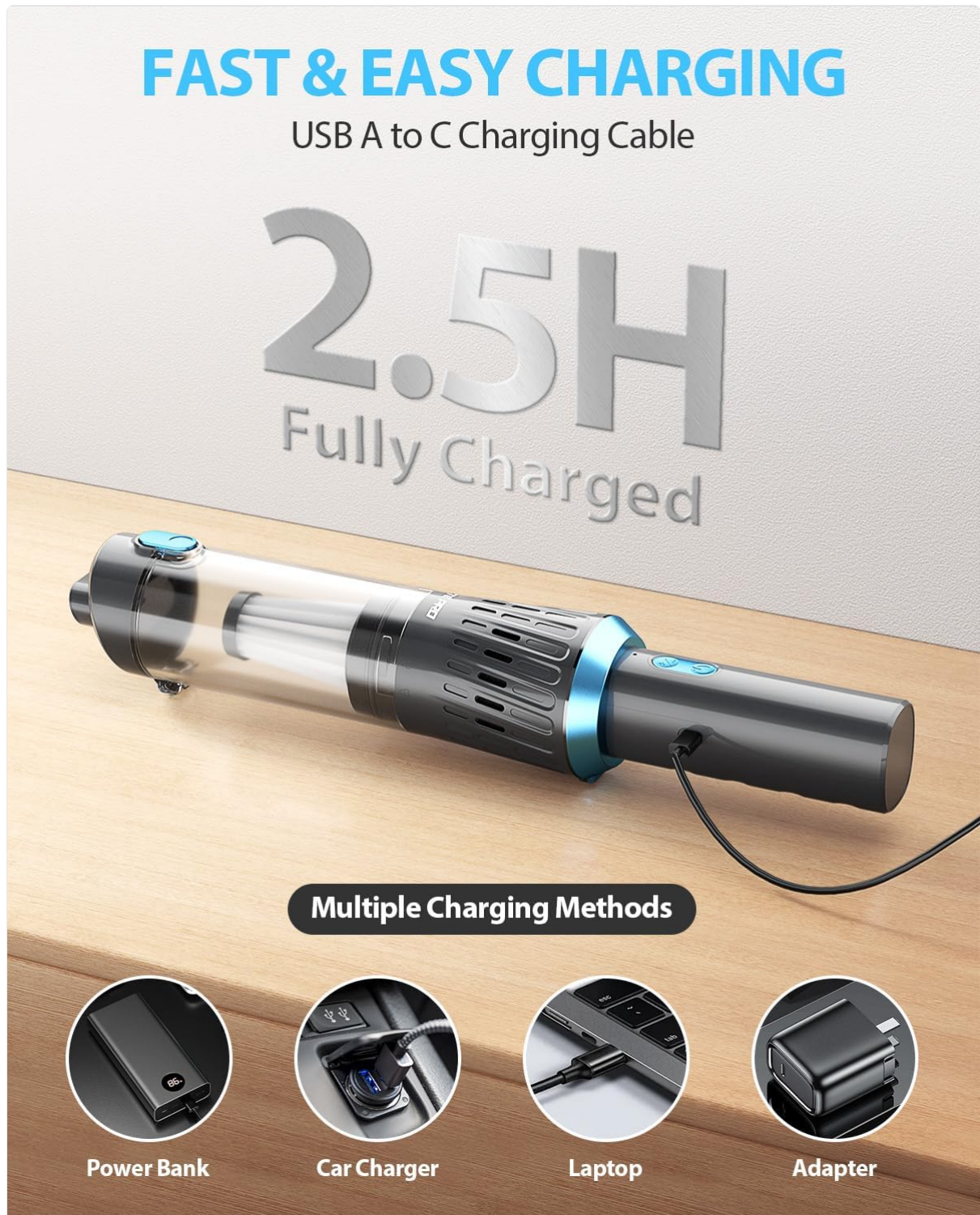
Image: The YTE PRO Handheld Cordless Vacuum connected via a USB-C cable, demonstrating multiple charging methods including a power bank, car charger, laptop, and wall adapter. The image indicates a 2.5-hour full charge time.

Before first use, fully charge the vacuum cleaner. Connect the provided USB A to C charging cable to the vacuum's charging port and a suitable power source (e.g., power bank, car charger, laptop, or wall adapter). A full charge takes approximately 2.5 hours.