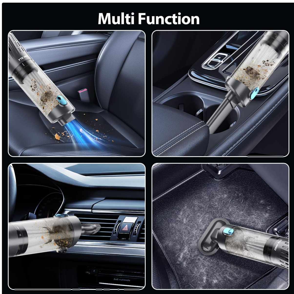
Image: The YTE PRO Handheld Cordless Vacuum being used to clean various parts of a car interior, including seats, cup holders, air vents, and floor mats, showcasing its multi-functional capabilities.