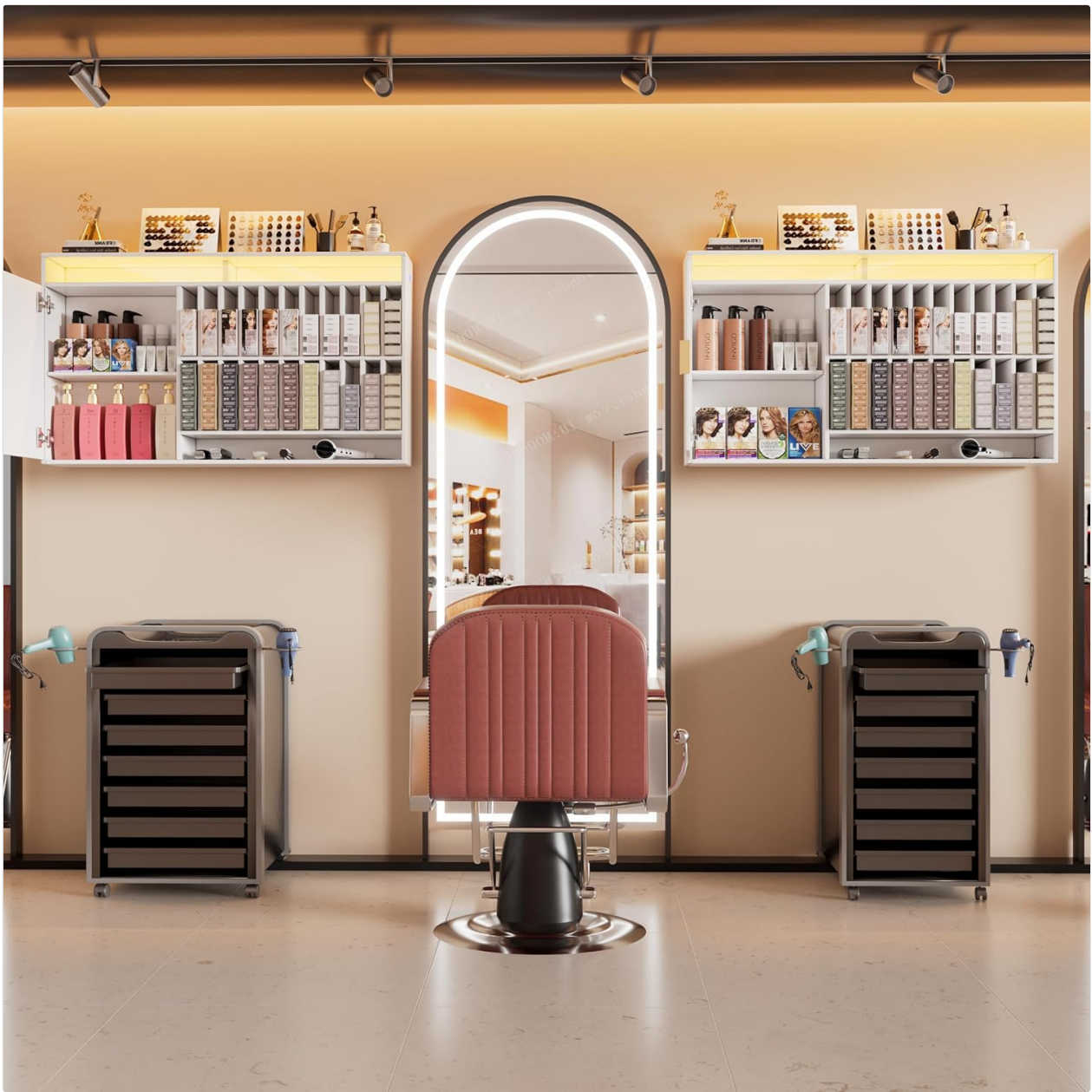
Image 1.1: The PAKASEPT Professional Hair Color Organizer in a salon environment.